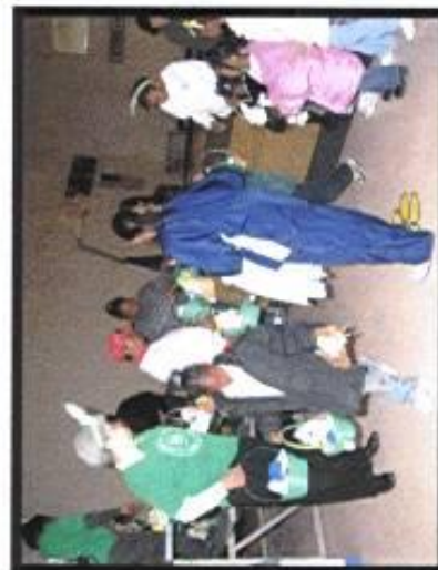
DEBATE: Funniest Skit Contest

“There is a destiny that makes us Sisters, none goes her way alone. All that we send into the lives of others, comes back into our own.”