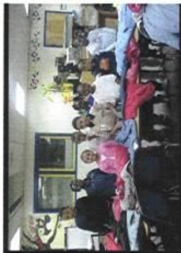
HEALTH: Annual Coat Drive

In 1972, the Continental Societies initiated its national program, "Operation Awareness: HEER (Health, Education, Employment, Recreation) plus Arts & Humanities." Each segment of this program was chosen because of its significance in the lives of young people. Continental women feel a necessity to provide activities and projects in these areas to enhance the lives of the young people they serve.