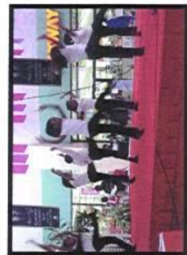
ARTS & HUMANITIES: Annual Festival