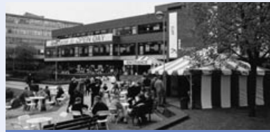
University of Northumbria