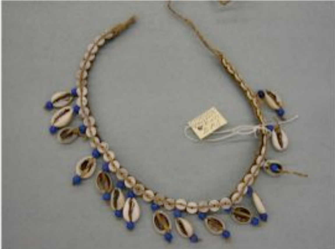
Figure 5. Pokot Woman's initiation headband, 1960s, from Dorothy and Rob Udall Collection, Colorado State University, Fort Collins, Colorado.