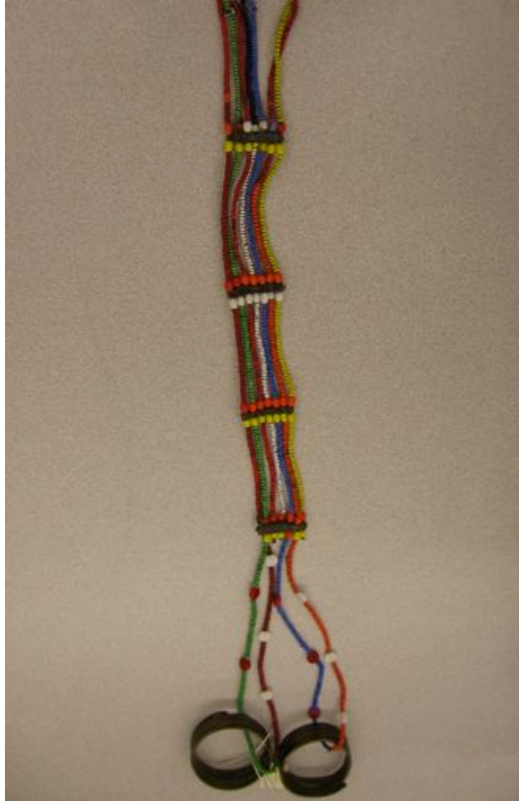
Figure 2. Pokot Woman's headband, sanai , 1960s, from Dorothy and Rob Udall Collection, Colorado State University, Fort Collins, Colorado.