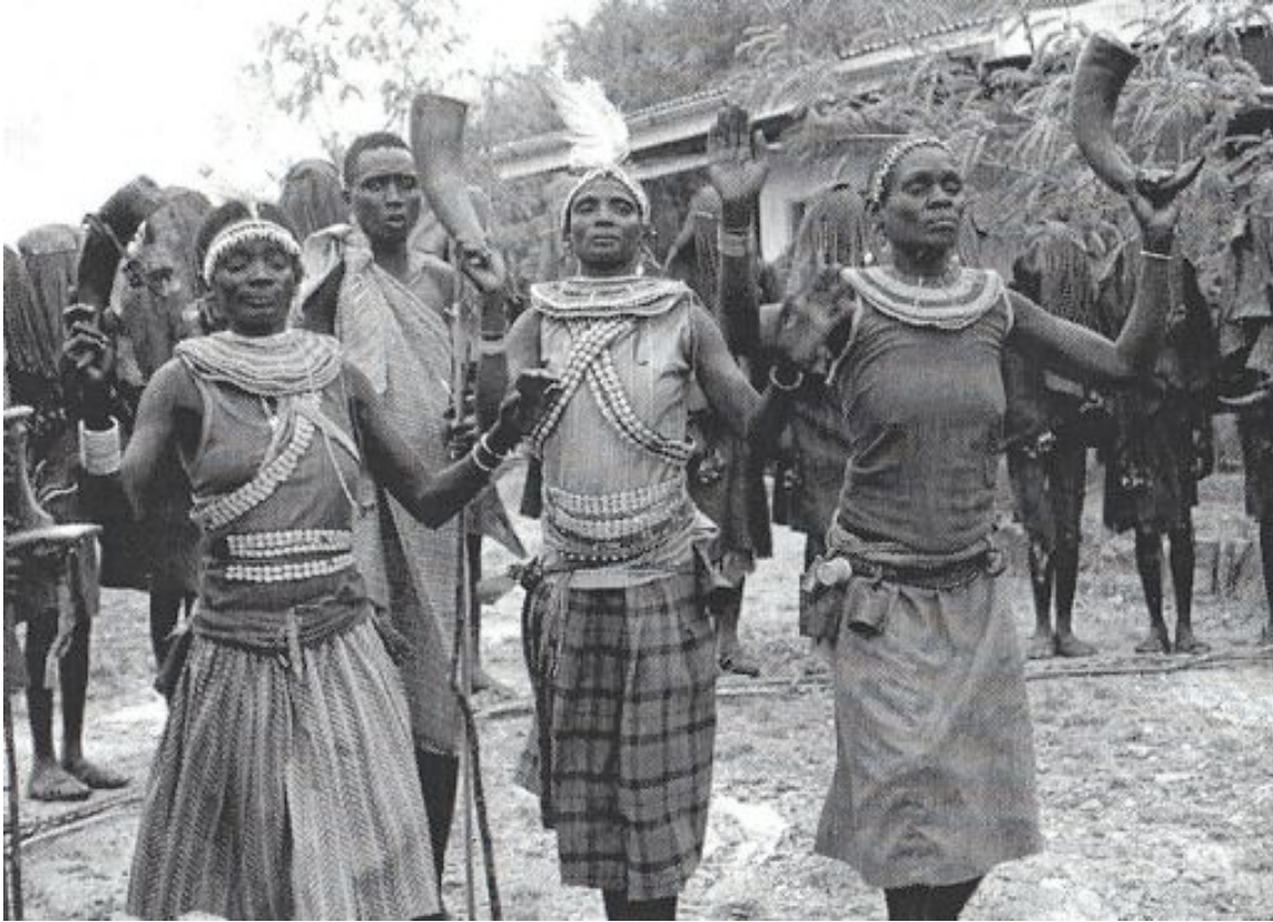
Figure 4. Pokot women wearing pregnancy belts, lökötyö .

Source: Jónsson, Kjartan. "Pokot Masculinity: The Role of Rituals in Forming Men." PhD diss., University of Iceland, 2006.