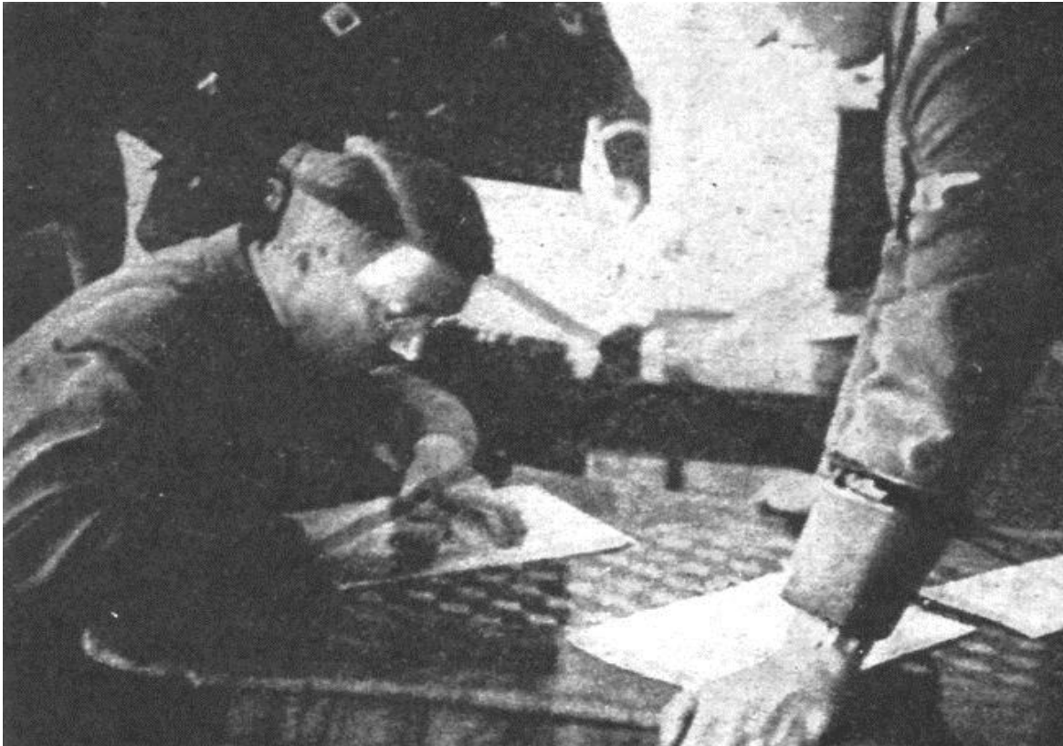
Figure 1: Hitler in glasses.

most striking feature of the picture in comparison to the normal visual discourse of Hitler images. In Hoffman's book, one that contains one hundred and one photographs of the Fuhrer, only one shows him using a magnifying glass to read while only two depict him wearing glasses. Concerning this particular photograph, when this picture came into the view of Hitler, he rejected any further reproduction and circulation of the image outright by chastising Hoffmann for even taking the photograph in the first place (197). In a stroke of outrage, Hitler slashed an "X" through the photo because as Hoffmann later wrote, "No photograph [of Hitler] in spectacles was to be published" (177).