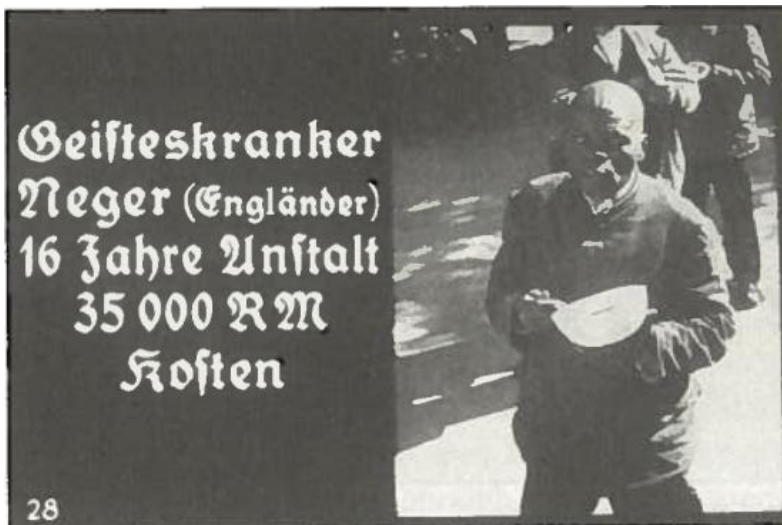
Figure 2: Blindness as a disease. The caption reads, “Hereditarily diseased ‘Negro’ (from England) institutionalized 16 years costs 35,000 RM” (Brueggemann 149).

Her analysis of one of the propaganda photographs featuring one of the so-called genetically contaminated who appears to be blind provides insight into how Nazi propaganda presented blindness as a cause for Othering and elimination, and can help explain why Hitler took such great care to keep his bespectacled image from public view. The analysis concerns the following visual that currently is on display at the U.S. National Holocaust Museum (Brueggemann 149).