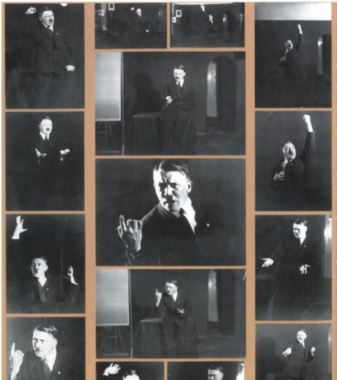
Figure 3.1: 11 Hitler rehearsing elocution.