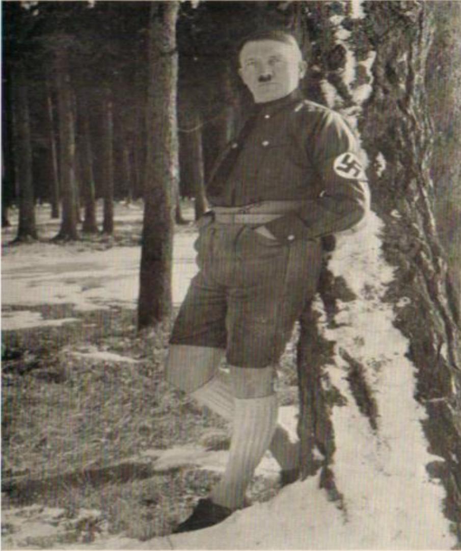
Figure 5: Hitler in shorts.

“success” of the poster in that “...the totality of the impression on a reader and viewer is made by a collaboration of image and word within an economy of display” (Farrell 70). Ultimately, the visual impact of this campaign advertisement assisted in making Hitler’s “powerful” image virtually ubiquitous in the months leading up to the election (Shirer 158). Now, consider Figure 5.