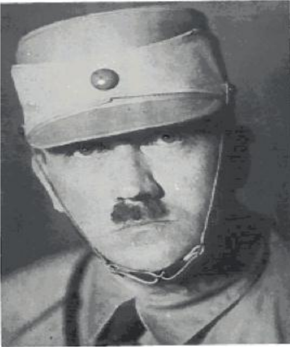
Figure 6: Close-up of Hitler in Stormtrooper uniform.

With the glasses photograph, we have evidence of Hitler with a normative “human failing.” In the elocution photos we see a crafted act rather than innate performance art. The shorts photograph enables us to lay eyes on a figure that further makes known the selection process of Hitler’s deliberate image creation and dissemination. With the SA ( Sturm Abteilung or “stormtrooper”) photo, however, we have a figure that at the very least appears anonymous and un-special in virtually every way. It is important to note as well that out of the images discussed