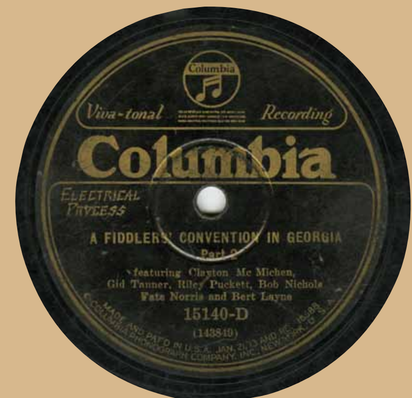
"A Fiddlers' Convention in Georgia"