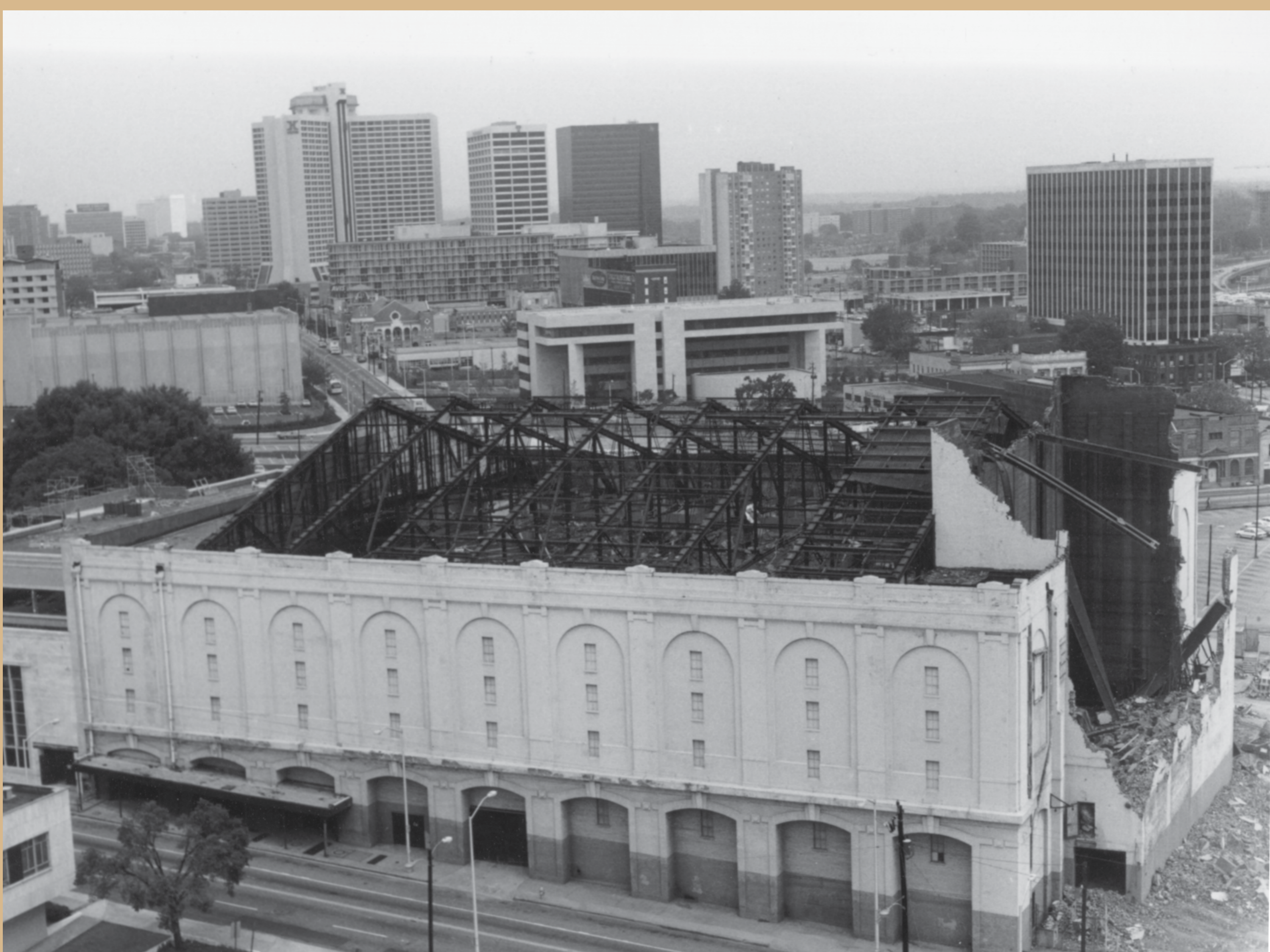
Demolition of the Auditorium, 1981

Atlanta Auditorium-Armory (later known as Atlanta City Auditorium) was built in downtown Atlanta, Georgia in 1909. It was renovated in 1938, and then partially destroyed during a fire in 1940. It reopened in 1943, and was later sold to Georgia State University in 1979.