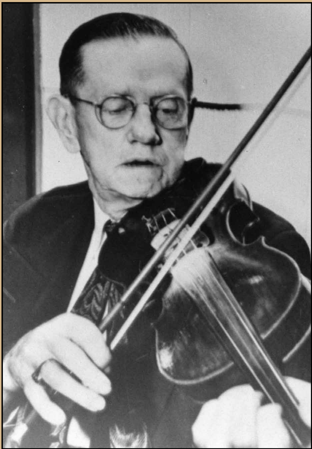
Fiddlin' John Carson