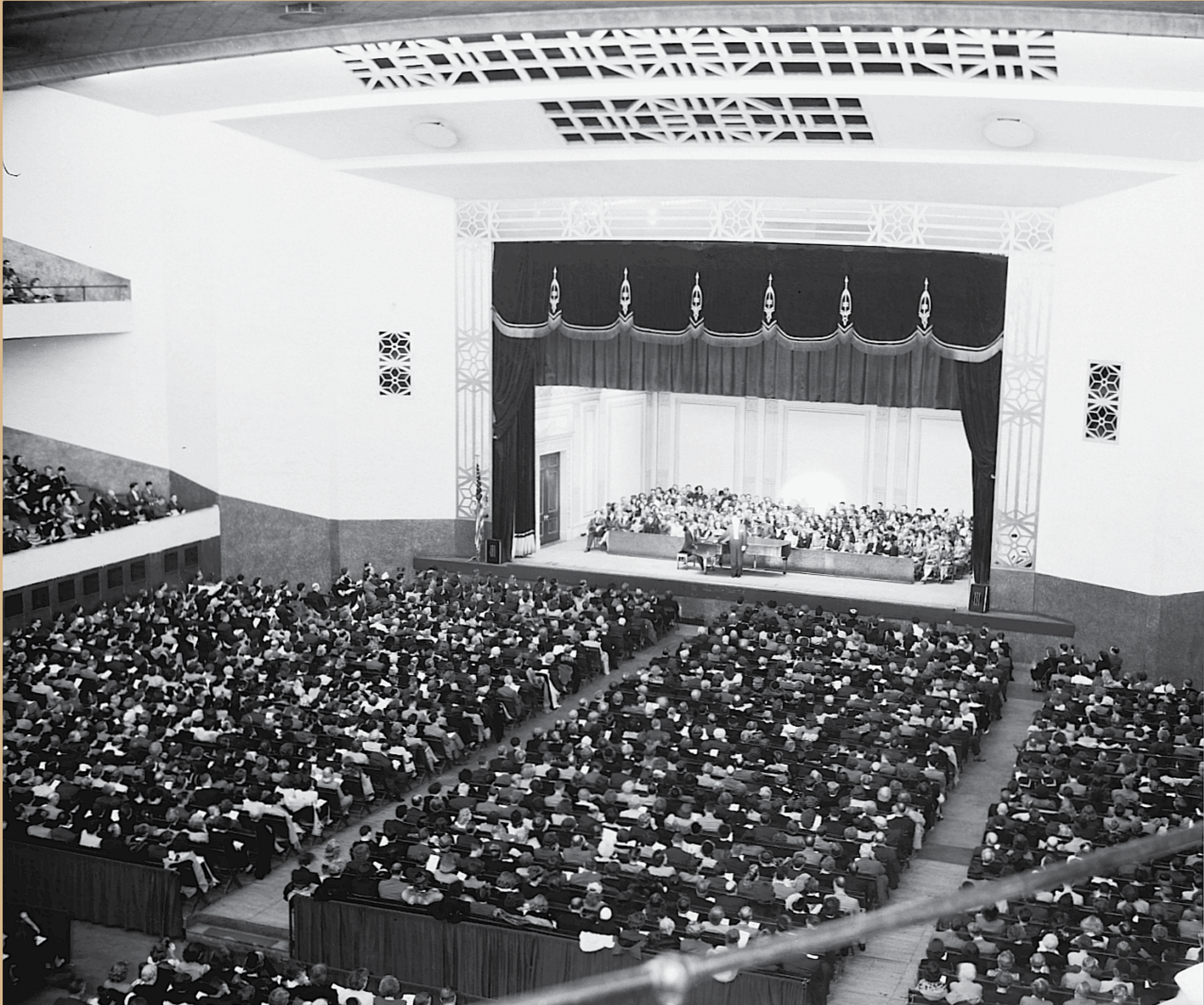
Interior of the Auditorium, 1945

Welcome to Veterans Memorial Hall formerly known as Taft Hall (1909 - ), named in honor of President William Howard Taft who was the honored guest at the dedication of what was then known as the Atlanta Auditorium-Armory of which the hall named in his honor was a part. Taft Hall was the scene of square dances following the last night's event of the annual Georgia Old-Time Fiddlers Conventions.