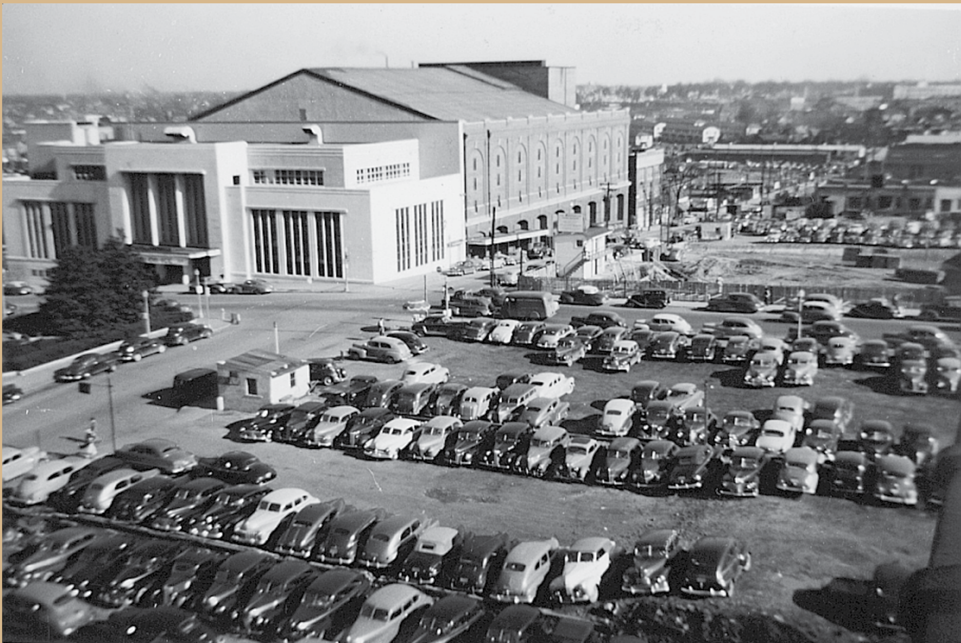
Exterior of the Auditorium, 1949

Welcome to Veterans Memorial Hall formerly known as Taft Hall (1909 - ), named in honor of President William Howard Taft who was the honored guest at the dedication of what was then known as the Atlanta Auditorium-Armory of which the hall named in his honor was a part. Taft Hall was the scene of square dances following the last night's event of the annual Georgia Old-Time Fiddlers Conventions.