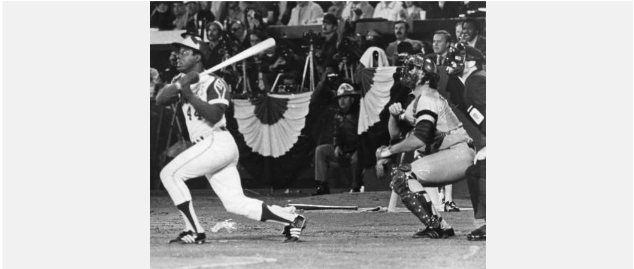
Hank Aaron's record-setting home run swing at Atlanta-Fulton County Stadium, April 8, 1974.

Forty years ago, on April 8, 1974, Atlanta Brave Hank Aaron set the then all-time career record for home runs in Major League Baseball. The record was a significant personal