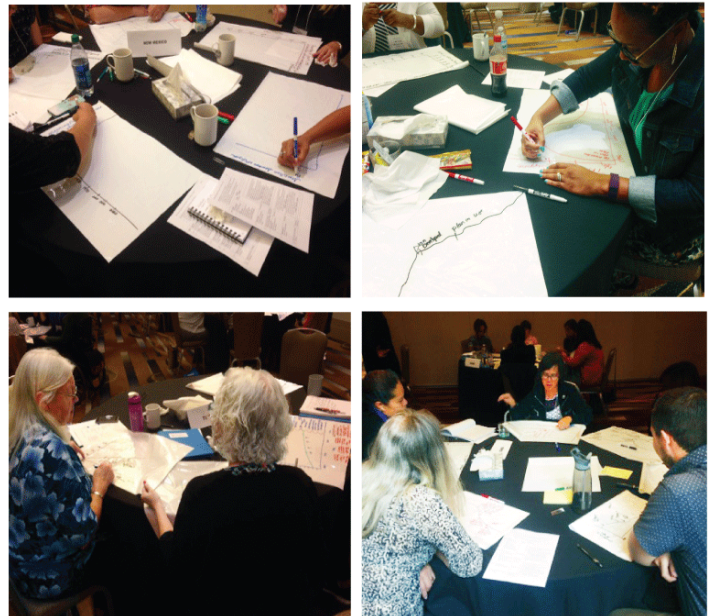
Figure 2. Photographs of maternal and child health practitioners and partners working on behavior over time graphs at the National Maternal and Child Health Workforce Development Center's 2016 Skills Institute.

promotion program over time. At another table, group members each thought about variables that reflected racism in their state, a challenge they agreed affected MCH outcomes in their target population, and annotated BOT graphs showing trends in racism over time. That particular group struggled with indicators that capture racism, a complex social construct, which led to interesting discussions within their team. While the team did not have time to definitively select indicators during the BOT session at the Skills Institute, they started the process of identifying root causes related to their MCH challenge and seeking indicators that reflect those key factors. An alternative approach to asking participants to select variables would have been to provide data about a variable over time and ask the group members to graph 1 or 2 factors that were contributing to the observed data trends, annotating key determinants of those factors (22). Insight can grow when the group integrates their individual graphs to develop a consensus graph that contains multiple variable trends graphed over the same period (10 minutes to discuss). This process requires participants to critique and integrate each other's understanding of determinants of the BOT graph. The BOT graph exercise encouraged individual and collective systems thinking to advance the teams' understanding of a complex MCH challenge.