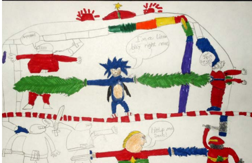
FIGURE 2.2 Tim Okezie's picture

Project idea: ( FIGURE 2.2) Where: Cube all Stars bad guy base, What: kick bad guy butts, Who: Sonic