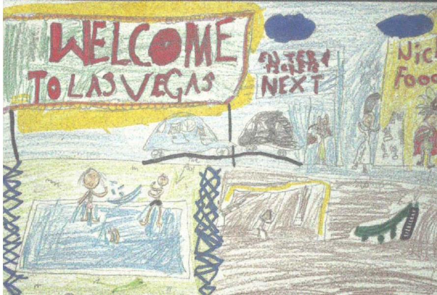
FIGURE 2.3 Maria Martinez's picture

Fluency: Where: 12 ideas What: 11 ideas Who: 14 ideas