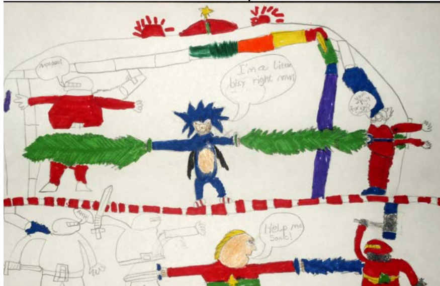
FIGURE 2.2 Tim Okezie's picture

Fluency: Where: 9 ideas, What: 7 ideas, Who: 14 ideas