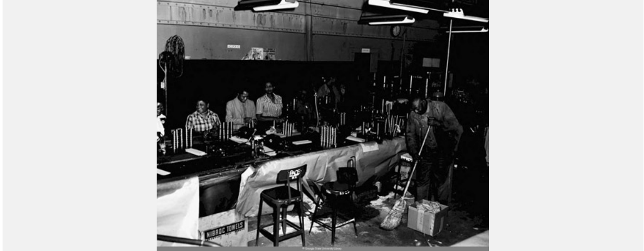
Workers at Scripto (1953)

Dr. King sympathized with and supported the strikers, many of whom were black and members of King's church. The Reverend C.T. Vivian believed an alliance between civil rights groups and the union would help the strikers reach their demands. With the help of King and Vivian, the Southern Christian Leadership Conference and the Chemical Workers Union combined efforts to increase pressure on Scripto. They planned a national boycott, in which over half a million leaflets were distributed to unions asking them to boycott all Scripto products. As the strike progressed, it increasingly took the form of a civil rights initiative. By Christmas 1964, Scripto and the Union reached their first agreement: The union would drop the boycott, if Scripto gave the striking workers their annual Christmas bonuses. On January 9, 1965, the Scripto strike came to an end. The workers received a 4 cent across-the-board increase each year for the following three years, and Scripto was forced to re-hire 155 strikers and retain the replacement workers they had hired to maintain production during the strike. After the strike, racial tensions eased at the Scripto plant.*