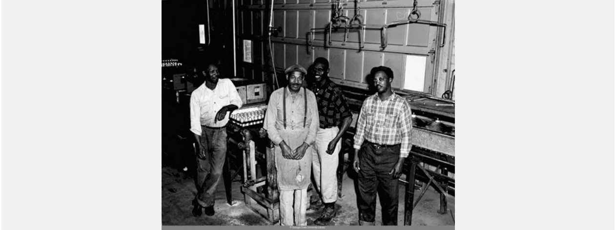
Workers at Scripto (1953)

This was Dr. King's first showing of support for laborers, and he worked to form an alliance between the civil rights movement and labor unions until his assassination on April 4, 1968. At the time, he was in Memphis supporting striking sanitation workers, members of the American Federation of State, County, and Municipal Employees, Local 1733.