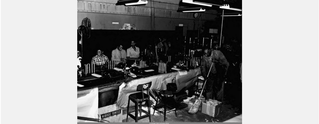
Workers at Scripto (1953)

Dr. King sympathized with and supported the strikers, many of whom were black and members of King's church. The Reverend C.T. Vivian believed an alliance between civil rights groups and the union would help the strikers reach their demands. With the help of King and Vivian, the Southern Christian Leadership Conference and the Chemical Workers Union combined efforts to increase pressure on Scripto. They planned a national boycott, in which over half a million leaflets were distributed to unions asking them to boycott all Scripto products. As the strike progressed, it increasingly took the form of a civil rights initiative. By Christmas 1964, Scripto and the Union reached their first agreement: The union would drop the boycott, if Scripto gave the striking workers their annual Christmas bonuses. On January 9, 1965, the Scripto strike came to an end. The workers received a 4 cent across-the-board increase each year for the following three years, and Scripto was forced to re-hire 155 strikers and retain the replacement workers they had hired to maintain production during the strike. After the strike, racial tensions eased at the Scripto plant.*