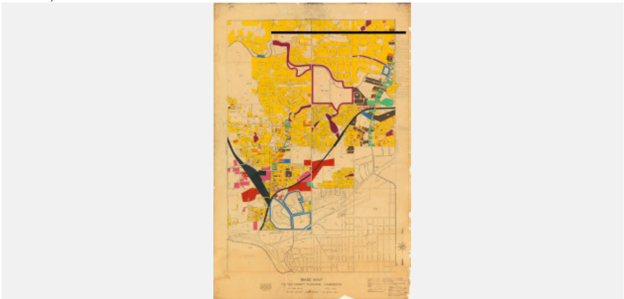
Fulton County Land Use Map

Atlanta Department of Watershed Management's map collection, and was made publicly available through a partnership between the City of Atlanta Department of Watershed Management and Georgia State University Library. The maps from the Atlanta Cadastral Survey represent 16 tax districts within the city. The maps from each tax district are accompanied by an index sheet and a legend. These detailed maps portray built environment features such as width of streets, sidewalk material, undeveloped streets, and much more.