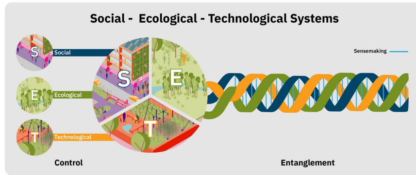
Fig. 2 From control to entangled SETS. Social, ecological, and technological systems can be brought together to improve sensemaking but need to move beyond traditional systems thinking approaches to advising understanding and decision-making within and for entangled SETS. This is represented as a helix of intertwined, dynamic social-ecological, technological systems (SETS) where blue lines are ongoing efforts to make sense of complexity as it evolves and responds to itself and outside drivers and disturbances. SETS helix adapted from 2 .

Novel sensemaking necessitates intentional self-critique and scrutiny over the values, normative dimensions, knowledge, and assumptions about how the world works and how we respond amidst this uncertainty 44,50 . Through sensemaking, institutions can re-imagine and restructure their relationship with SETS, scrutinizing if their values, structures, and functions reflect the entangled social, ecological, and technological domains, thus building towards requisite variety. Even more important, sensemaking requires that governance actors critically question what kinds of urban systems are being co-produced by our institutional goals, designs, and knowledge-generating and management operations 51 . In the following section, we develop several modes that build requisite variety for institutions and facilitate sensemaking in entangled SETS.