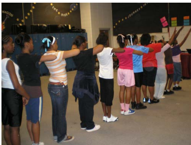
Step Team 1