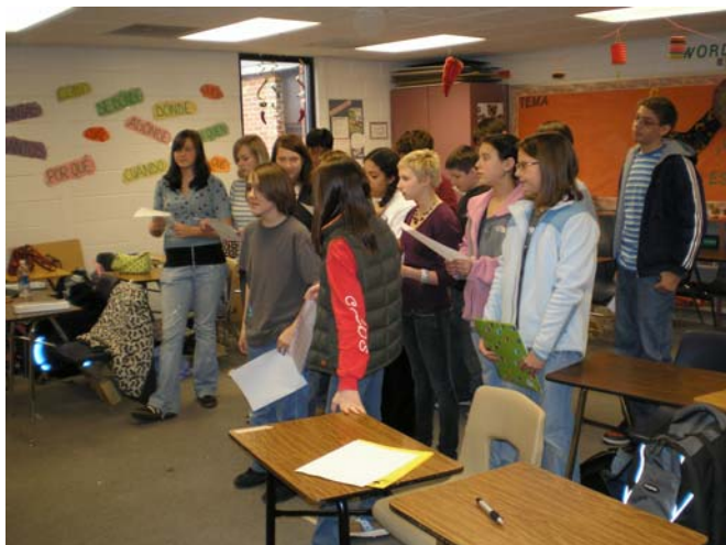
Spanish Club 1