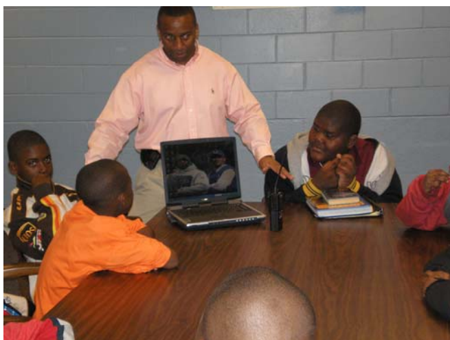
Boys to Men 1