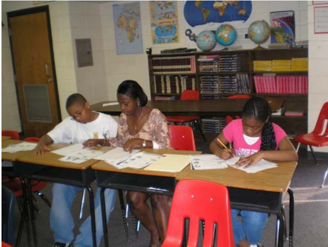
Teaching One-on-One 1