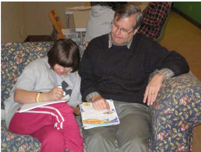
Caring About Life at Home