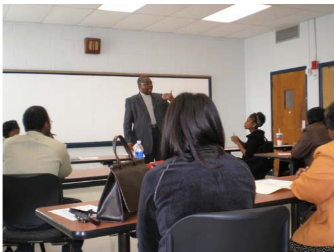
Parent Meeting 1