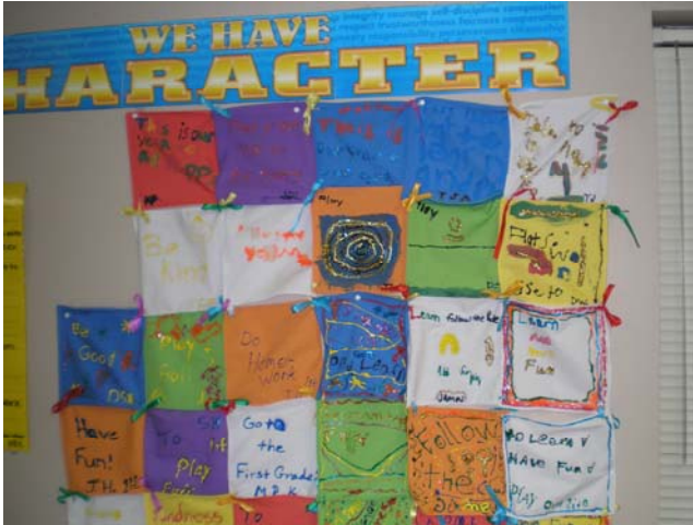
Charter Quilt 1