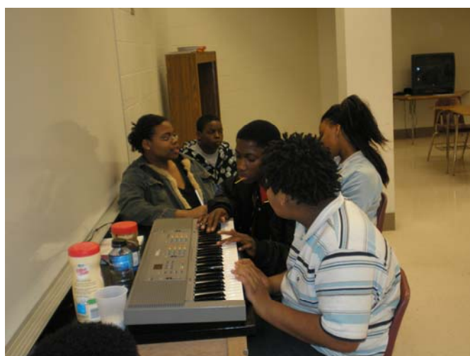
Music and Lyrics 1