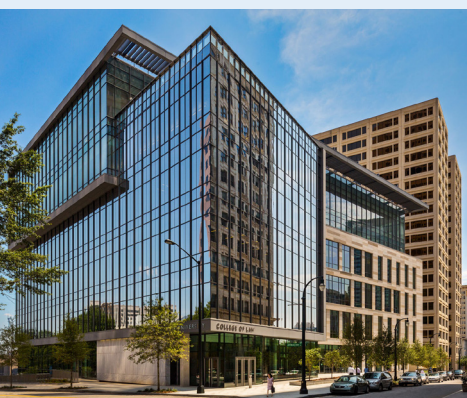
New GSU College of Law building.