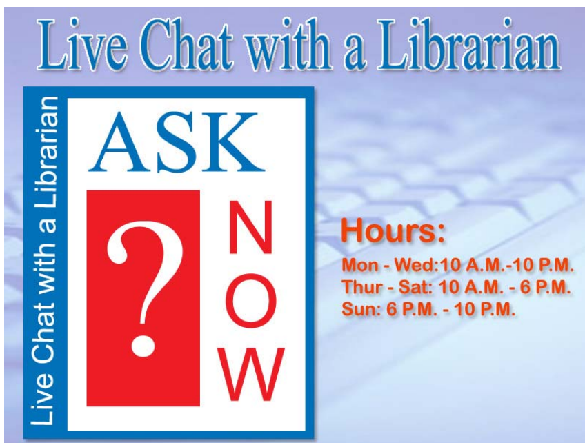
Figure 2: Screensaver and Bus Poster

Another tactic involved a no-cost and widely visible communication mechanism: public workstation screensavers. There are 250 computers in the five library reference centers. In addition, there are approximately 1,158 computers in computer information systems (CIS) laboratories across campus. The Marketing Committee developed a simple screensaver that contained the ASK NOW logo and the hours of operation for the service. See Figure 2. The screensaver was displayed on library workstations beginning in September 2005 and has continued as part of a set of rotating images since that time. In addition, the screensaver was displayed in CIS labs, in two-week intervals, three times during the fall semester 2005.