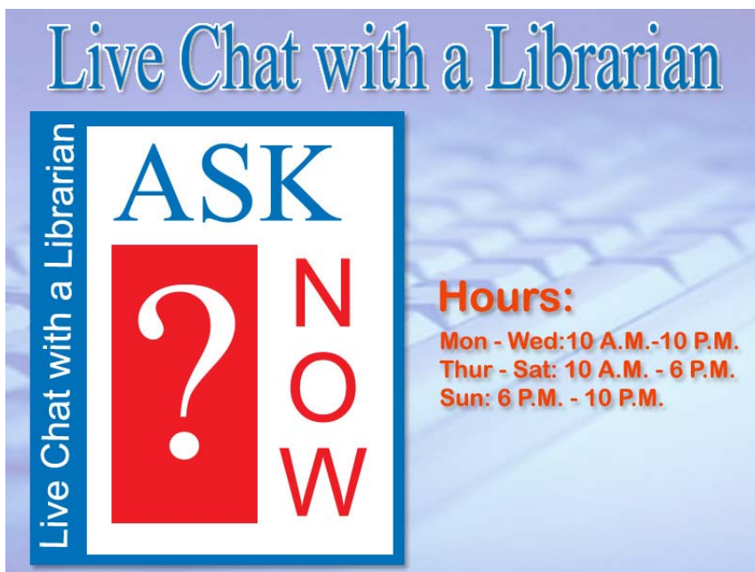
Figure 2: Screensaver and Bus Poster

Another tactic involved a no-cost and widely visible communication mechanism: public workstation screensavers. There are 250 computers in the five library reference centers. In addition, there are approximately 1,158 computers in computer information systems (CIS) laboratories across campus. The Marketing Committee developed a simple screensaver that contained the ASK NOW logo and the hours of operation for the service. See Figure 2. The screensaver was displayed on library workstations beginning in September 2005 and has continued as part of a set of rotating images since that time. In addition, the screensaver was displayed in CIS labs, in two-week intervals, three times during the fall semester 2005.