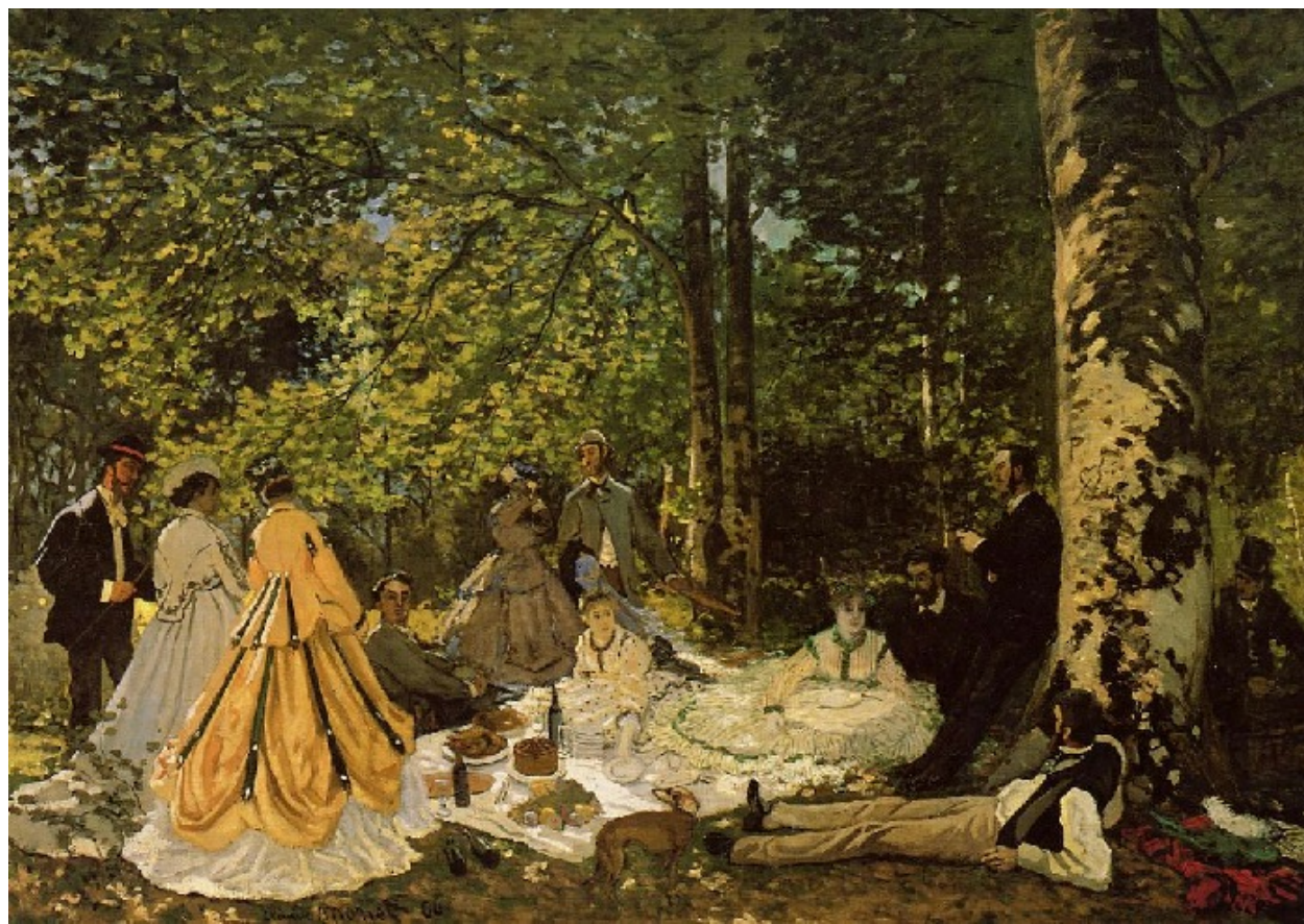
Figure 1. Claude Monet, Luncheon on the Grass . 130 x 180 cm. Pushkin Museum of Fine Arts, Moscow.