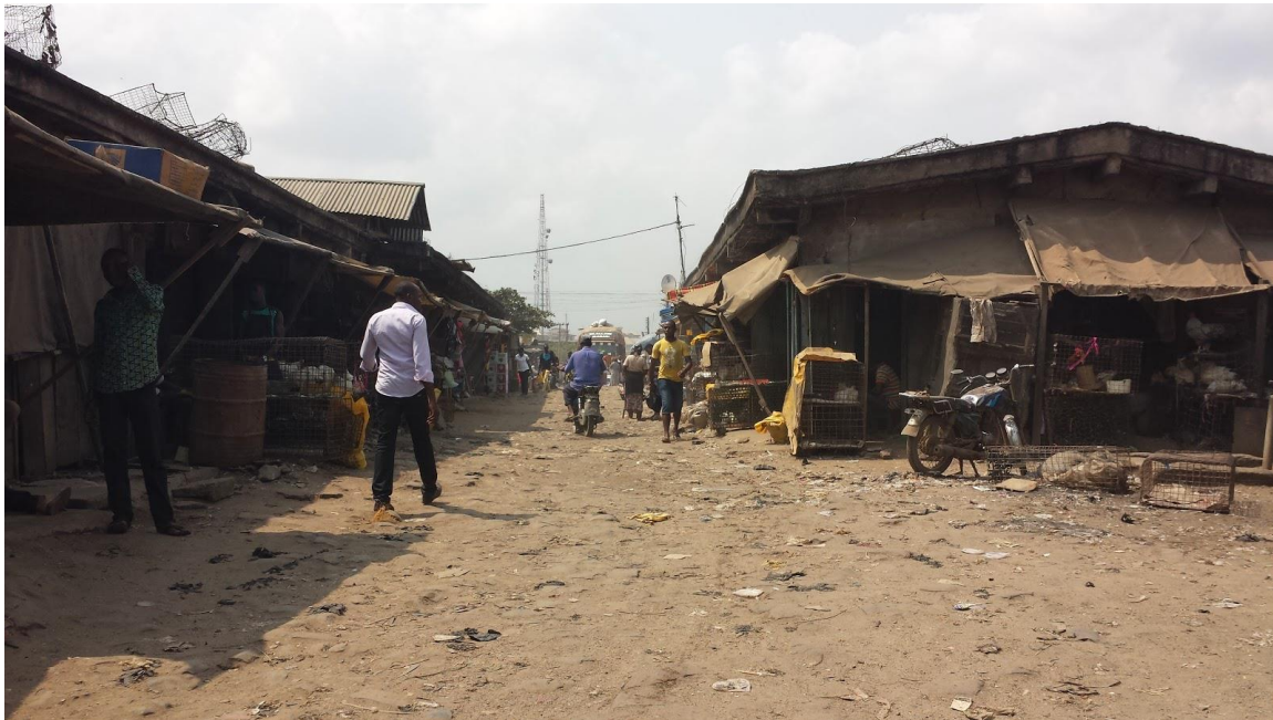
Figure 3.2: Trash Outside of Ariaria International Market, Aba, Nigeria.

The solid waste management in Aba is carried out by private organizations and the Abia State Environmental Agency. 51 The landfill is situated at the outskirts of the town; however, there are numerous dump sites in residential areas. 52 Most roads are filled with refuse which leads to flooding especially during the rainy season. In Aba, daily trash is generated faster than the rate of removal to final disposal sites, so mammoth trash heaps litter the town for days. 53 The offensive odor from the city's many putrefying heaps disturbs residents and visitors. 54 From personal experience, Aba is known for its poor