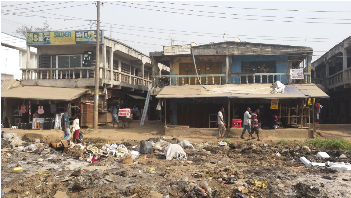
Figure 3.1: Trash Outside of Ariaria International Market, Aba, Nigeria. (Omenka Helen Uchendu, 2016).

southeastern Nigeria because there is a concentration of large-scale industries and four major markets. 49 The town is a major economic hub for the sale of textiles, pharmaceuticals, plastics, timbers, and cosmetics, as well as for shoe manufacturing industries and the Ariaria International market, which is the biggest outdoor market in West Africa (Figure 3.1; Figure 3.2). 50 The city also has brewery, distillery and other handicrafts.