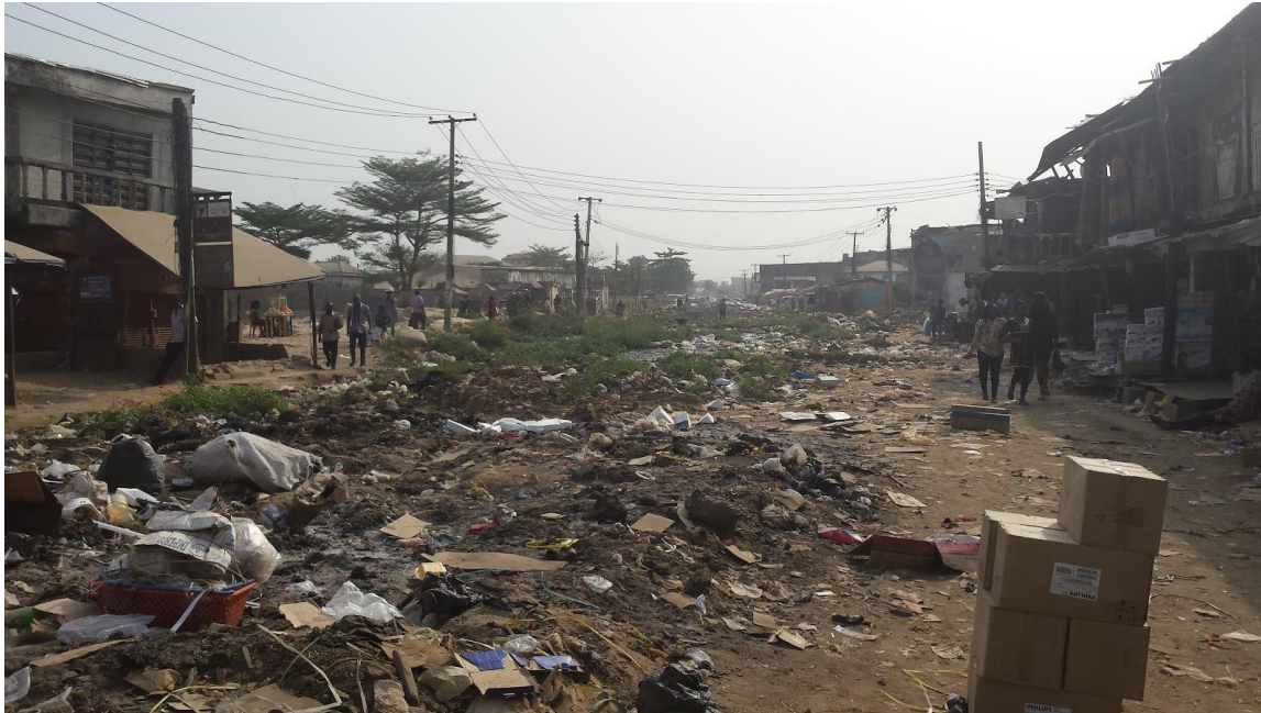
Figure 1: Trash Outside of Ariaria International Market, Aba, Nigeria. (Omenka Helen Uchendu, 2016).

bottle caps and scraps merge with the palm trees, the guava trees, the pawpaw, plantain, and udara trees (Figure 1).