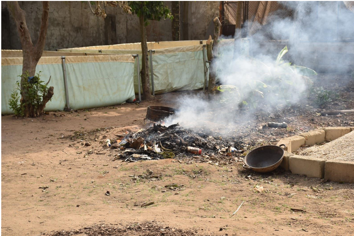
Figure 4: Burning Household Waste in Aba, Nigeria. (Omenka Helen Uchendu, 2016).

Burning of waste, another form of improper garbage disposal, has a well-documented association with the incidence of respiratory health symptoms among adults and children (Figure 4). 65