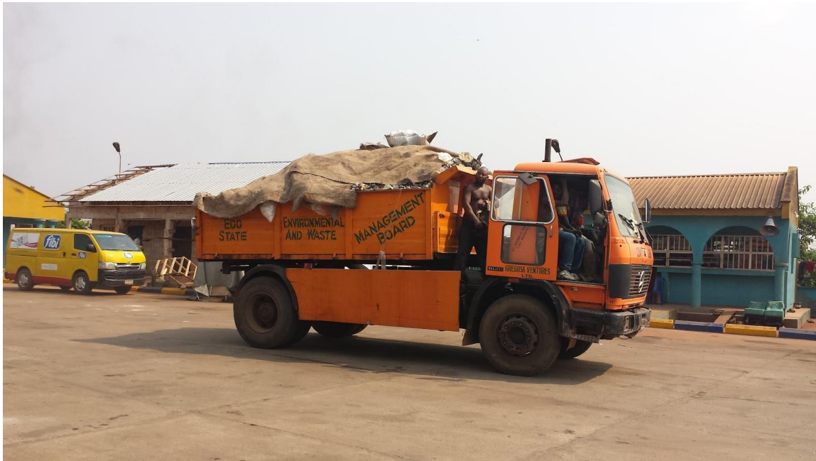
Figure 5. Edo State Environmental and Waste Management Board Garbage Truck. (Omenka Helen Uchendu, 2014).

350 metric tons of waste daily, but has only 76 garbage bins. Another example is the waste management agency, Karu Zone in the city of Karu in central Nigeria. The agency has only three functional garbage vans for the collection and transportation of solid wastes, and one truck for compacting the waste before burning (Figure 5). 116