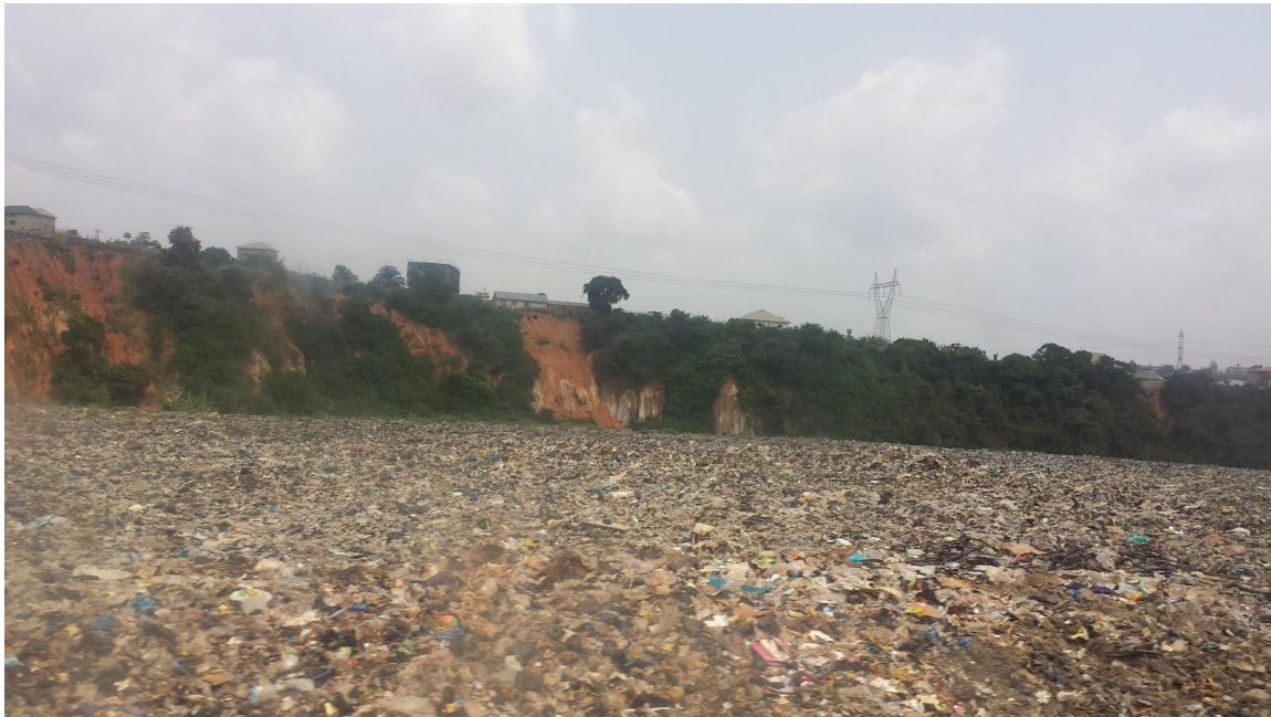
Figure 6: Dumpsite seen while driving from Lagos, Nigeria to Aba, Nigeria. (Omenka Helen Uchendu, 2013).

Poor management of municipal waste in Nigeria causes disease epidemics, blockages of drainages and waterways, flooding and subsequent loss of life and property, road blockages due to trash heaps, and the release of dioxins and furans from the burning of municipal and agricultural waste (Figure 6). 152 Considering the deleterious health effects of improper waste management, policy changes to encourage proper waste management are potentially beneficial to urban dwellers. Possible benefits include reduced infectious disease rates and reduced mortality, as well as an improved quality and outlook on life, based on a clean environment.