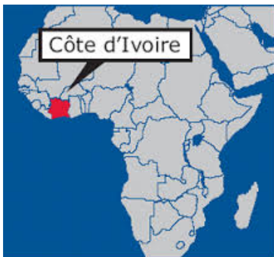
Figure 2: Map of Côte d'Ivoire within Africa

At this point, it appears useful to link these recommendations to the context of the immunization system in Côte d'Ivoire. In this middle-income sub-Saharan country located in West Africa (figure 2), there exists a 38 year-old expanded program of immunization. This program targets 861,112 children aged 0-11 months in the year 2016 (DCPEV, 2015).