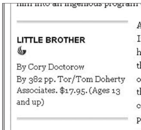
Figure 1. Visit this article online for detailed images.

LibX scans pages as the browser loads them and checks for metadata, such as book and article citations. When it detects a citation—