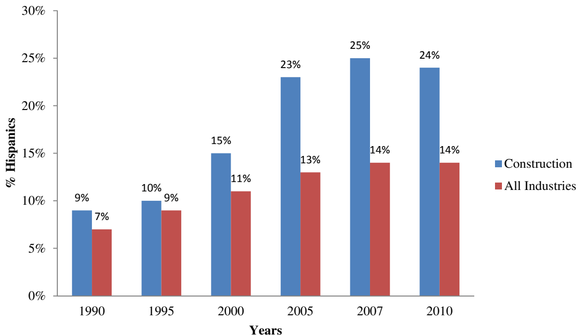
Figure 1. Hispanic workers as a percentage of construction and all industries, selected years, 1990-2010 (All employment)

Source: The Center for Construction Research and Training, 2014