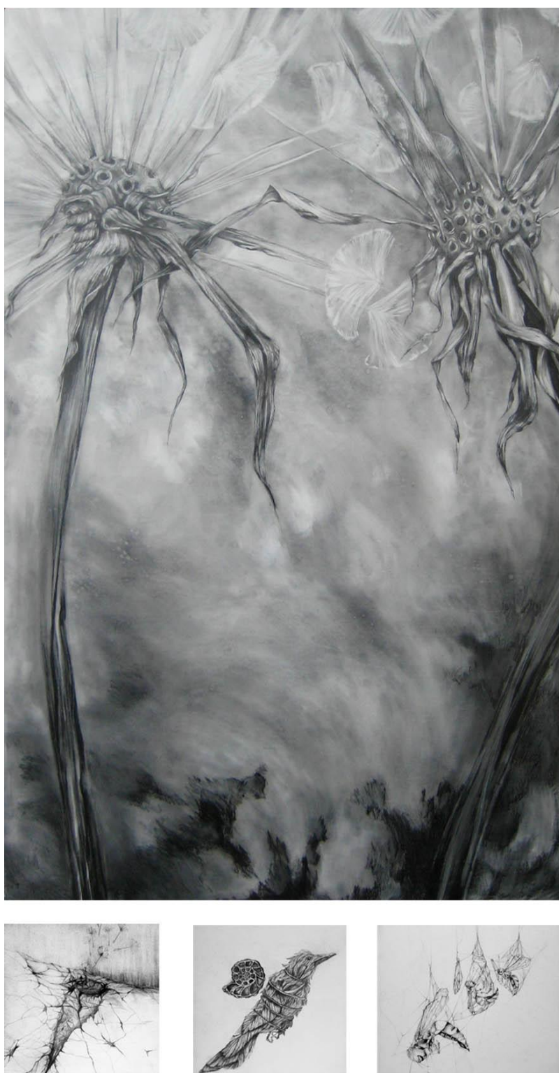
Figure 10 Big Wish