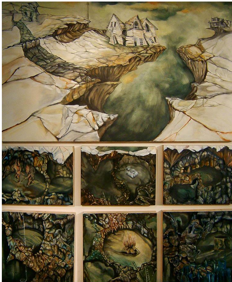
Figure 4 Plato's End

for communion and a place for storytelling where myth is born. In the cave above the fire circle is a single bed, a metaphor for dreaming. To the left of the bed hang hogs (Swine), a symbol of the inevitable sins of humanity. In the cave beneath hangs a white cord that offers an escape route for the redeemed. To the right of the cave with the bed, sits an empty cave and beneath is a cave with a leaking well, representing the deficiency of our ingenuity.