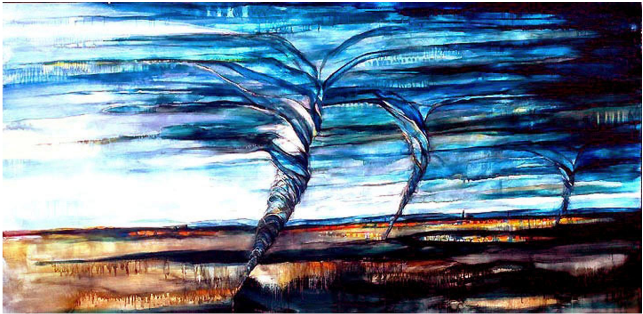
Figure 5 Tornado Landscape

Even before I was conscious of it, the idea of 'Ecological Apocalypse' was present in my works, starting with my Natural Disasters series, which I first presented in a solo exhibition entitled Deluge in 2005. This show consisted largely of works that included depictions of tornados and flooded landscapes.