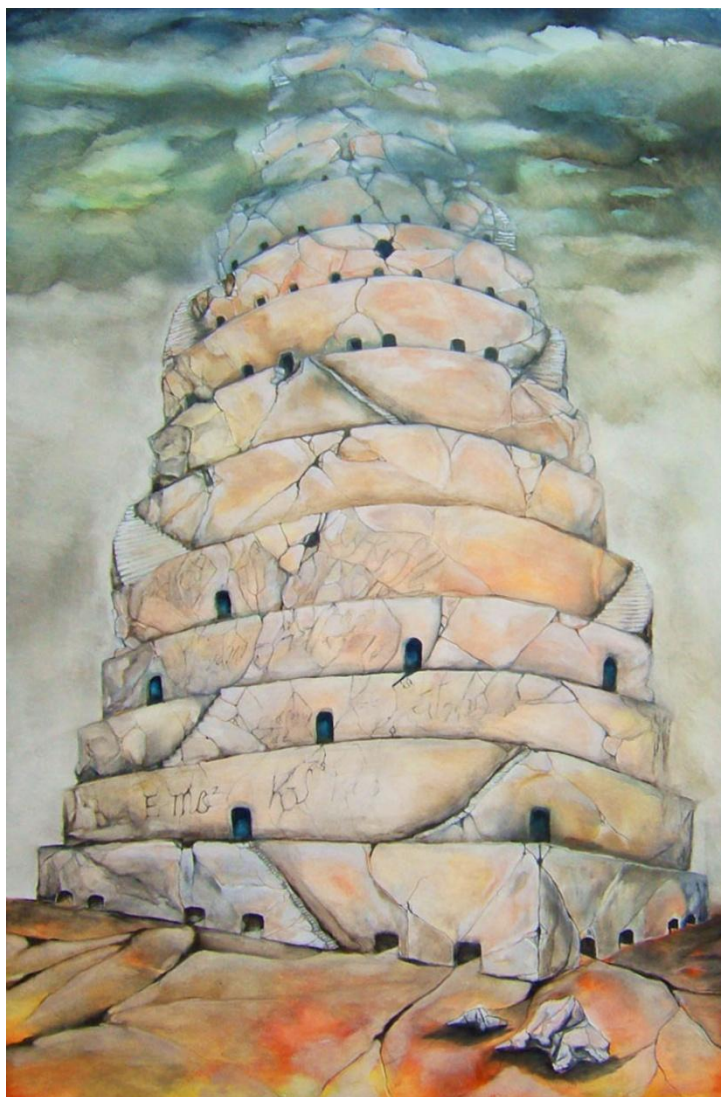
Figure 1 The Tower Of Babel

In my painting of “The Tower of Babel”, I use a triangular composition, which causes the tower to reach into the heavens in an upward, thrusting gesture. The phallic nature of this composition represents mankind’s hubristic conquests. The tower, however, is imperfect in its construction – it breaks apart as it leans away from the viewer’s perspective and seems as if it may topple over at any moment. The flesh tones of the palette represent the body. The surface of the tower is encrypted with the mathematical notations that describe Einstein’s discovery known as E=mc^2 , which led to science that