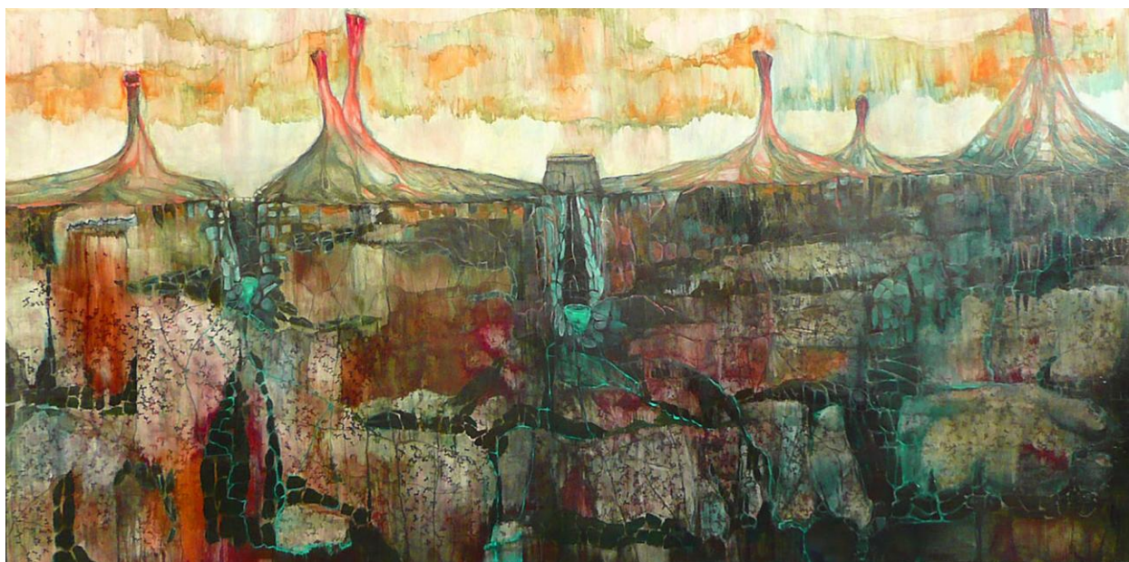
Figure 2 Beyond 1984

The impending apocalypse seems to be culturally ingrained in our psychology and informed by the myths of the past. Mythoi are born predominantly out of a fear of death and influence humanity's vision of the future. George Orwell writes, "Myths which are believed in tend to become true." 1 This sentiment influenced the first painting of my 'The Future Apocalypse' series, "Beyond 1984."