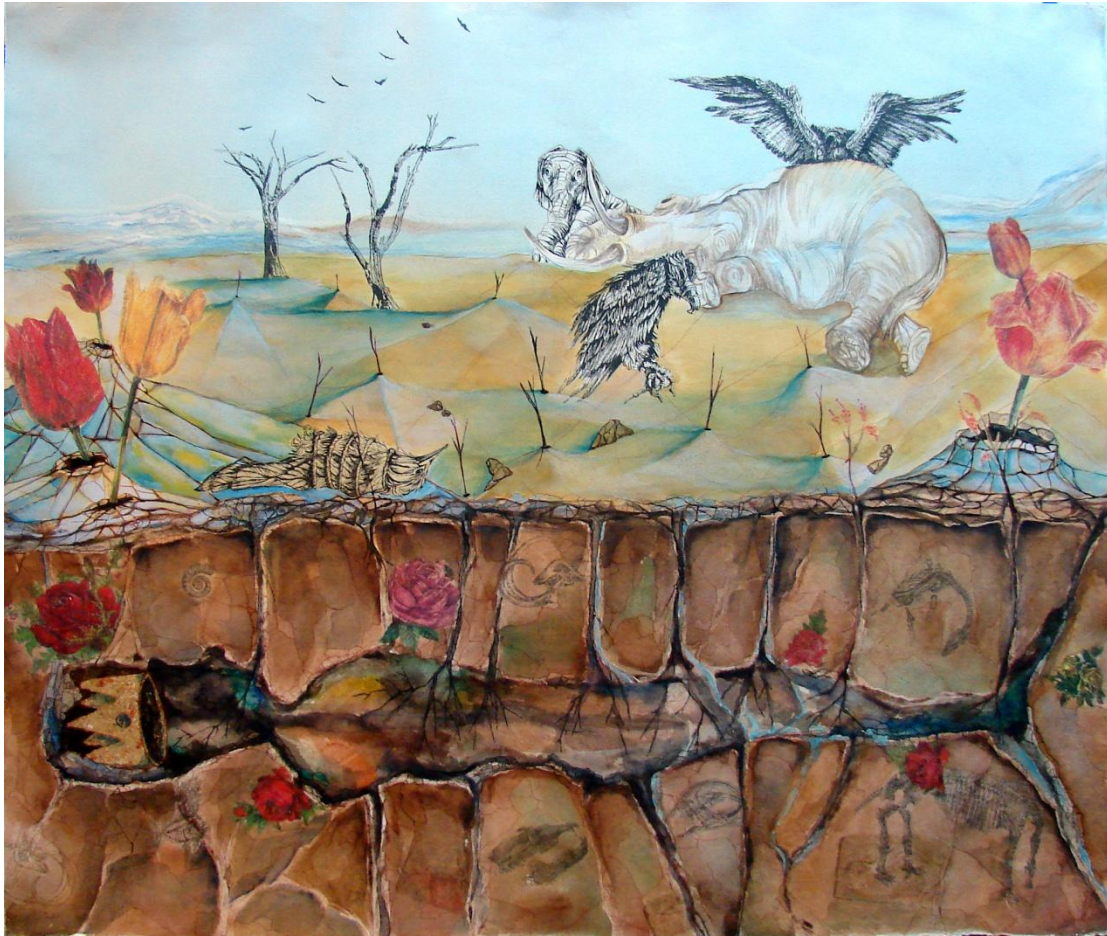
Figure 8 She Is Gone, Mono-print