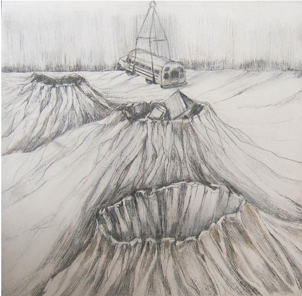
Figure 14 Dropped