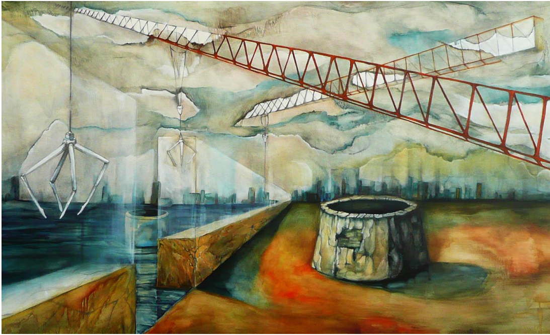
Figure 11 The Water Museum