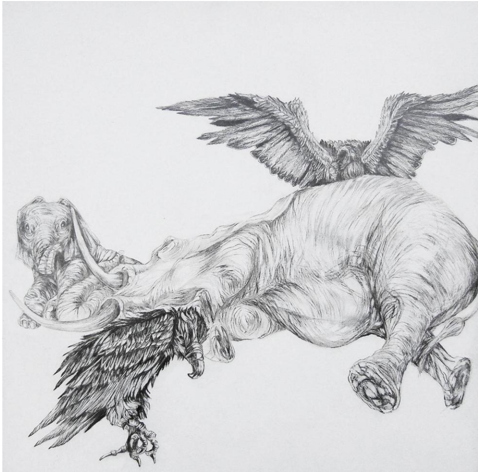
Figure 15 She Is Gone, Silver-point