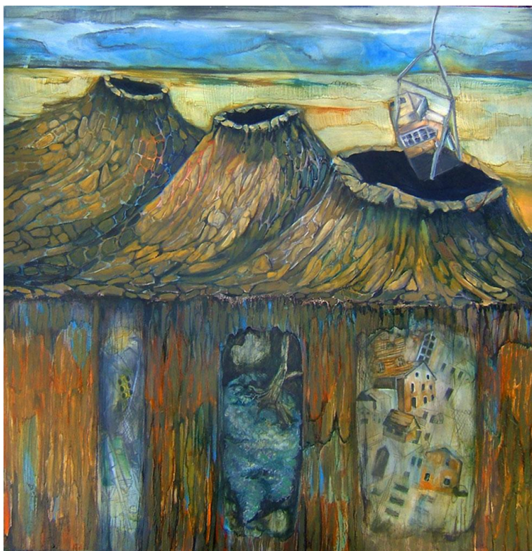
Figure 3 Falkner's Dream

In the next painting from The Future Apocalypse series, “Faulkner’s Dream,” influenced by the works of William Faulkner, remnants of civilization are organized in alien holes in the cracked and desolate landscape.