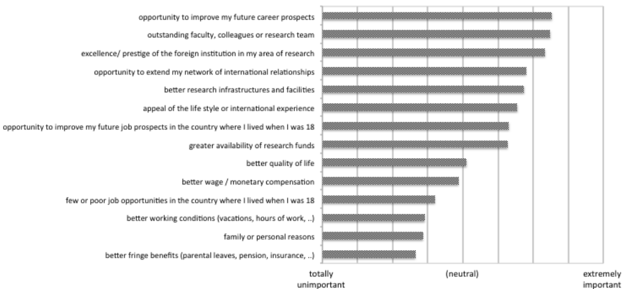
Figure 1 - Answers to question “How important was each of the following factors behind your choice to take a postdoc, employment or academic job in a country different than the one where you resided at age 18?” ranked by order of importance.