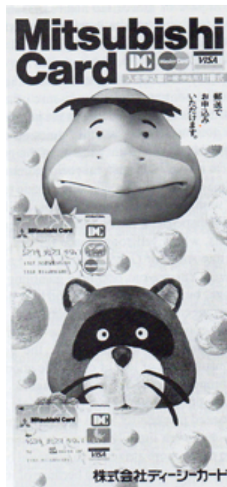
Fig. 3.4 Kawaii Corporate Logo

and artistic culture to the margins of society.” 19 The resulting restrictions led to an increased artistic expression amongst the Japanese pop culture. Kawaii encompassed everything from fashion, consumer goods and even corporate mascots (see fig. 3.4).