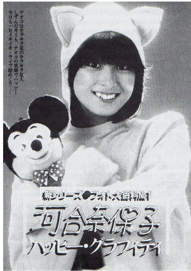
Fig. 3.2 Kawaii

“Kawaii or “cute” style means childlike; it celebrates sweet, adorable innocent, pure, simple, genuine, gentle, vulnerable, weak and experienced social behavior and physical appearances.” 17 The kawaii subculture grew out of an underground handwriting craze among Japanese teenager girls in the early 1970’s. The new style was “written laterally, using a mechanical pencil and extremely stylized, rounded characters with English, katakana, and little cartoon pictures such as hearts, stars and faces inserted randomly into the text”. Teachers did not look favorably on this new handwriting craze and in some schools it was banned. Yamane Kazuma refers to the movement as “Anomalous Female Teenage Handwriting” (see fig. 3.3).