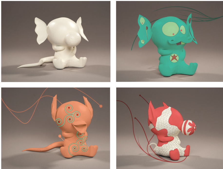
Fig 4.1 Foster Child

days of nostalgic youth through tailored accessories that can be combined in various combinations, resulting in a cluster of innovative designs reminiscent of Mr. Potato Head design schematics. Even further, the design includes the blank canvas that can be painted with washable acrylics and recreated over and over (see fig. 4.1).