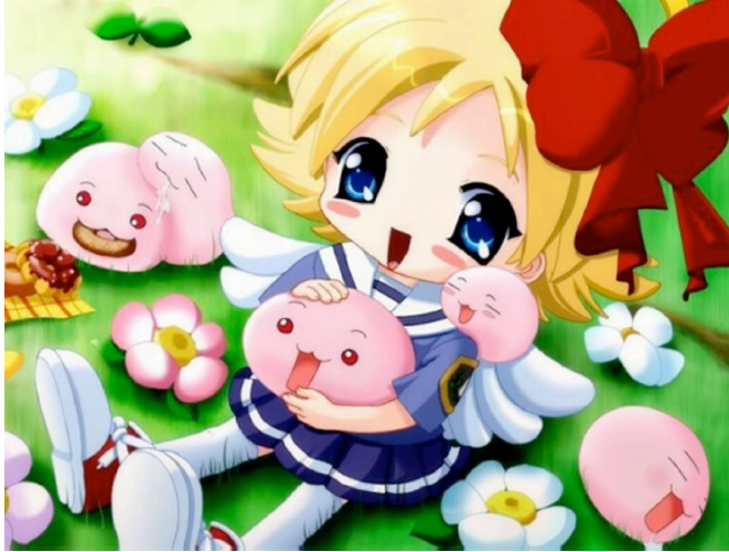
Fig. 3.1 Manga and Anime

Subsequently otaku began to fill the role of this generation and the anime and manga inherent within. “Their small rooms were filled with the paraphernalia of manga, tokusatu, and anime, all of which embodied the sensibility of the subculture generation, utterly alien to their parents.” 15 Present day otaku subculture is characterized by an obsessive fan of anime and in the work-obsessed culture of Japan, as deviant dropouts in wake of the burst of the 1980’s economic bubble. Otaku was pushed to the margins of society, yet a huge part of the population covets the objects of their obsessions. 16