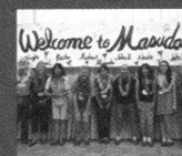
Local Sessions in 2013

The 11 local Sessions will be offered by 11 cities all over Oita prefecture. The participants will experience person-to-person exchange with their host and learn about the unique culture of the local area through this 4 days 3 nights program.