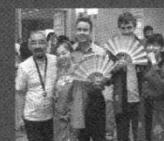
Closing Ceremony in 2009

The Closing Ceremony and Farewell Reception are the final event of the Summit. They are attended not only by the American visitors and Japanese volunteers, but also the host families and others who have connections with the summit. This is the start of the true grassroots exchange.