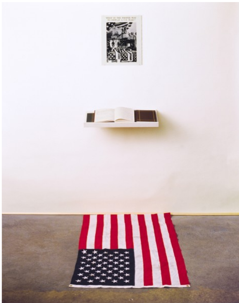
Fig. 1: Dread Scott, What is the Proper Way to Display a US Flag? , 1989.

artwork instills in us the right beliefs and desires, art can move us to action—even to virtue or vice.