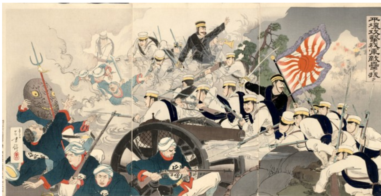
Fig. 8: Mizuno To, Woodblock print depicting the Battle of P'yongyang during the first Sino-Japanese War.

thus partners with White Americans in derision directed at Africans. This initial partnership is symbolic of what Japan desired in a relationship with the West: superiority to others of color and equality to Whites” (2012, 350).