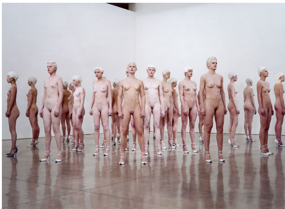
Fig. 6: Vanessa Beecroft, VB46 , 2001. Copyright Vanessa Beecroft.

because that's powerful, that's not natural nudity or pureness." 12 Alternately, Steinmetz and Leary report that their "ankles and feet became swollen, blistered, and bruised as a result of continuous standing in the dramatically ill-fitting shoes. Due to the extreme swelling of our ankles, almost all of the elastic straps eventually had to be cut.... The straps were later altered in Photoshop to look unbroken" (ibid., 763).