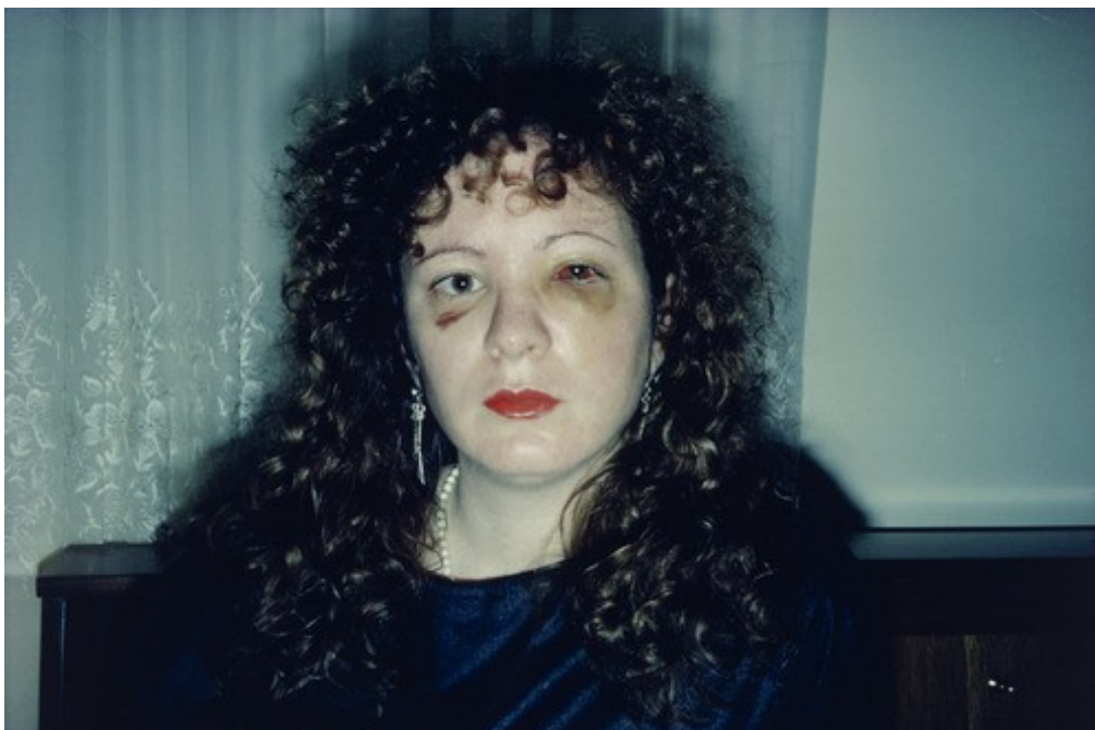
Fig. 5: Nan Goldin, Nan One Month After Being Battered, 1984. 1984.

Here, the violation is one of autonomy—we imagine the situation that lead to this abuse and to bear witness to its effects. Nevertheless, there are still remnants of physical disgust here—the blood in her eye, the bruises now turning yellow (suggestive of illness), and scratches. I argue that one cannot successfully elicit disgust in artworks depicting pure autonomy violations. One will inevitably still reference the traces of these violations—blood, gore, death—all of which are universal elicitors of disgust. Likewise, a photograph of, say, a theft, will not produce any disgust reactions in its viewers.