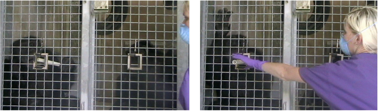
Figure 1 Exchanging tokens through the picture frames in the Test Phase. Stills from video footage of the Test Phase showing the Subject chimpanzee returning his token through his picture frame. As shown, to avoid cuing the chimpanzees' responses, the experimenter only reached for the token when the chimpanzee had pushed 50% of the token through the picture frame. Note, although there is a central support bar in the middle of the mesh, the chimpanzees are in the same enclosure and have full visual access to both food rewards outside the cage and also to the actions of their test partner.

of exchanging a token through a picture frame (procedure described below). The Test Phase thus allowed us to examine whether the chimpanzees only chose to exchange for grapes in certain conditions (e.g., in response to inequity) or whether they universally attempted to obtain the best reward possible.