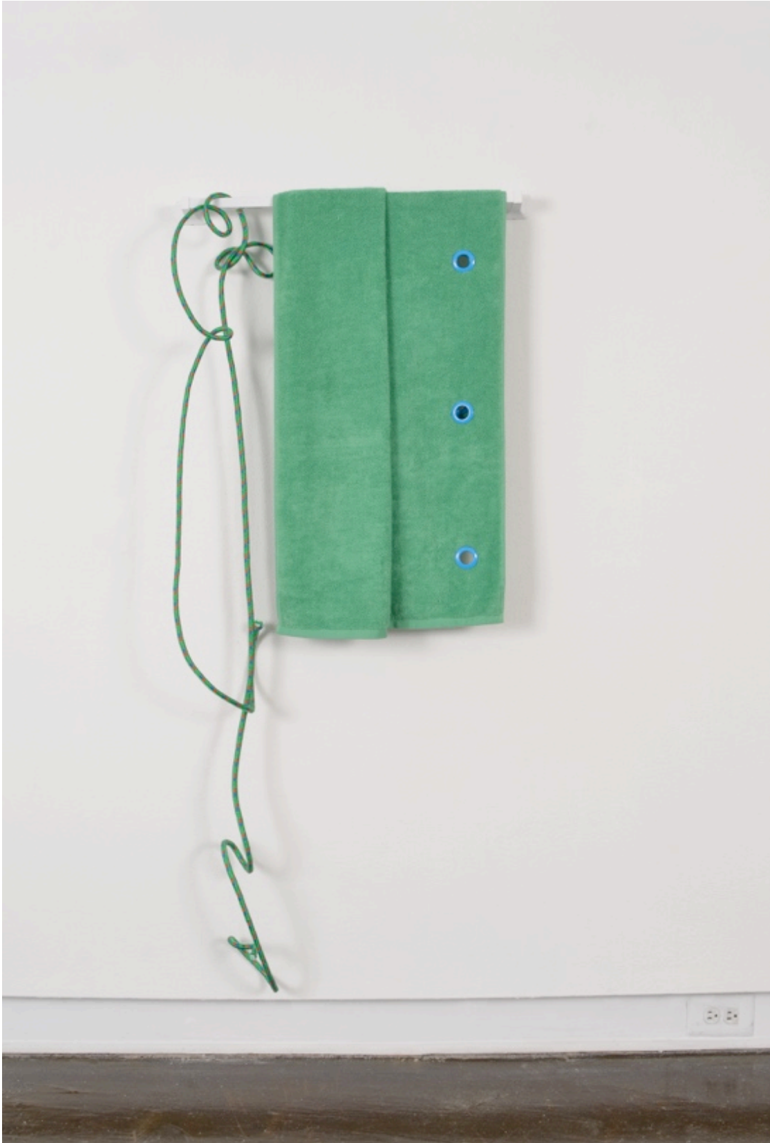
Figure 7 eyelet