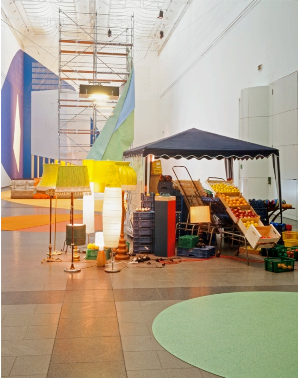
Figure 1 Jessica Stockholder, On the Spending Money Tenderly Carpet, scaffolding, paint, linoleum, lights, 4 couches, tent, plastic fruit, real oranges and lemons, Christmas baubles, balls, boxes, tables, building materials. 2002.

reconstruction of continuity in what appears discontinuous: here we find a sense of order. Here we find form. A formal value that is perceived through the senses - and not just that of sight. 4