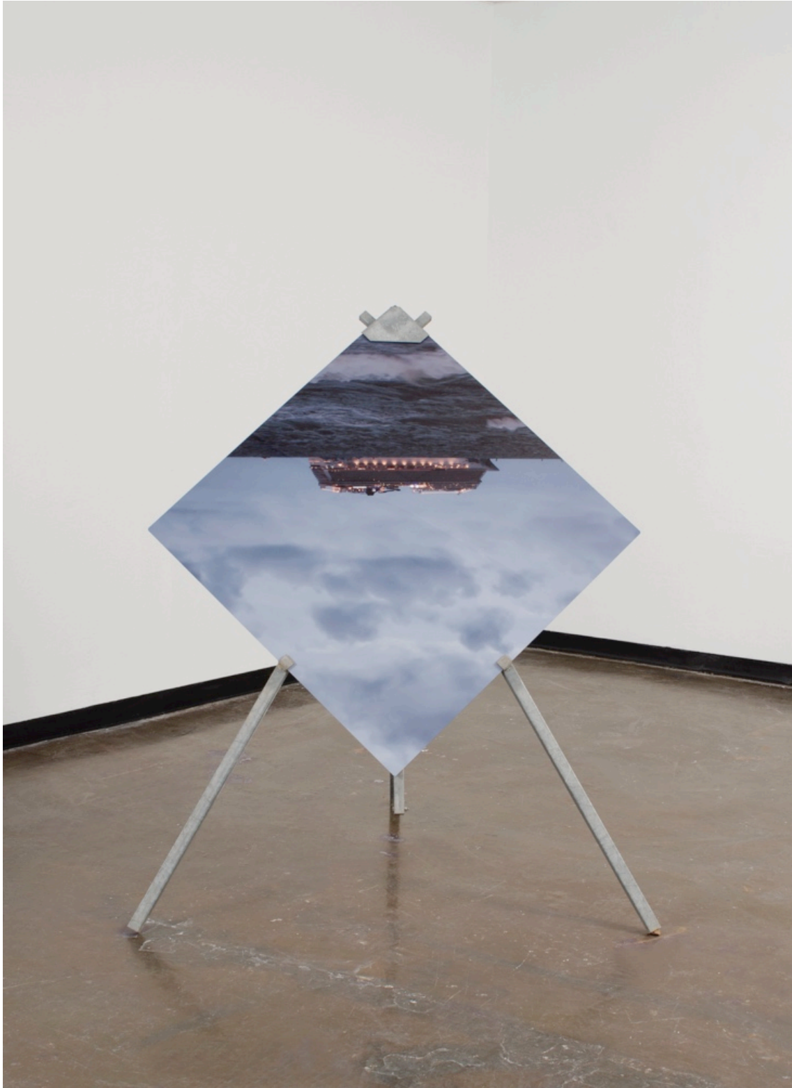
Figure 5 crew only