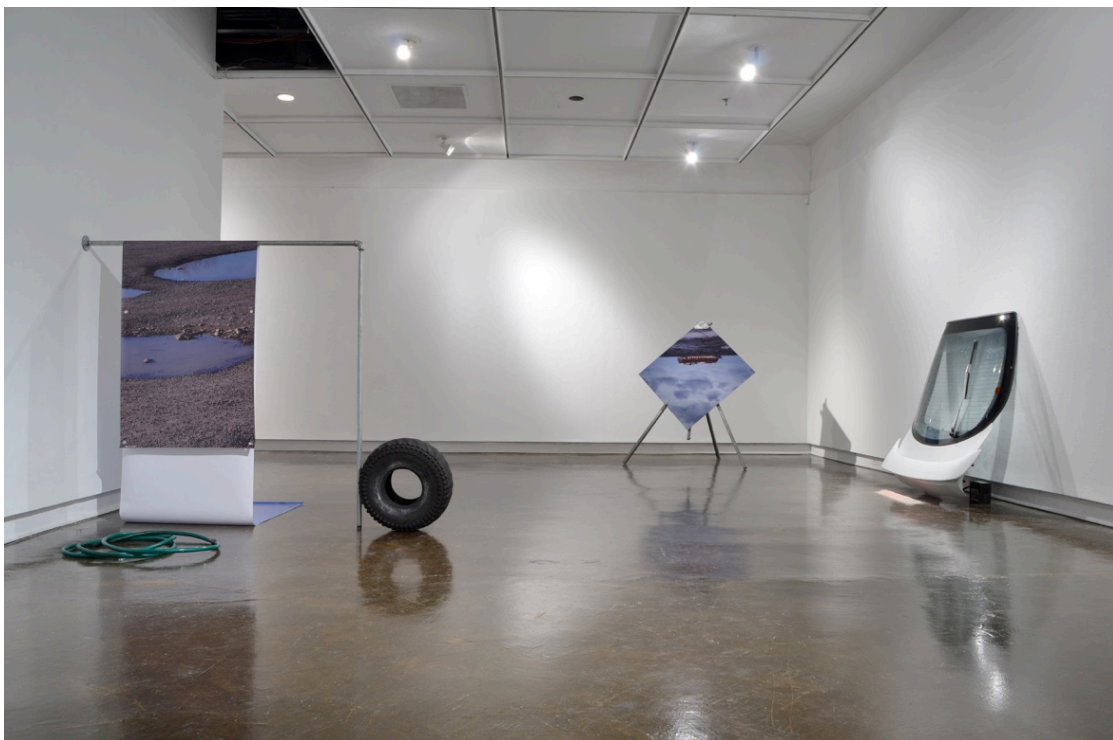
Figure 4 incongruent ilk , installation view