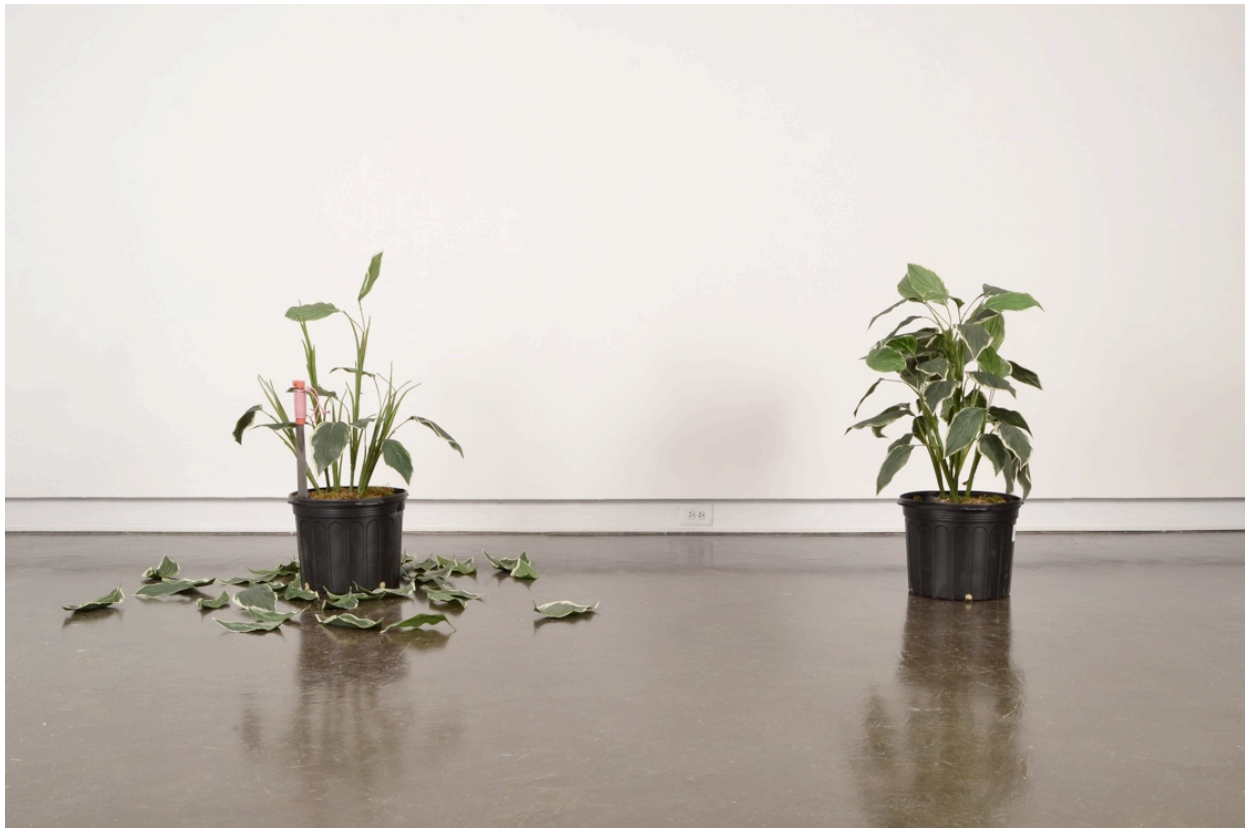
Figure 9 florida fall