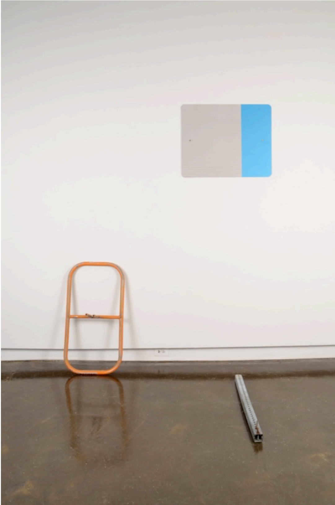
Figure 11 circumstance