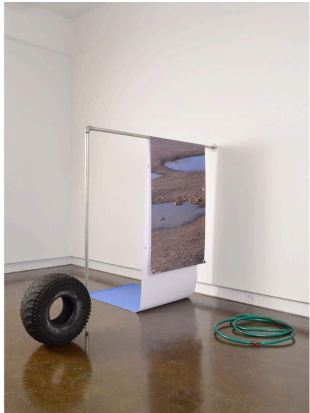
Figure 10 trace