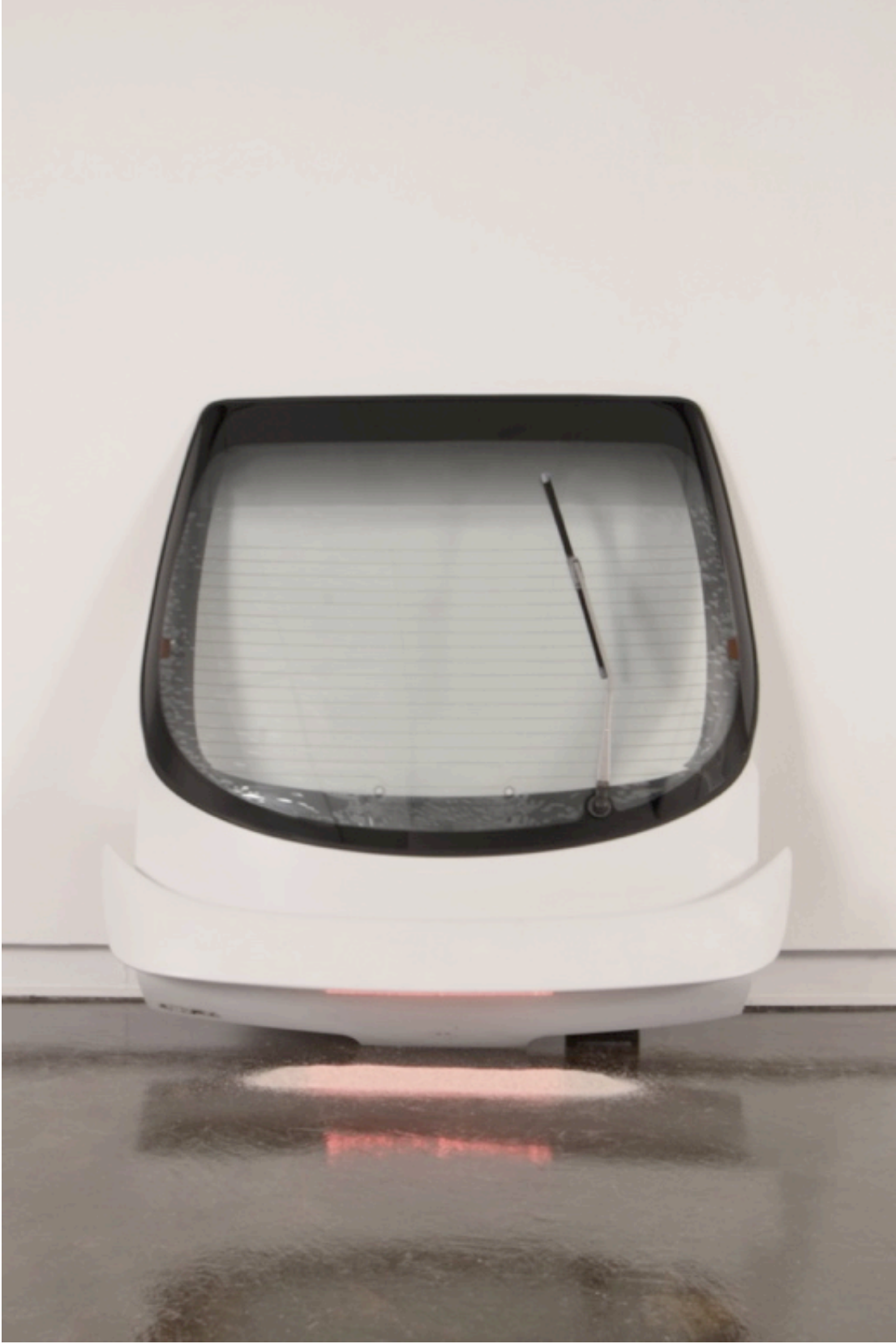
Figure 8 dune