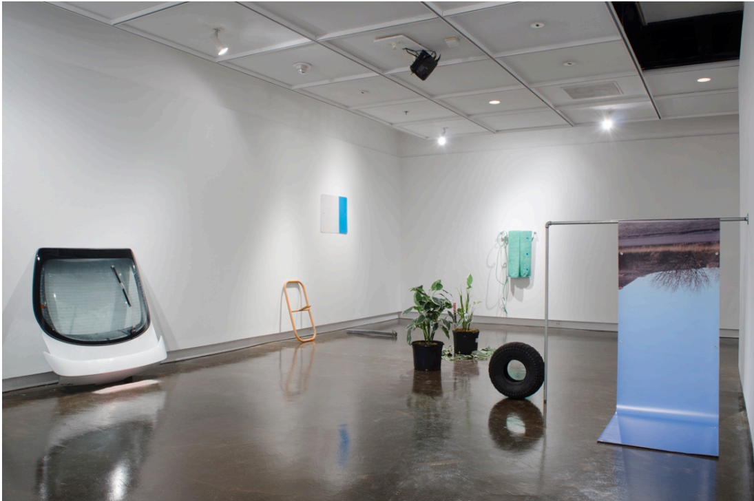
Figure 3 incongruent ilk , installation view