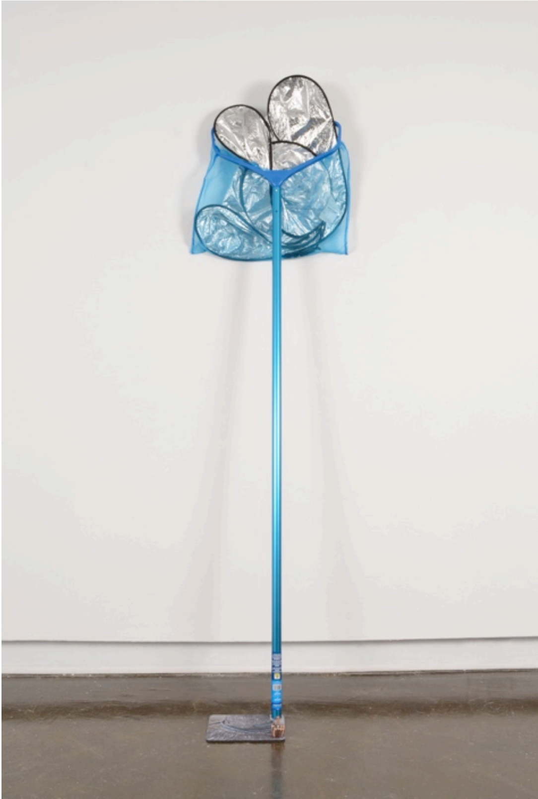
Figure 6 shade