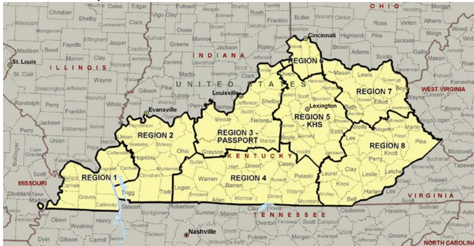
November 1997-June 2000 – 37 Counties under MMC, 83 under FFS.