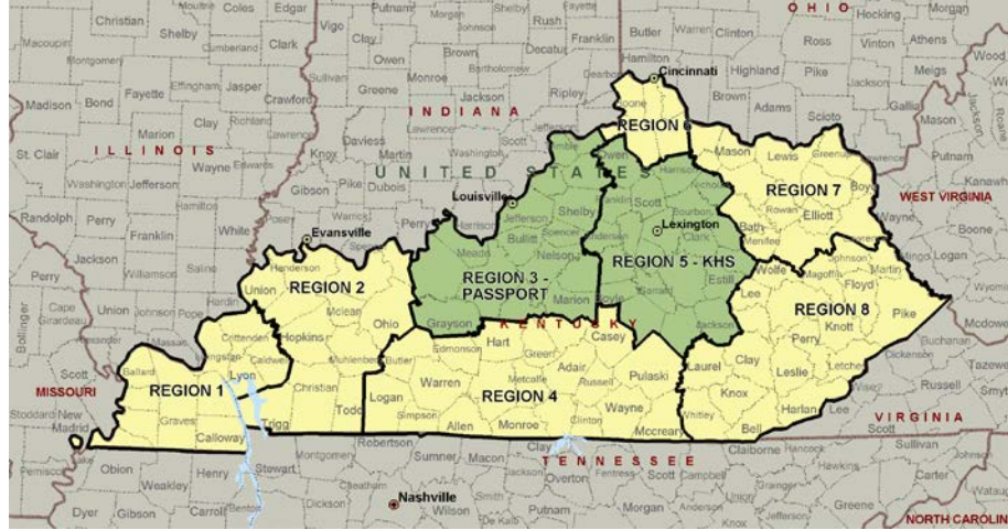
July 2000-December 2003 – 16 Counties under MMC, 104 under FFS