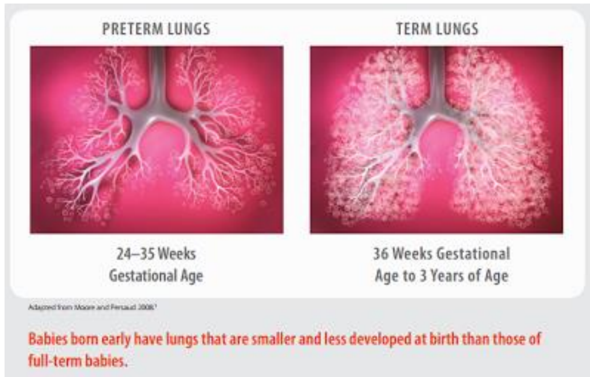
Figure 1. Preterm infant Lungs Versus Term Infant Lungs

(Moore and Persaud, 2008; Synagis, 2015)