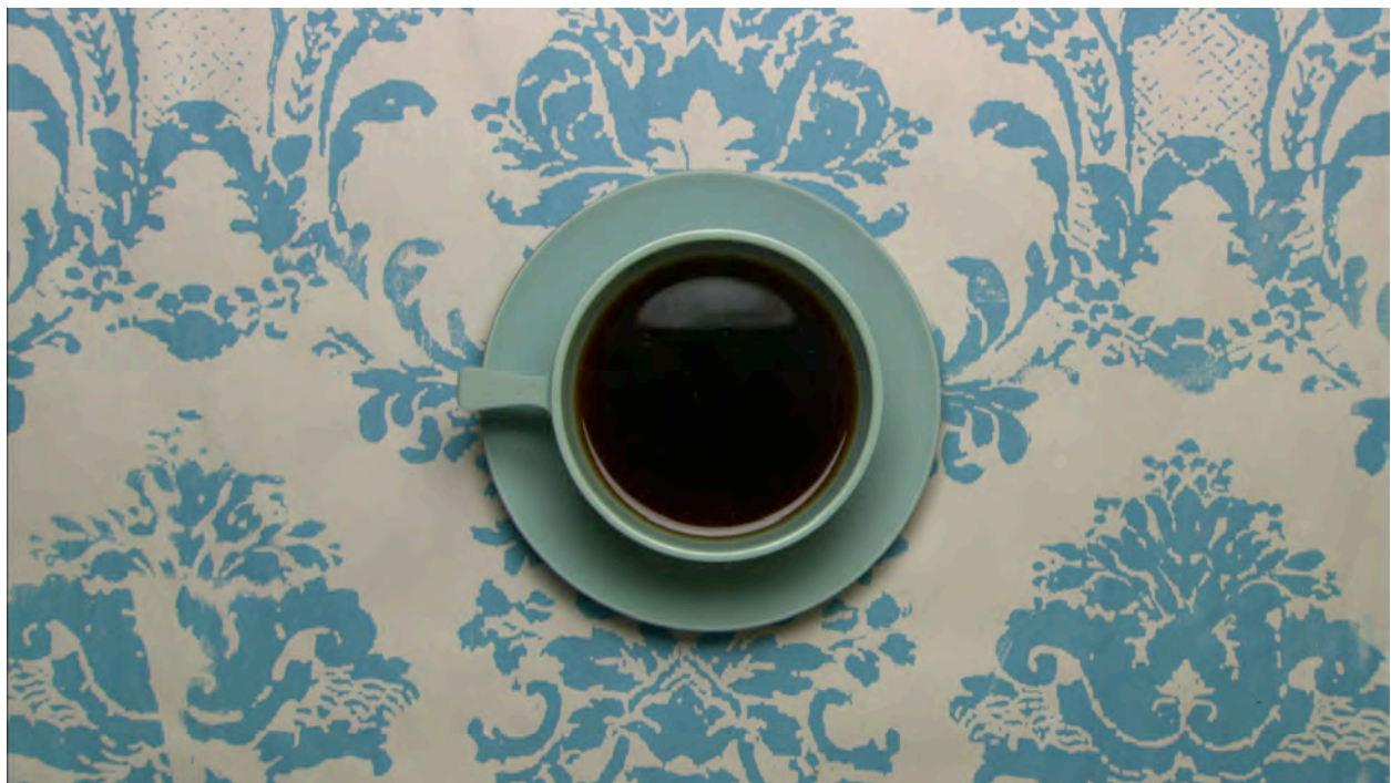
Figure 3: Film stills 5 and 6 – objects