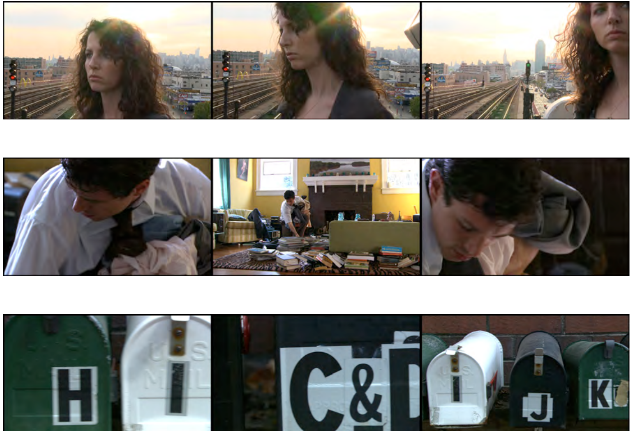
Figure 5: Film stills and 9, 10 and 11 – split screen