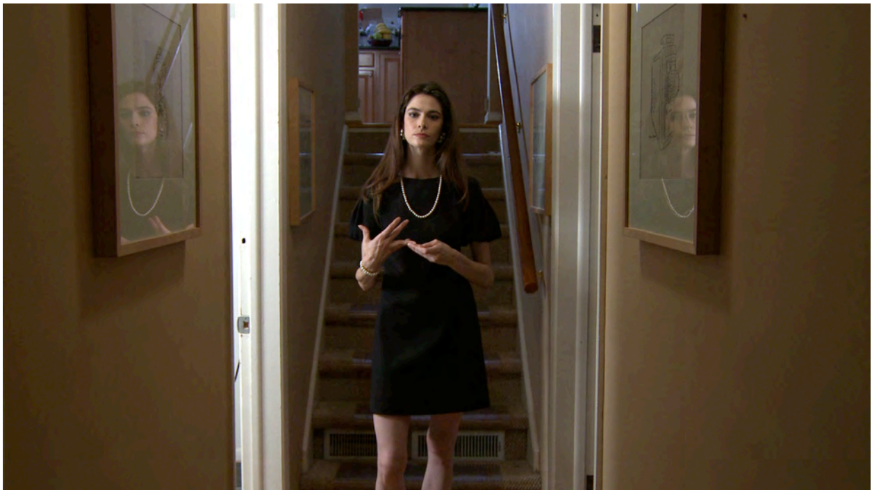
Figure 2: Film stills 3 and 4 – the postman and the lover