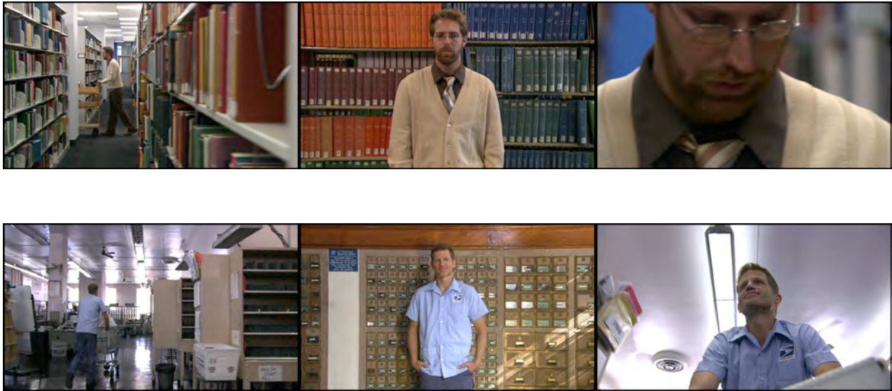
Figure 6: Film stills 12 and 13 – framing of an icon