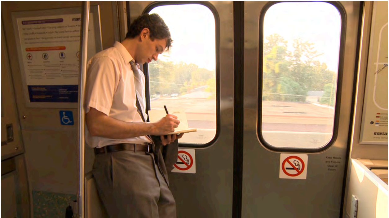
Figure 4: Film stills 7 and 8 – through characters