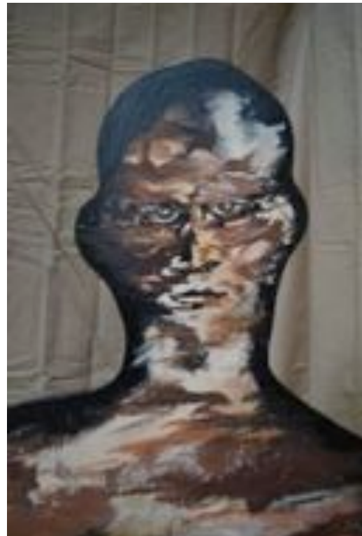
B.2 Susan Dowling, Community , 2011. Acrylic on wood, 5 ft 4 1/2 in x 3 ft 6 in x 12 in. Atlanta, Georgia.