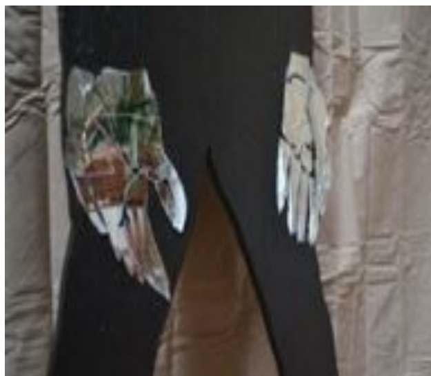
Susan Dowling, Jordan , 2010. Mixed media on wood, 5 ft 3 in x 2 ft 3 in. x ½ in. Atlanta, Georgia.