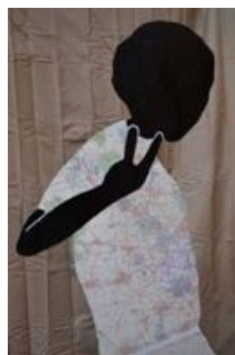
Susan Dowling, Josh , 2010. Mixed media on wood, 5 ft 5 in x 2 ft 8 in. x 1ft 4in. Atlanta, Georgia.