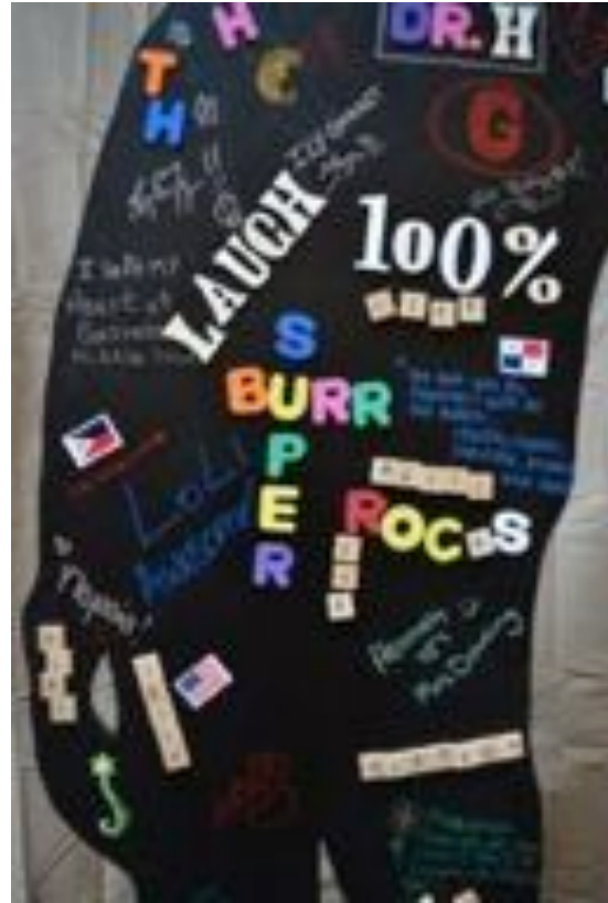
B.1 Susan Dowling, Community , 2011. Mixed media on wood, 5 ft 4 1/2 in x 3 ft 6 in x 12 in. Atlanta, Georgia.