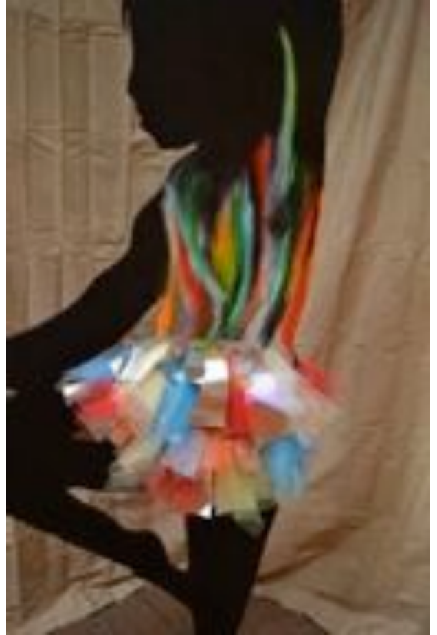
Susan Dowling, Zion , 2011. Mixed media on wood, 5 ft 5 1/2 in x 2 ft x 2 ft. Atlanta, Georgia.