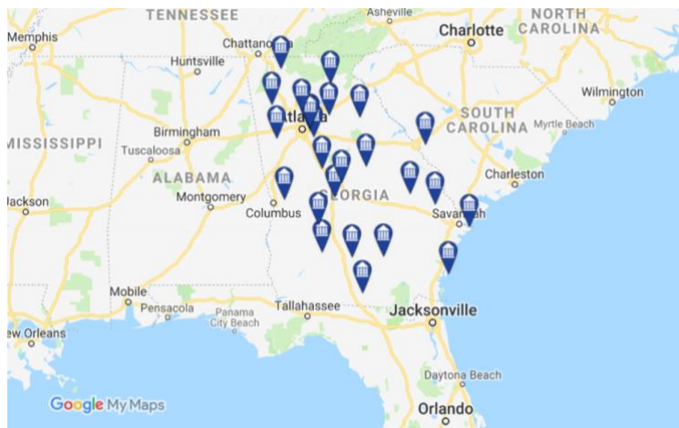
(University System of Georgia, 2018)

This document serves as a narrative in support of the more abbreviated policy brief. This narrative reviews the current literature on alcohol-related harm and