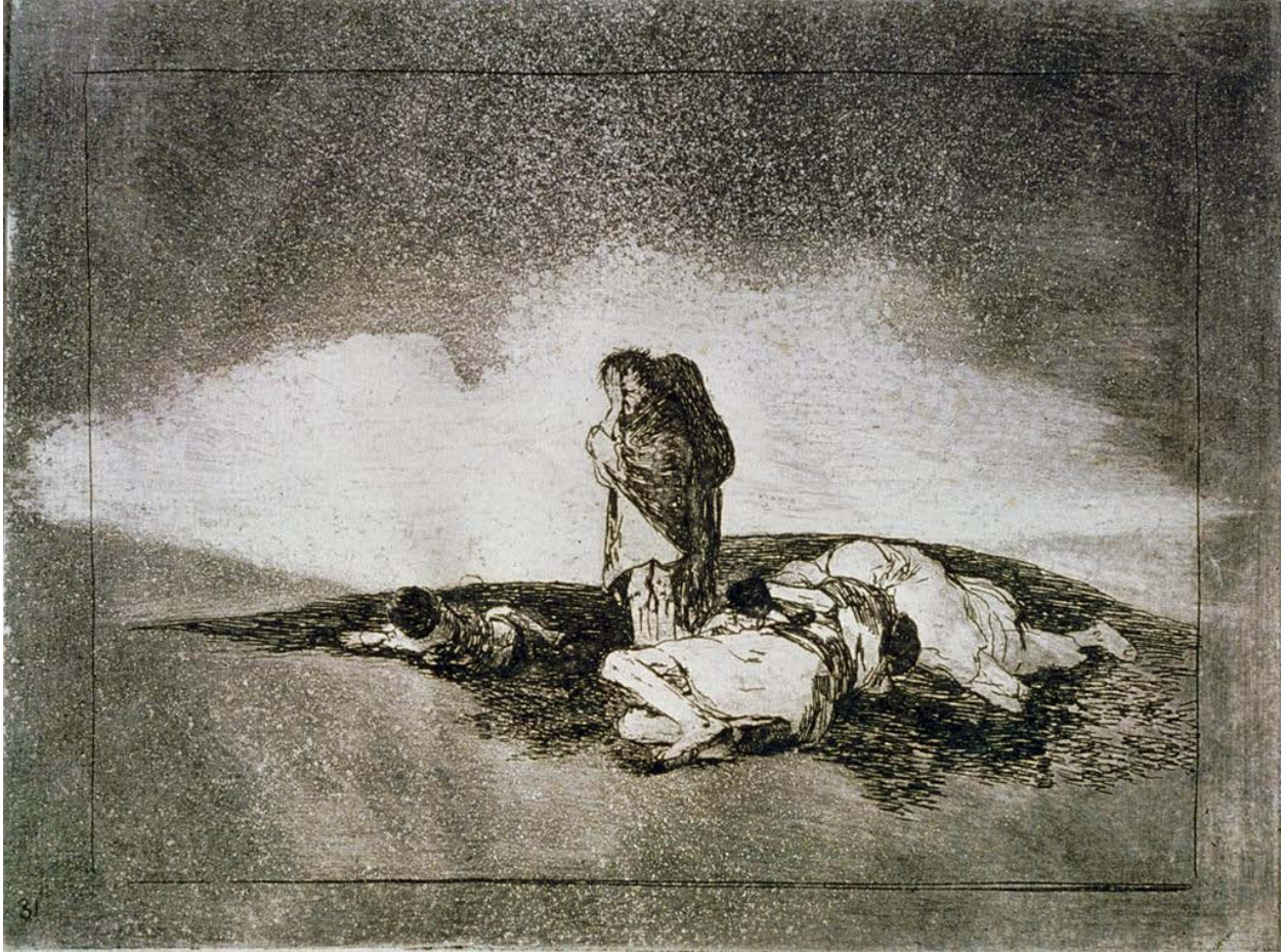
Figure 9: Francisco Goya, There is no one to help them , 1810-15