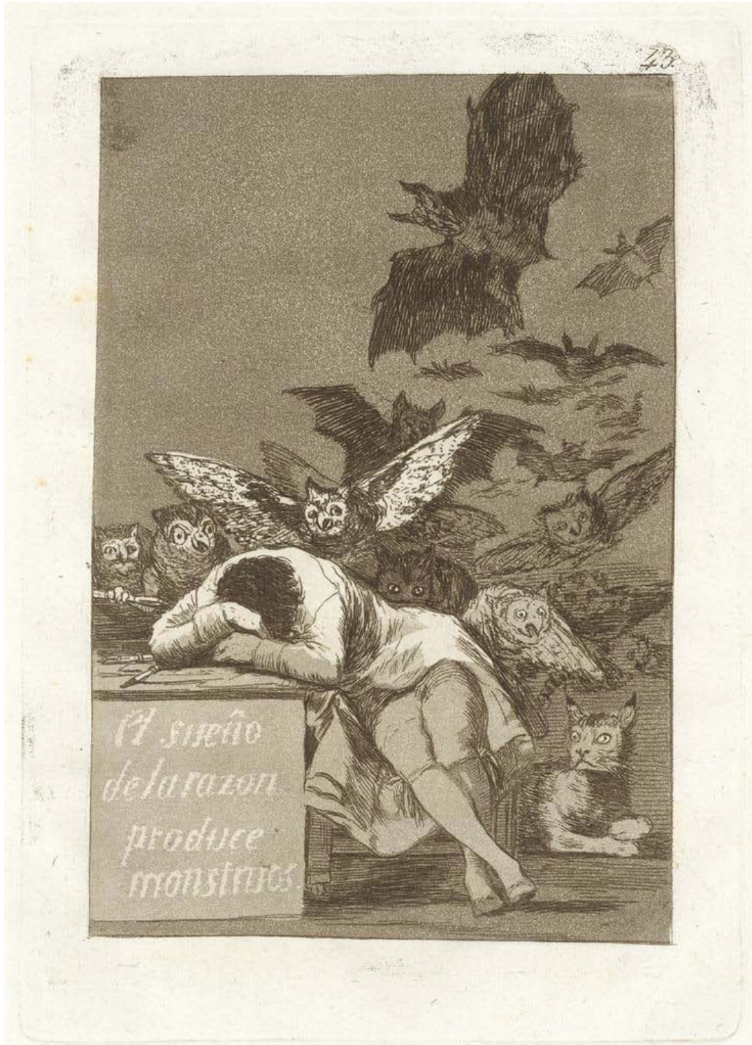
Figure 5: Francisco Goya, Sleep of Reason Produces Monsters , 1799