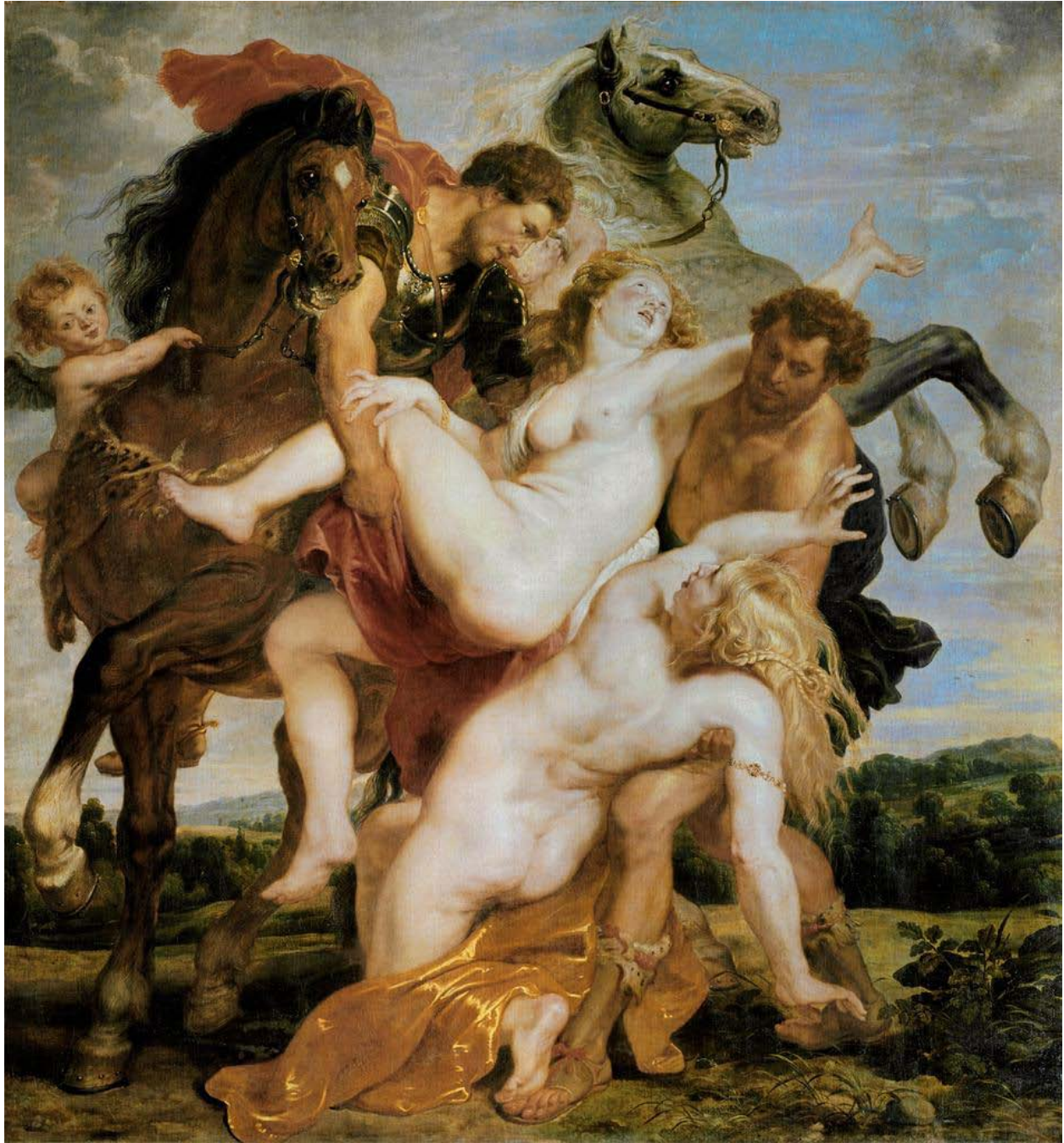
Figure 2: Peter Paul Rubens, The Abduction of the Daughters of Leucippus by Castor and Pollux , 1617