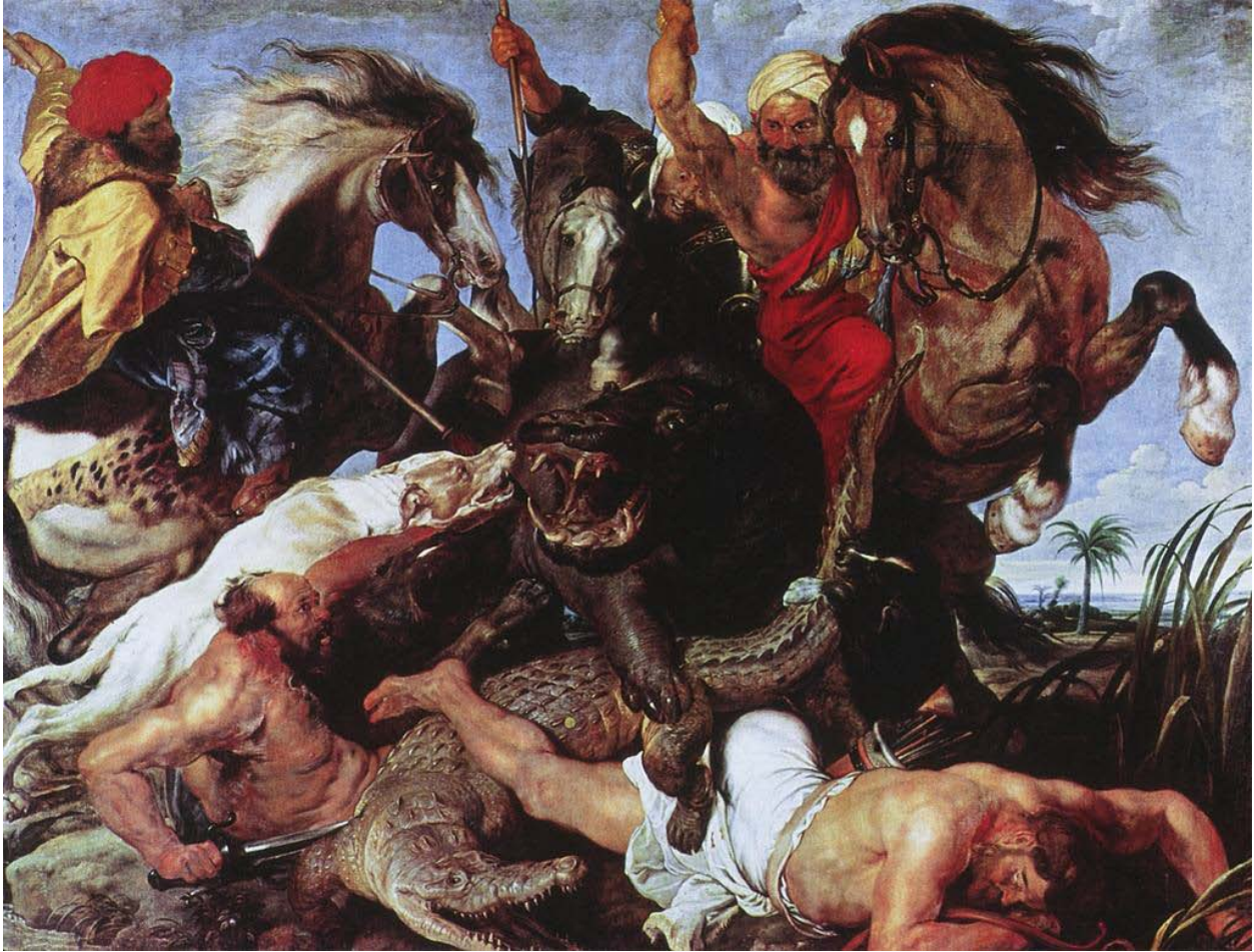
Figure 3: Peter Paul Rubens, Hippopotamus and Crocodile Hunt , 1615