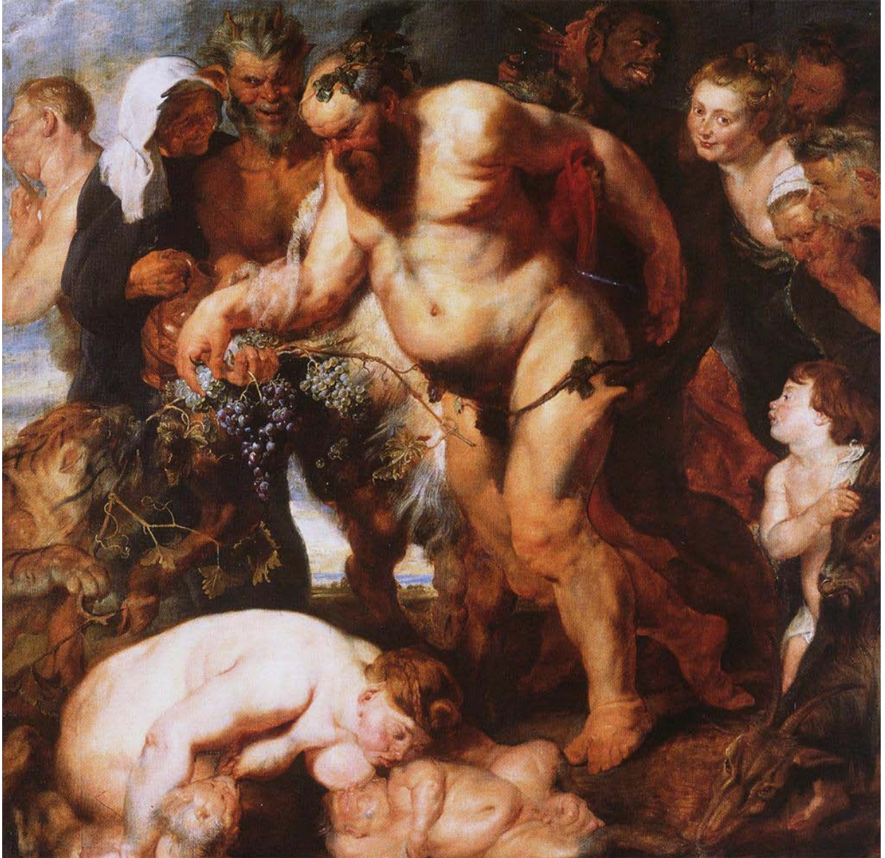
Figure 4: Peter Paul Rubens, Drunken Silenus , 1616