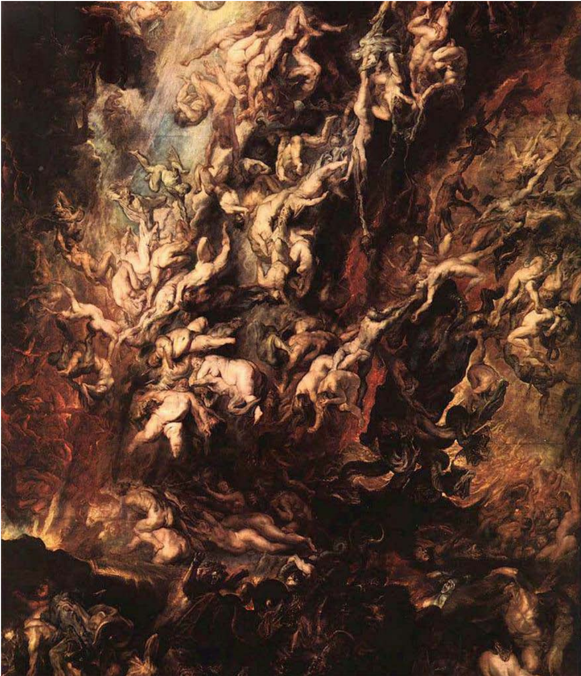
Figure 1: Peter Paul Rubens, Fall of the Rebel Angels , 1620