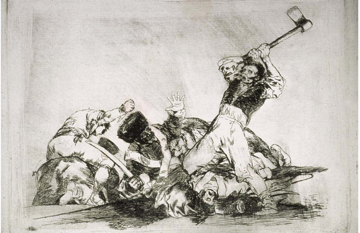
Figure 8: Francisco Goya, The Same , 1810-15