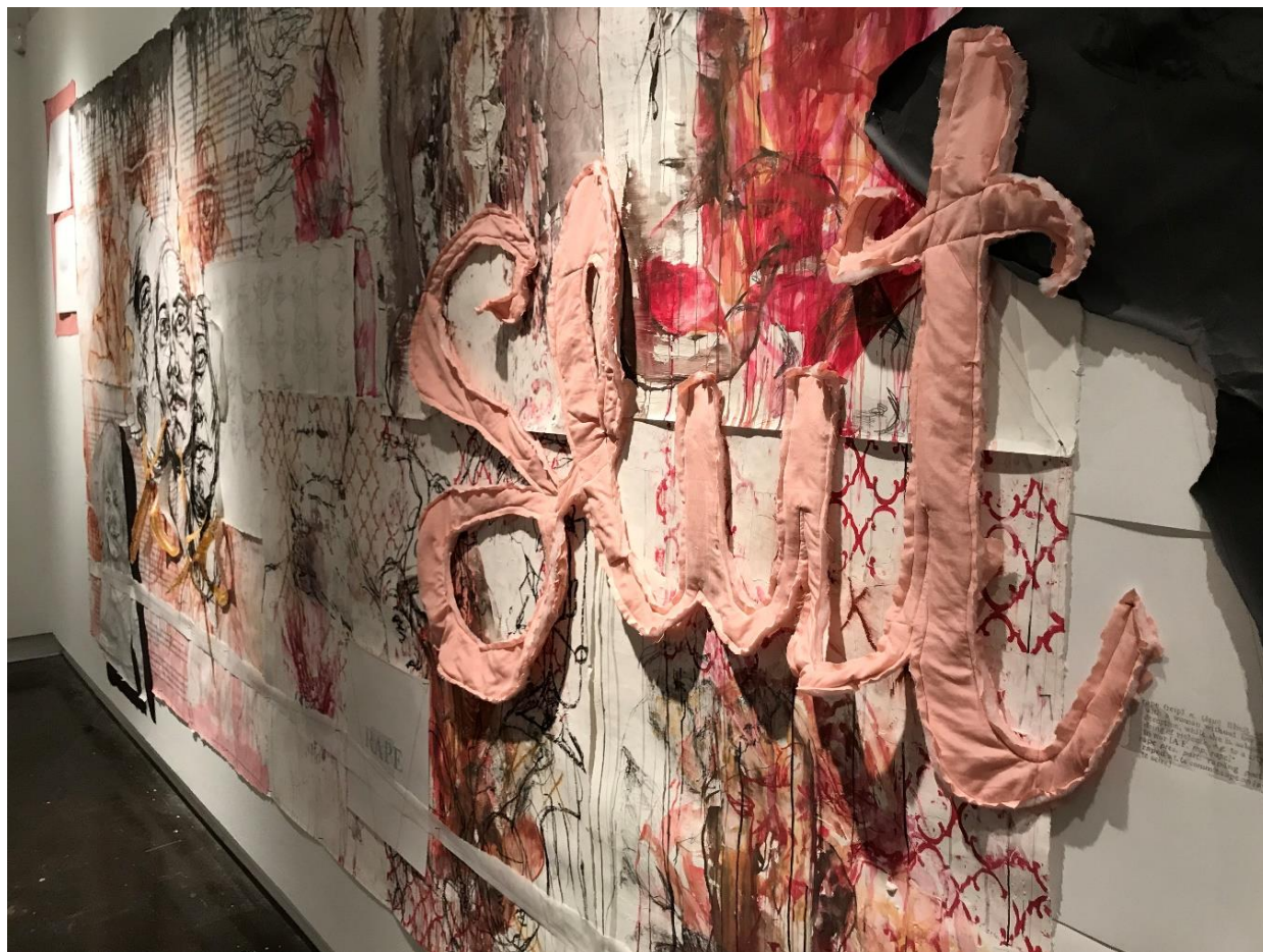
Figure 2 - Carrying On for Ten Years (Extended), Detail, 2018, Mixed Media Installation, 8x30 feet

“objectlessness” and “language destroying” qualities. Through this work, I have chosen to become a storyteller of a specific kind of pain that is not often shared publicly. There are stigmas around rape that silence survivors, but choosing to tell the story in this way, through the mediation of art, both captures the immutability of the experience and simultaneously combats those stigmas.