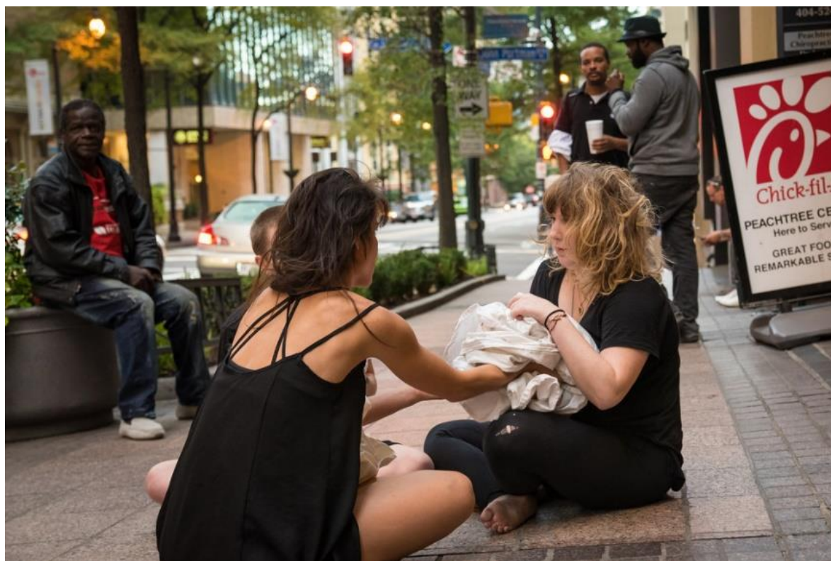
Figure 4 - #3everyday Performance Still, 2016

shroud the third in a sheet. And then the cycle repeats. This time, the movement is more exaggerated, more aggressive. The questions are shorted, “Why did you!?” “How could you!?” “What were you!?” And then again, seven times of “I’m sorry” and one woman shrouds the last. The third cycle is the most aggressive and violent. In 2015 I always performed as the third and often left performances with blood on my legs, arms, or face. The questions become one word shouts: “WHY!?” “WHAT!?” “HOW!?” And finally, I would shroud myself while reciting “I’m sorry” seven times.