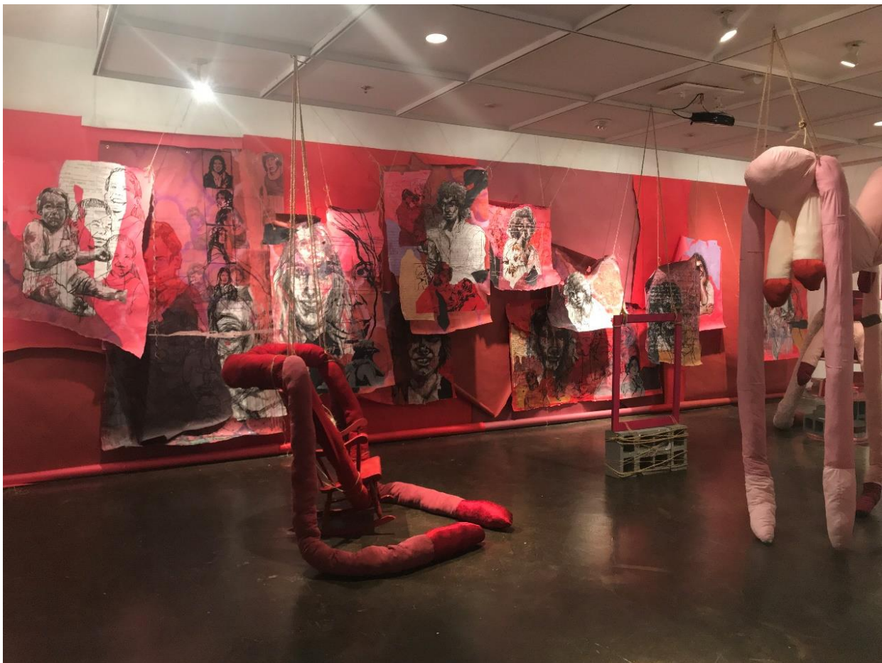
Figure 6 - Living Hysterically Installation View, 2019

In the exhibition Living Hysterically each work presents a picture of past, present, and future tied to the specific story of a woman or girl. These stories provide an entry point into the personal experiences, both positive and negative, that feature pain and fill the lives of women. Each story sits against a backdrop of social, political, and historical forces that illustrate the undercurrent of pain, trauma, and struggle each of us has faced. Beyond this, each work depicts an individual story that further complicates representations of women, showing us as creatures that overcome these forces and thrive despite them.