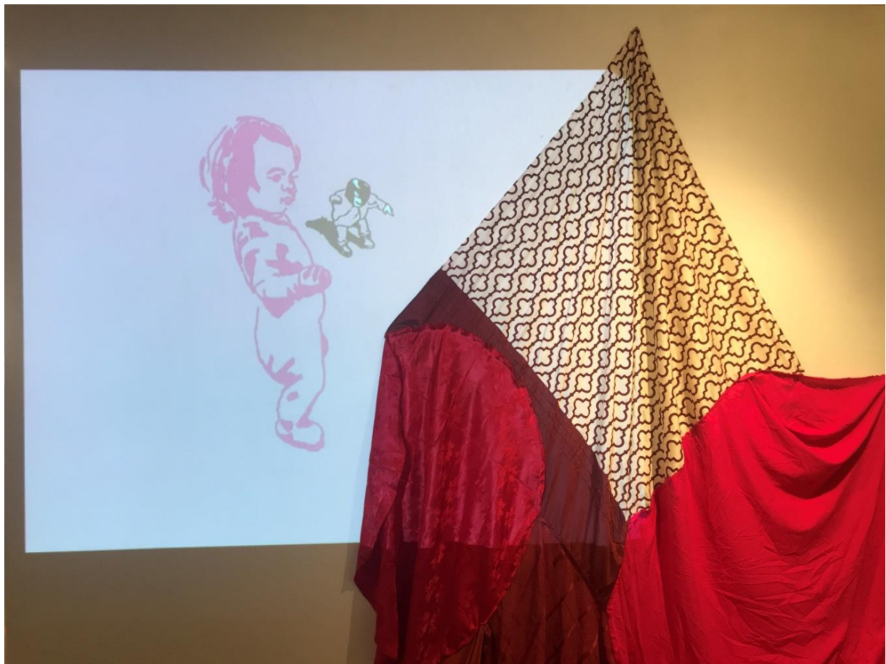
Figure 7 - Progeny and Potential , Hand Drawn Animation, installation still, 2019

Entering the exhibition, Living Hysterically first gives us an experience of hope. Projected on the front wall is a simple video work, Progeny and Potential , depicting an animation of my daughter walking and dancing. The drawings that make up the video are simple and rough, reflecting the learning my 15-month old daughter currently engages in every day. Her steps are imperfect and her dancing is without self-consciousness. She is at the center, unbothered, and as of yet, facing little in terms of outside forces that might seek to control or curb her.