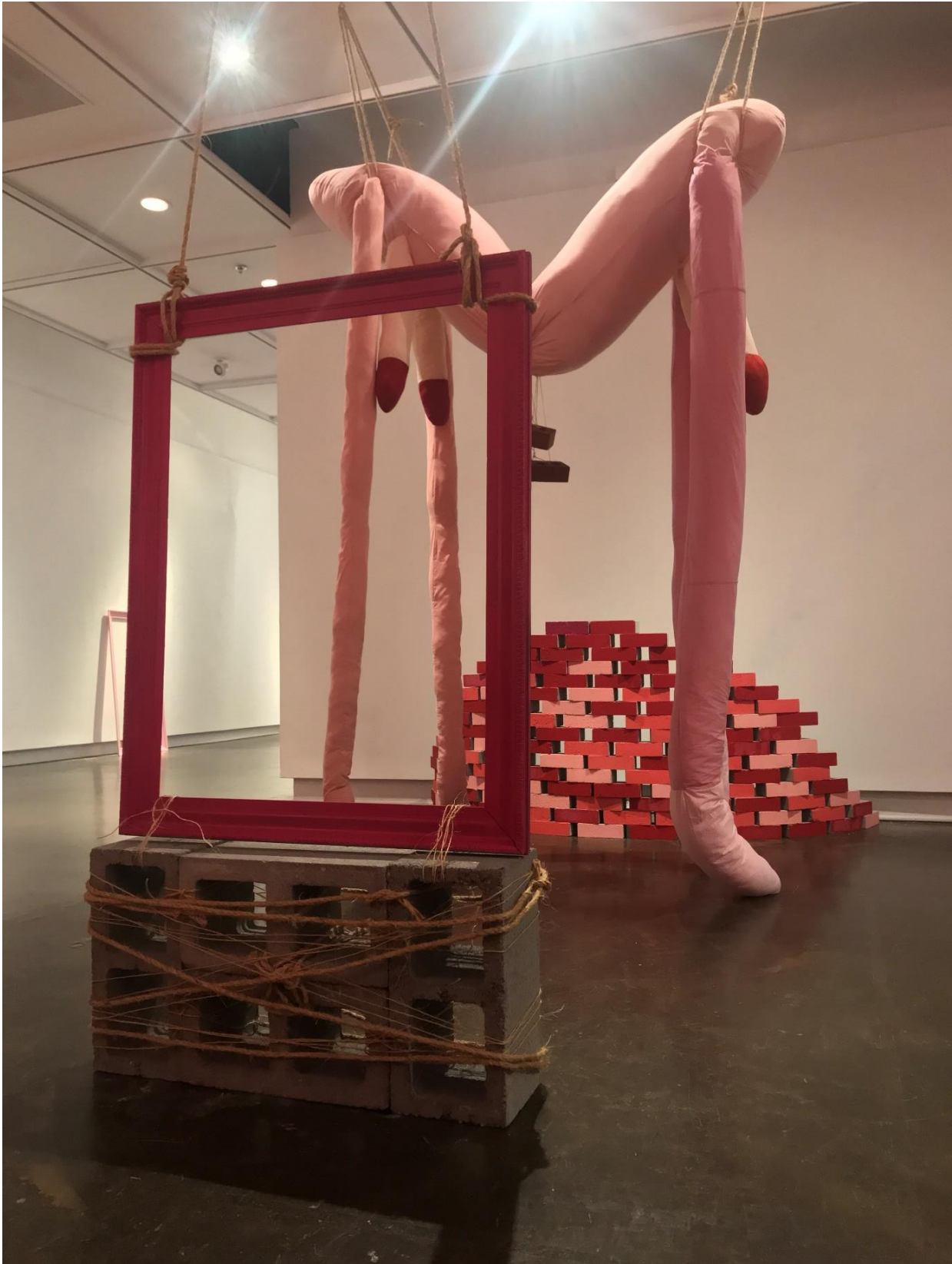
Figure 14 - Dilemma, Installation View, Bed sheets, Poly Fiber Fill, Zinc Spine, Cinder Blocks, Rope, Twine, and hand painted frame, 2019