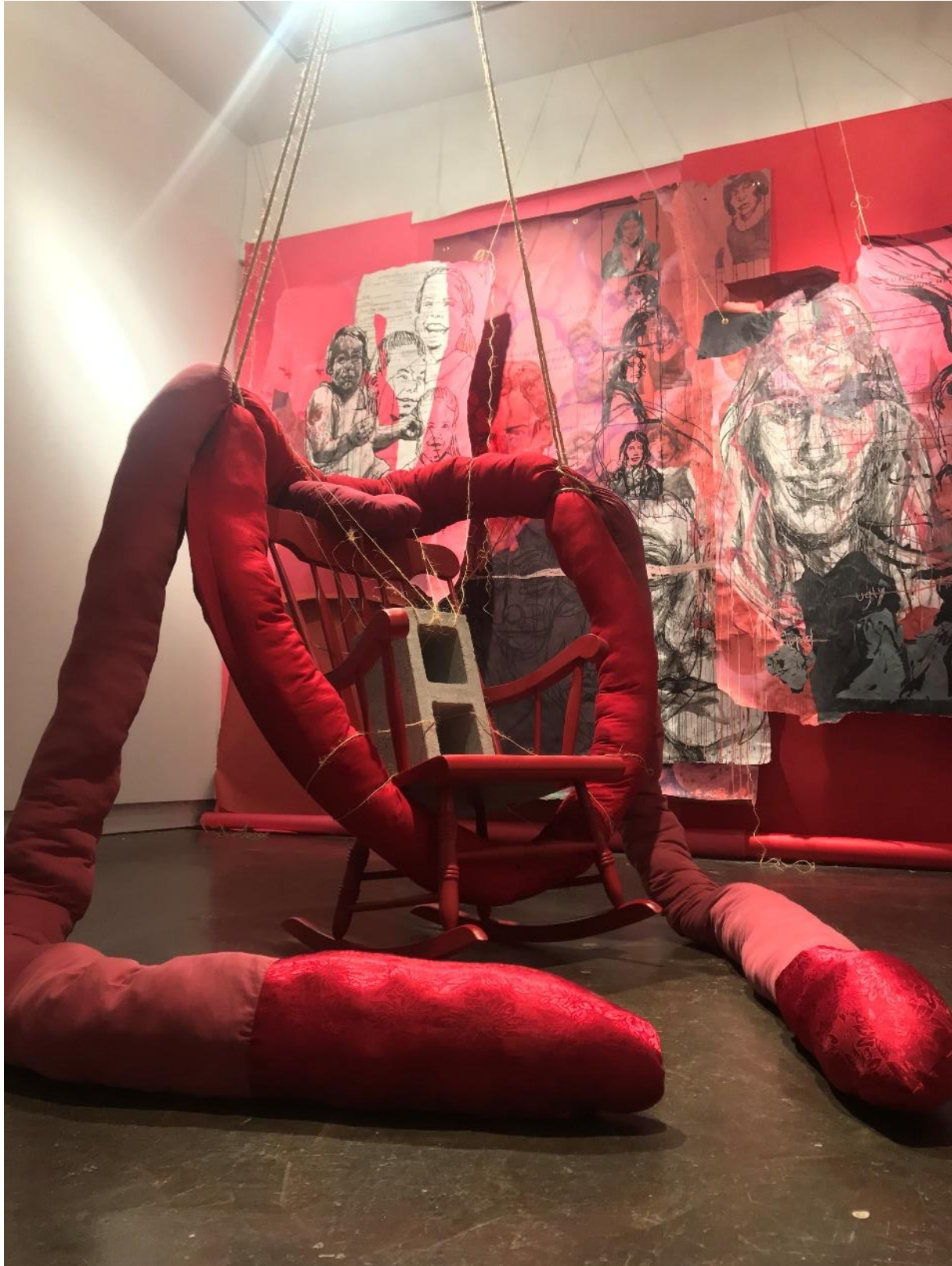
Figure 13 - Caretaker, Installation View, Bed sheets, Poly Fiber Fill, Zinc Spine, Cinder Block, Rope, Twine, and hand painted rocking chair, 2019