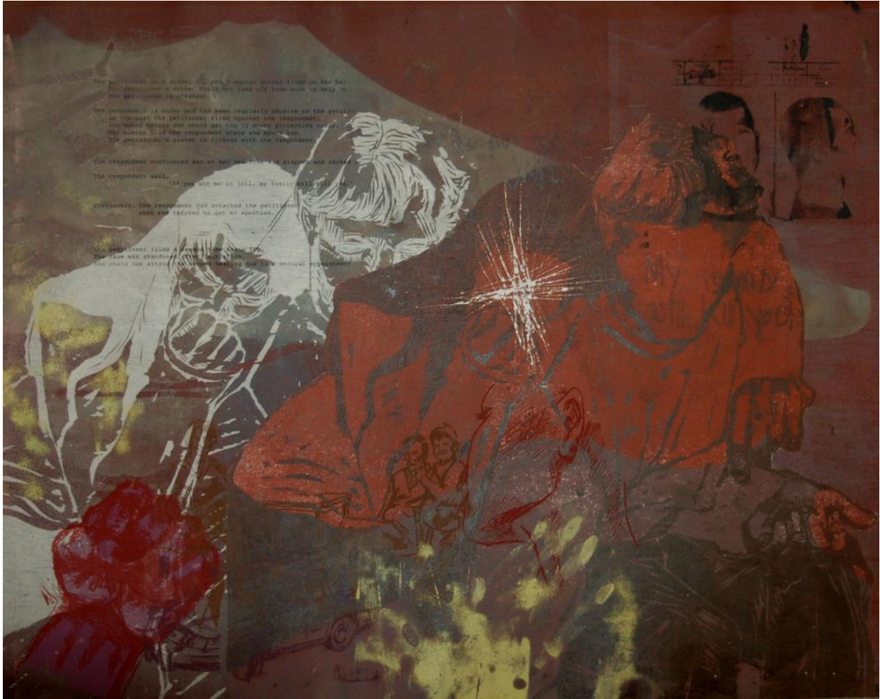
Figure 3 - Of Age , 2013, Monotype, Relief, and Screen print techniques on paper, 18x24

In the first year of the performance, three women move and speak for roughly ten minutes. Their movements begin as slightly exaggerated pantomime of the kinds of general things women do as they prepare to leave the home. Putting on makeup. Playing with your hair. Checking yourself out in the mirror. While performing these movements, each woman recites aloud a series of questions; “Why did you stay?” “What did you think was going to happen?” “Why didn’t you get help?” Nine questions in all, each derived from actual conversations I had as an advocate when talking to others about domestic violence. After the first round of movement and language, the women recite together, “I’m sorry” seven times as two of them