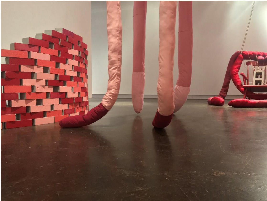
Figure 12 - Years to date... , Installation view with Dilemma and Caretaker , Hand painted bricks, 2019

Like Big Mama before them, each figure is also a little bit funny. They are lumpy and their exaggerated limbs feel comical next to the weight of bricks and cinder blocks. Their color is that of oversaturated and unrealistic flesh. They display constant labor and fatigue but they also shrug it off as a fact of their existence. These figures will persist in holding the weight and scrutiny of the world's demands for ages and while they may sag under the pressure, they will persist.