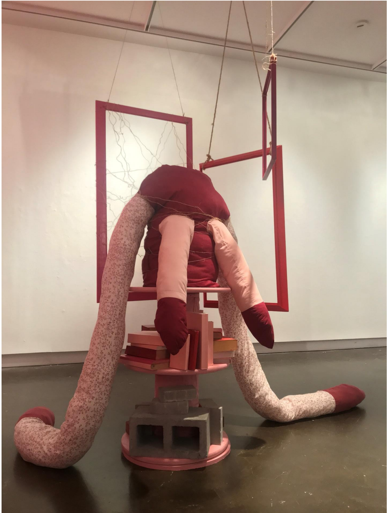
Figure 15 - Complex, Installation View, Bed sheets, Poly Fiber Fill, Zinc Spine, Cinder Block, Rope, Twine, and hand painted rocking chair, 2019