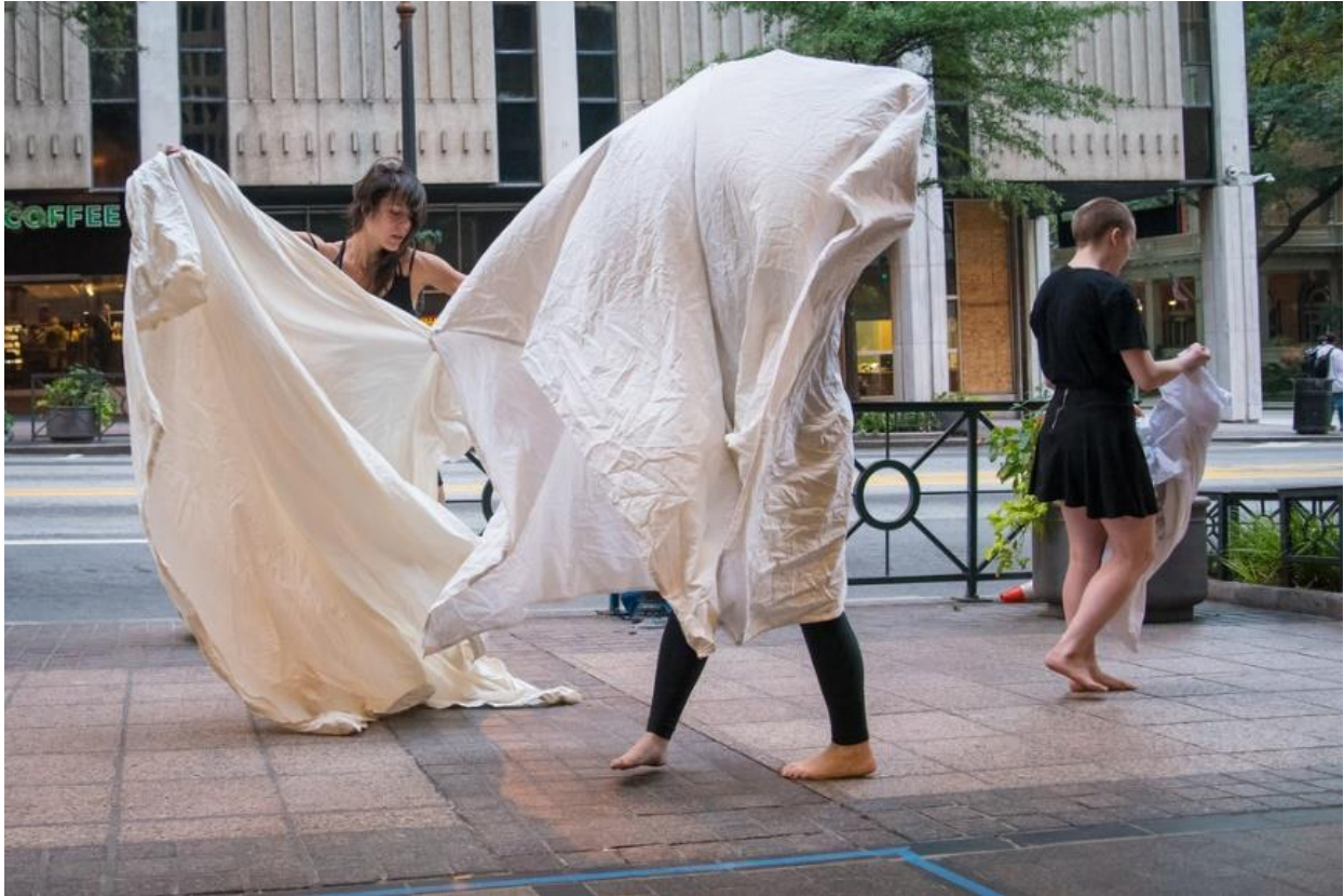
Figure 5 - #3everyday Performance Still, 2016

I do believe that the role of art can be used to create understanding of particularly difficult and unspeakable experiences. The goal of this understanding can vary from work to work, and I think that is where Sontag and Nelson's concerns are most useful: does the work need space for contemplation or for the direction towards action because its goal is towards change? Or does the work merely hope to communicate an experience, in the hope that it can be a testimony of that experience?