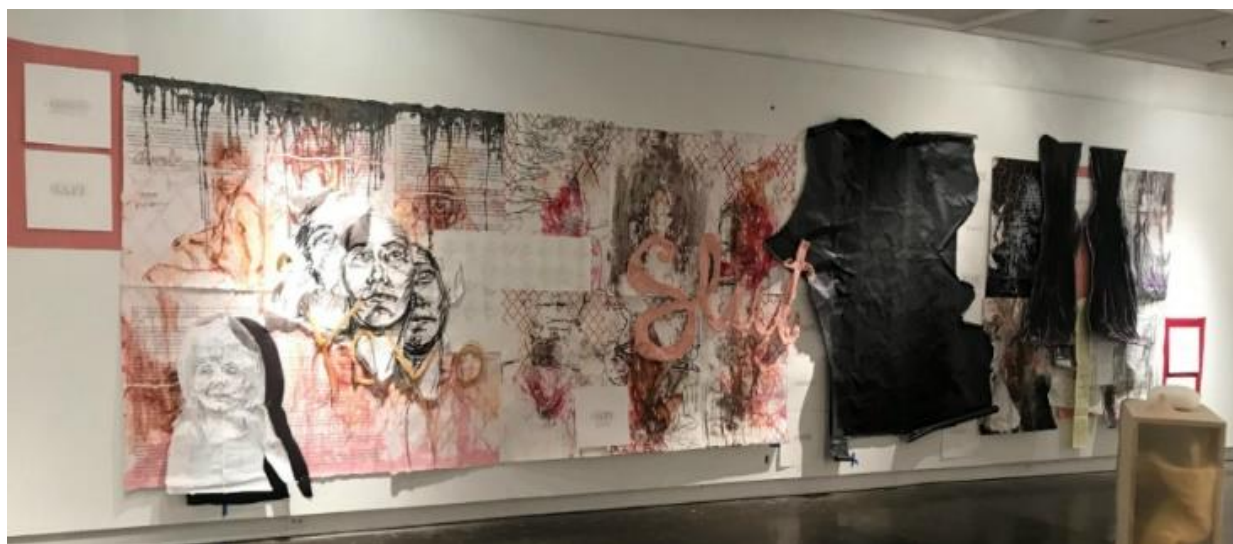
Figure 1 - Carrying On for Ten Years (Extended) , 2018, Mixed Media Installation, 8x30 feet

...but pain is not "of" or "for" anything - it is itself alone. This objectlessness, the complete absence of referential context, almost prevents it from being rendered in language: objectless, it cannot easily be objectified in any form, material or verbal. 12