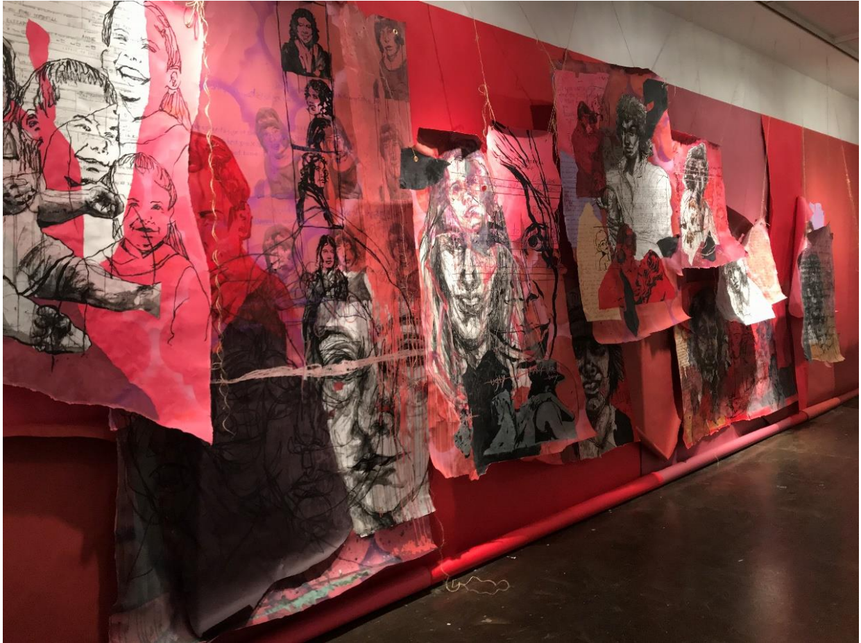
Figure 9 - The Matriarch, Installation View, 11 Mixed media drawings on paper, 10x36 feet, 2019

This is my mother's story. This is a story of the past.