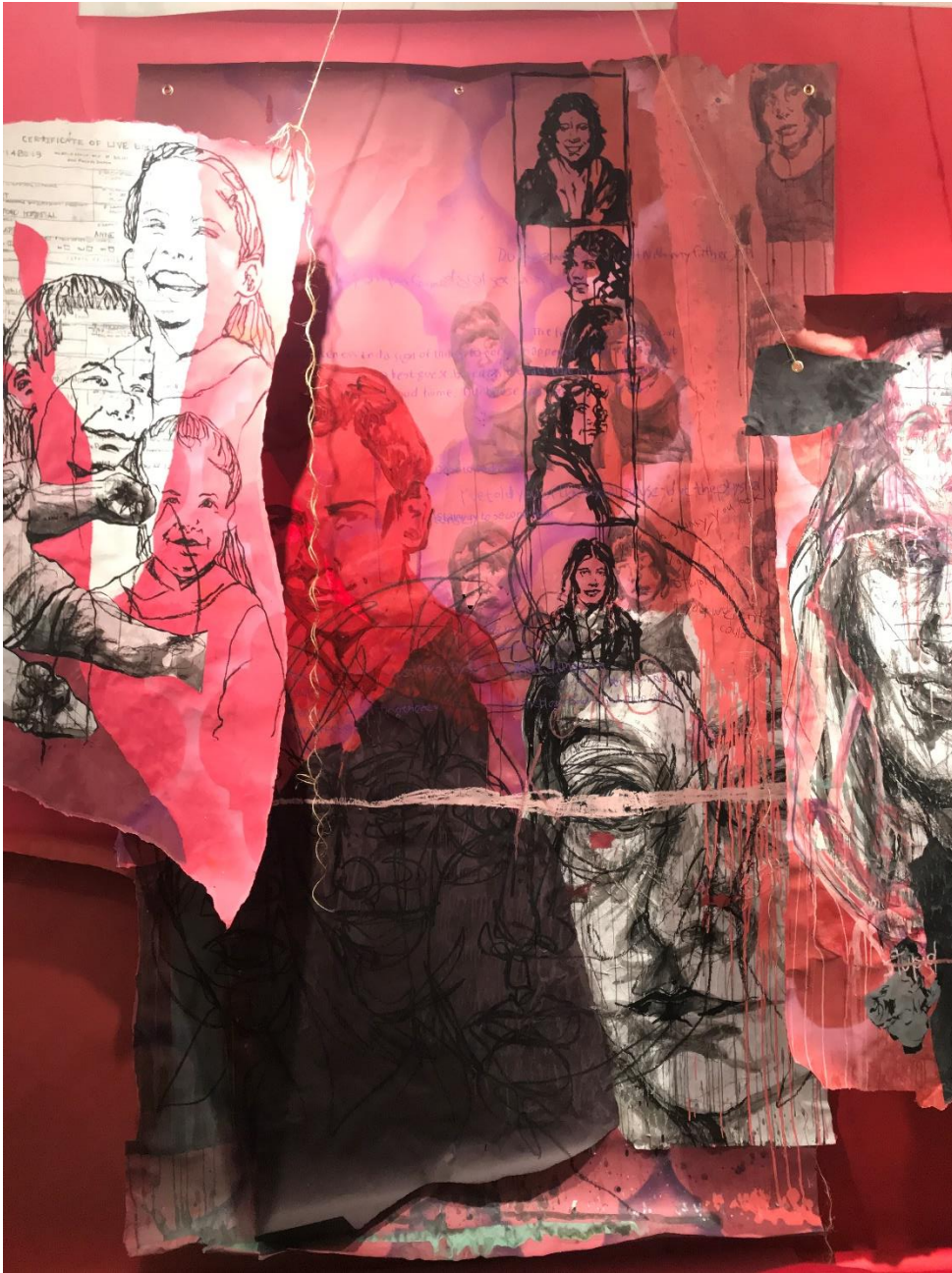
Figure 10 - The Matriarch, Detail , Mixed media drawing on paper, 2019

women's experience, and become the placeholder for the spectrum of violence and women's strength in the face of this violence.