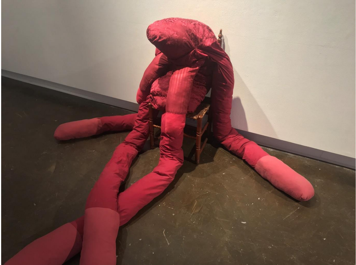
Figure 8 - Lean In (Big Mama) , Bed sheets, poly fiber fill, antique chair, 2018