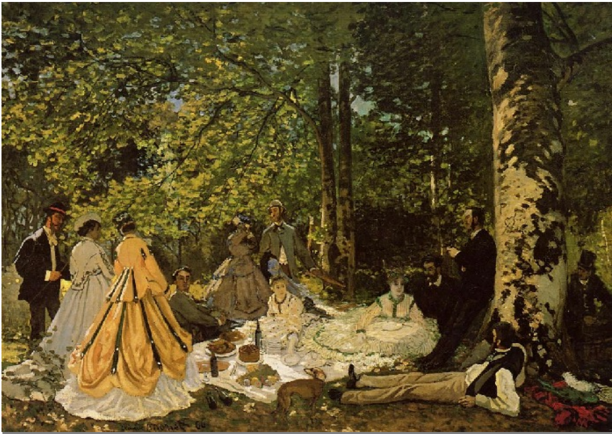
Figure 1. Claude Monet, Luncheon on the Grass . 130 x 180 cm. Pushkin Museum of Fine Arts, Moscow.