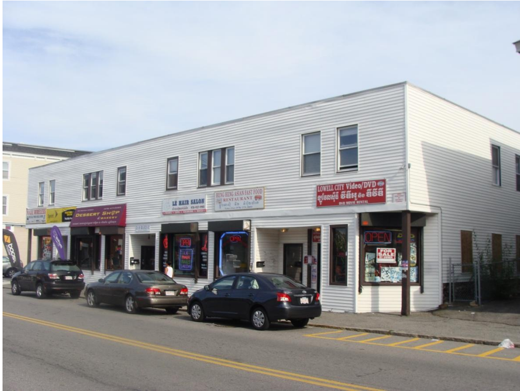
Figure 5. Streetscape along Middlesex Street

The development of Cambodia Town in Lowell highlights the recent renewal of interest in urban ethnic communities as places of cultural heritage, which stands in stark contrast to the policies of the nineteenth and early twentieth century which saw urban ethnic communities subjected to slum clearances and removal (Lin 2011). During the industrial period of American urban growth, urban ethnic communities were often subject to clearance and demolition by city managers and the federal government in the urban renewal process, as they were deemed eyesores and obstacles to modernization and cultural assimilation (Lin 2011). However, as globalization has led to the deindustrialization and urban decline of many postindustrial regions of the United States, ethnic communities have rejuvenated industrial areas, retail districts, and residential areas of the urban core. The development and growth of these urban ethnic communities has revitalized neighborhoods afflicted by the decentralization of jobs and people