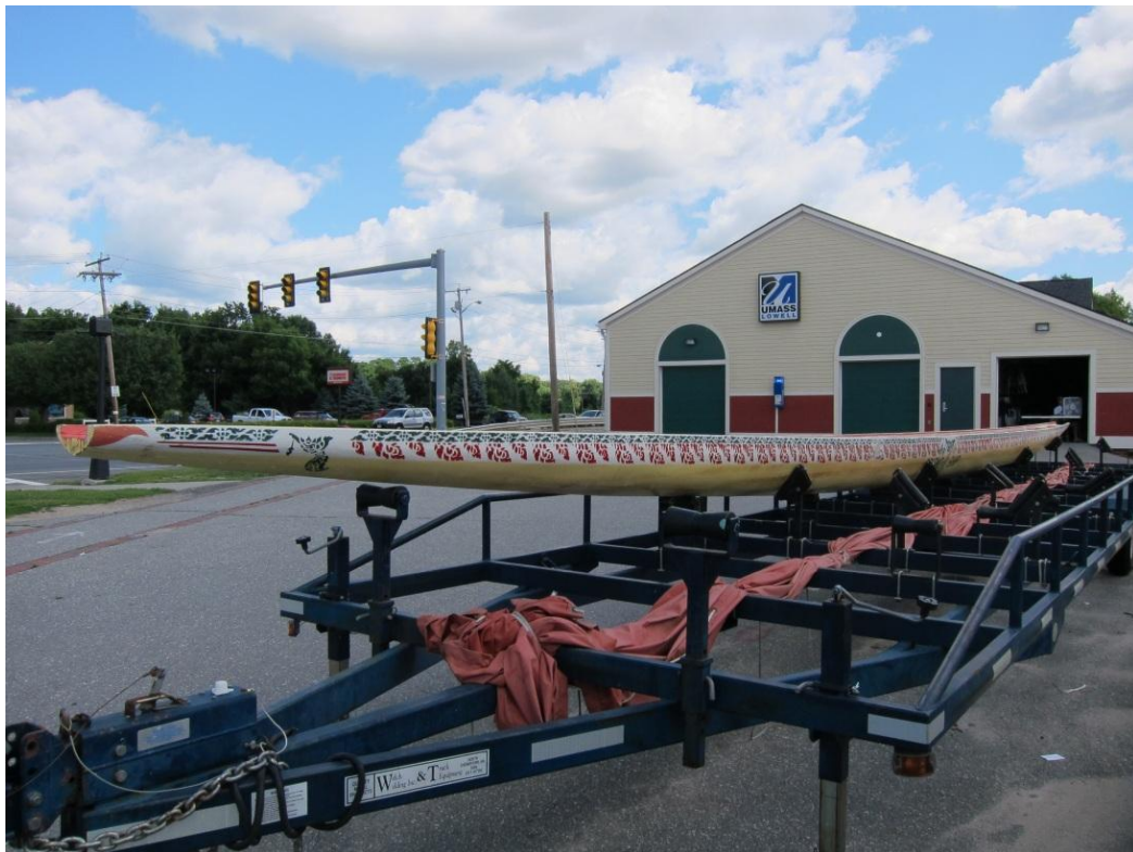
Figure 9. Dragon Boat Used In Races at Water Festival

group is followed by the nationally recognized Angkor Dance Troupe. Cambodian American youth members of the troupe are dressed in the traditional dancing clothes, preparing to demonstrate traditional dances, yet before their performance several are wearing backwards facing Boston Red Sox caps, and have brightly colored Nike shoes peeking out from underneath their traditional dress. It is through these scenes at the Southeast Asian Water Festival in Lowell that we can clearly see that moment where Cambodian tradition and transcultural assimilation intersect; where the past and the present of both the City of Lowell and the Cambodian community combine to form a new and very distinct place, one which demonstrates the resolute spirit of the Khmer culture struggling to adapt and imbue their unique history into their new home in Lowell.