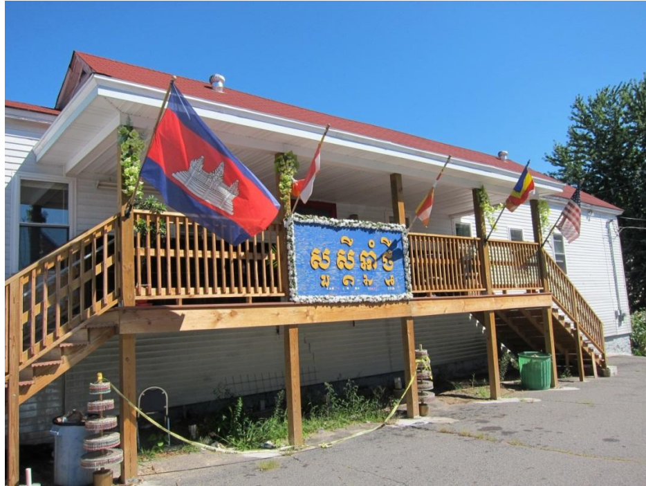
Figure 10. Trairatanaram Temple