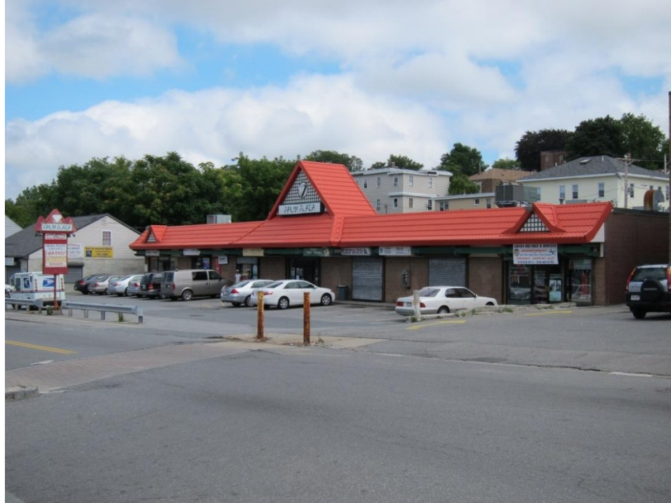
Figure 2. Pailin Plaza