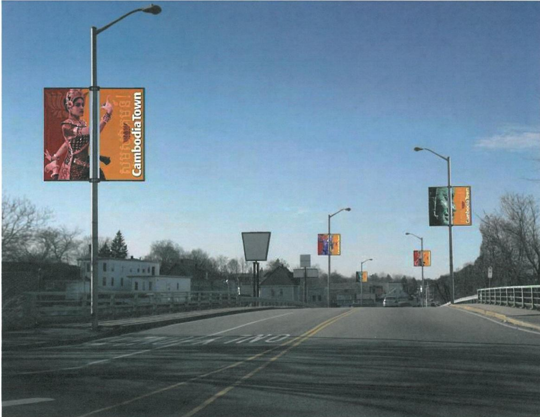
Figure 8. Mockup of Future Streetscape with Banners