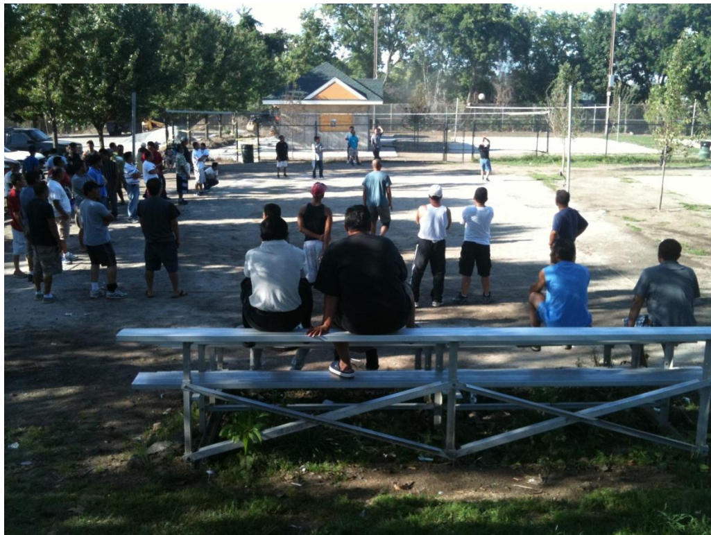
Figure 4. Volleyball at Clemente Park

many people in one place, 90% younger males, all speaking Khmer, and I think it just was intimidating. It was our park, you know, even if we didn't set out to make it our park." As park usage increased, late night activity and large groups of youth brought with it the concern of increased gang violence and illegal activity in the vicinity of the park. In reaction to the concern about a large number of Cambodian youth congregating in the park at later hours of the night, the city decided to turn off the lights in the park, effectively rendering the park useless after dark during the summer.