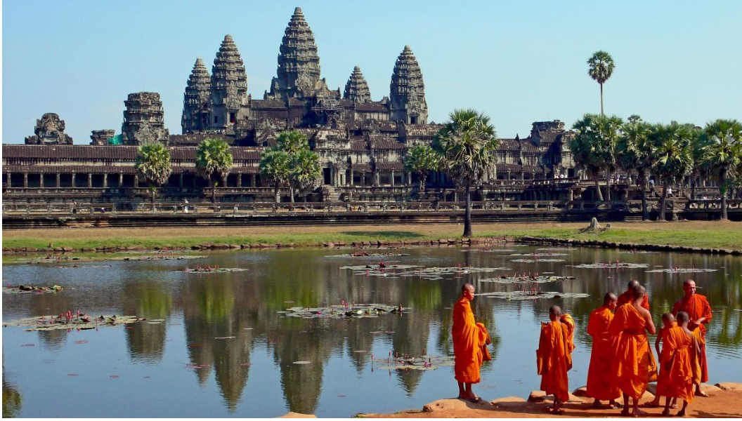
Figure 1. Angkor Wat

The temples of Angkor Wat stand in stark contrast to the conflicts that marked the next five centuries of Cambodian history. The Angkor Kingdom battled Thailand to the west and north and Vietnam to the east for territory. Several provinces of Cambodia were lost to Thailand and Vietnam, and the temples in those provinces either sacked or claimed by the victorious side (Chandler 2007). These conflicts saw the Angkor Kingdom lose a vast amount of territory, and, over the hundreds of years since, have resulted in perpetual conflict between Cambodia, Thailand, and Vietnam regarding borders and territorial encroachment. Centuries of conflict resulted in the once powerful Angkor Kingdom found in Cambodia becoming a vassal state to Thailand and Siam, until the mid-nineteenth century when the French colonized Southeast Asia, creating French Indochina from territory in Cambodia and Vietnam (Chan 2004). While they allowed the Cambodian monarch to remain on the throne, the French ruled all