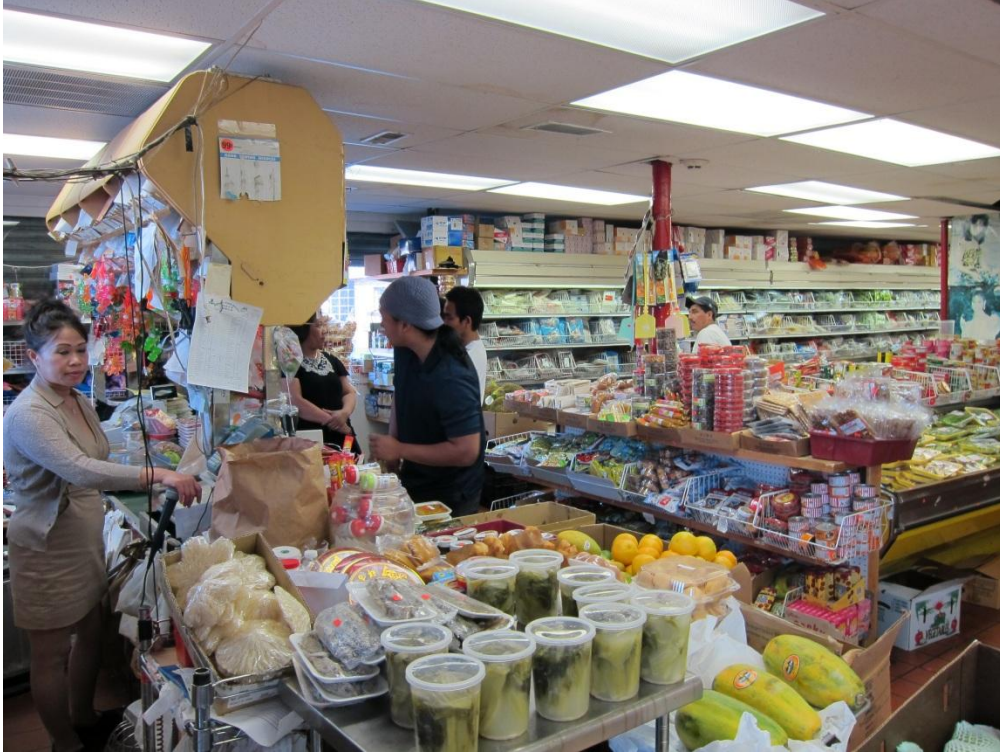
Figure 6. Cambodian Grocery Store in the Lower Highlands

City leaders in the City of Lowell have made it clear that they hope that by designating this area as Cambodia Town will promote ethnic tourism to the city. At a festival held in Clemente Park celebrating the opening of Cambodia Town, attended by over 3,000 people, Lowell Mayor Patrick Murphy stated that this “was only the start of the city’s commitment to invest and reinvest in this (Lower Highlands) neighborhood and community as an economic center” (Collins 2012). As of early 2012, the City of Lowell had created official “gateways” demarcating the boundaries of Cambodia Town. Through the “Sign and Façade Improvement Program,” over 17 local Cambodian American owned businesses, including Pailin Plaza and the Pailin City building, had received upgrades and updates. The City has worked with the community and a Cambodian American graphic designer to create banners with traditional Khmer imagery which will be installed on utility poles and light poles throughout the