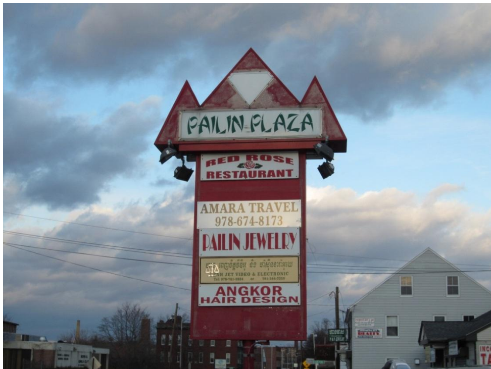
Figure 3. Signage at Pailin Plaza