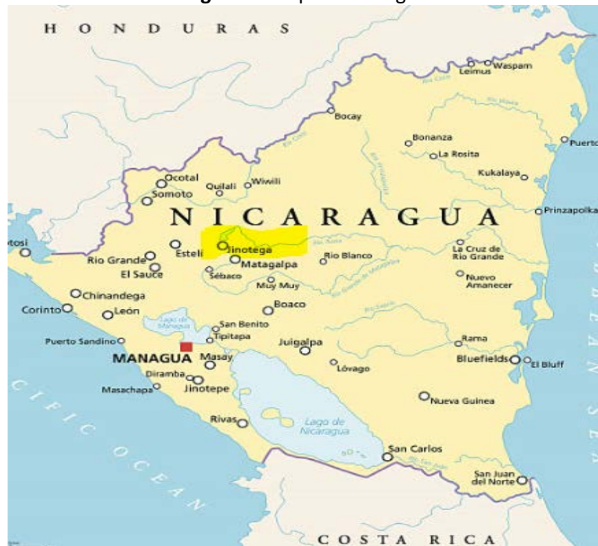
Figure 1. Map of Nicaragua

https://www.worldatlas.com/na/ni/ji/where-is-jinotega.html