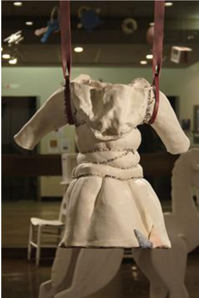
Figure 15. Reflection Detail

My perception of early female development and the domestic ties that may influence it can be seen in Reflection . In this piece, as in all of my thesis work, the toy mirror is enlarged to dwarf the adult viewer and also to emphasize its importance in forming self-identity. The toy here references the “mirror phase” of childhood development in which our original bodily discovery separates us from our parents. An additional level of early discovery is that of sexual organ differences. The mirror therefore acts as an indicator of an innocent discovery, but its placement beneath the dress calls to mind sexual awakenings later in life. This parallel between initial childhood revelations during the mirror phase and exploration of sexuality as an adult is derived from Freud’s theoretical assertions. Shaffer, in his textbook Social and Personality Development 5th Edition , writes “Not only were inborn instincts the motivational components