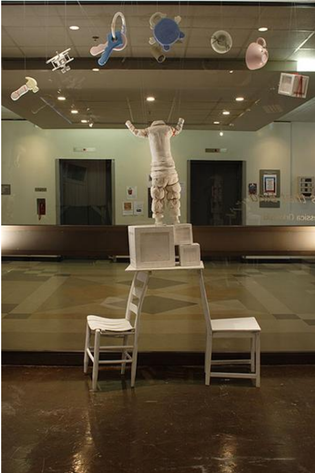
Figure 22. Juggler Detail