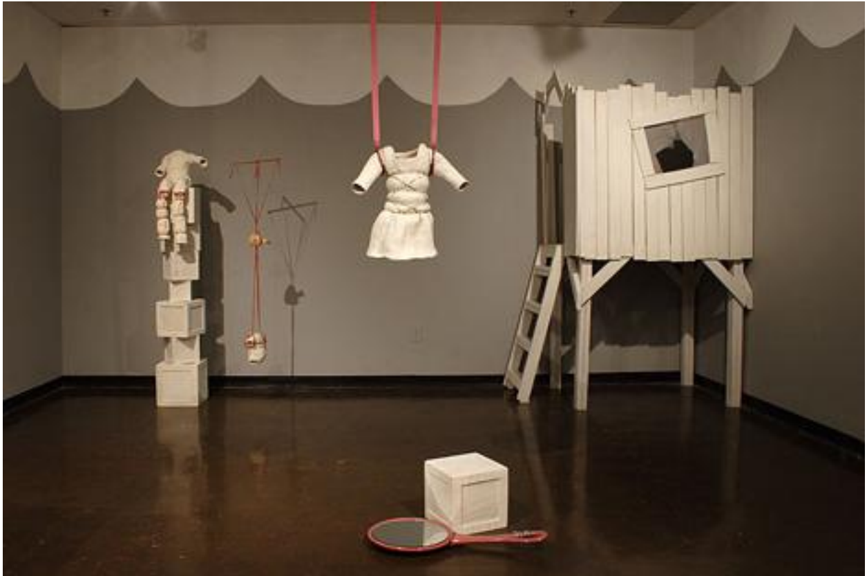
Figure 21. Ties that Bind Solo Exhibition Detail 3