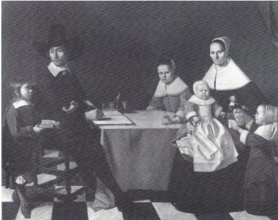
Figure 4. A Family Group by Michael Nouts

Europe was ‘discovered’ in the seventeenth century. Before children were treated as miniature adults who were part of adult society from infancy” (Humm 10).