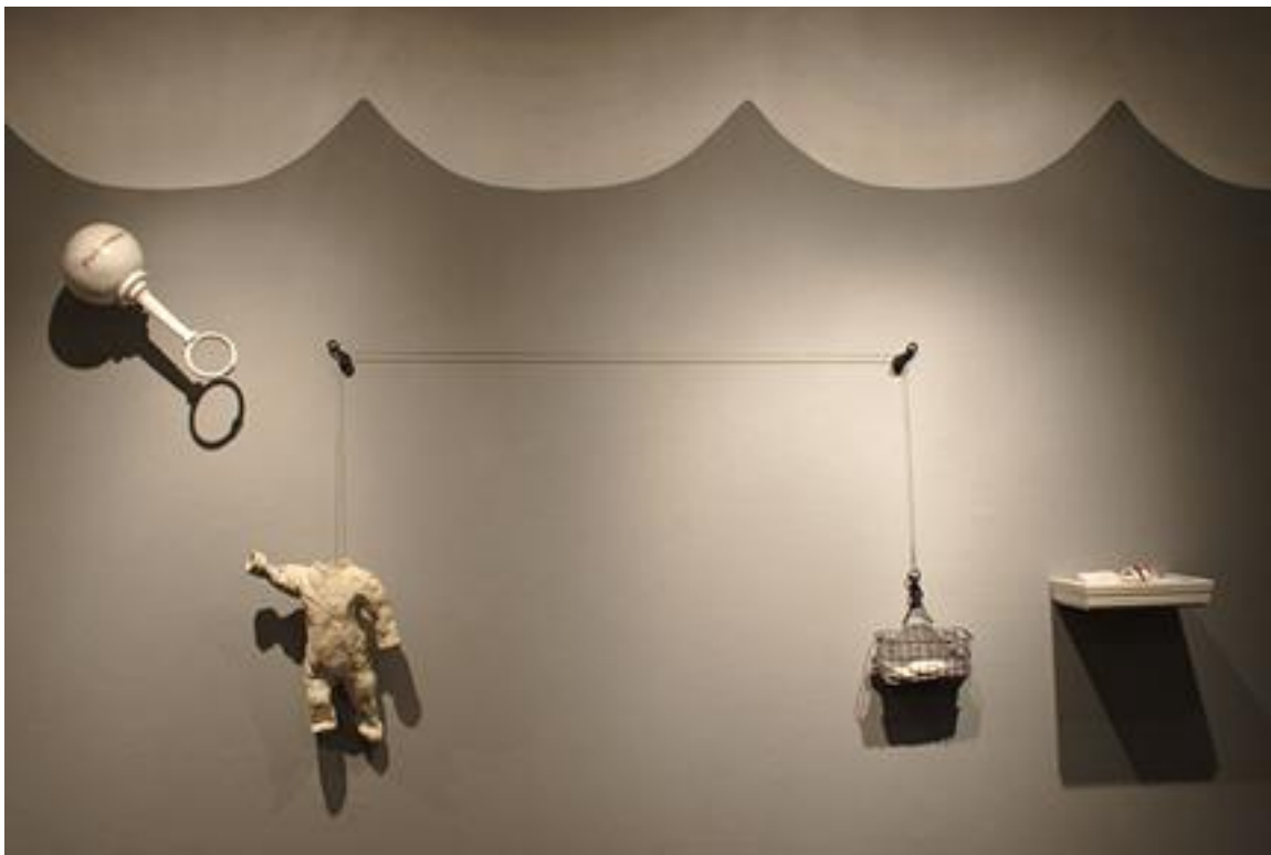
Figure 6. Princess

Princess for example, invites viewers to choose tokens to fill a metal basket. These tokens have illustrations of adult aspirations on one side and are stamped with “G-UP” on the other.