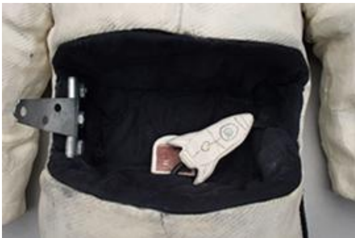
Figure 13. Hatch Detail