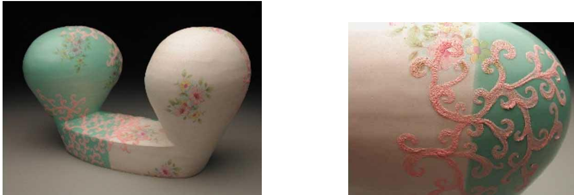
Figure 17. Bloom and Bloom Detail by Erin Furimsky Multi-fired cone 6 glaze, cone 04 glaze and stain, and ceramic decals 7" x 11" x 6"