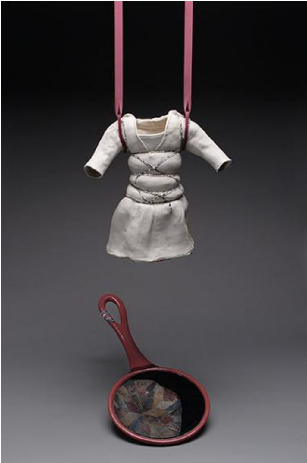
Figure 14. Reflection

Slip-dipped fabric, high-fire clay, under-glaze decals, hand-sewn and aged quilt