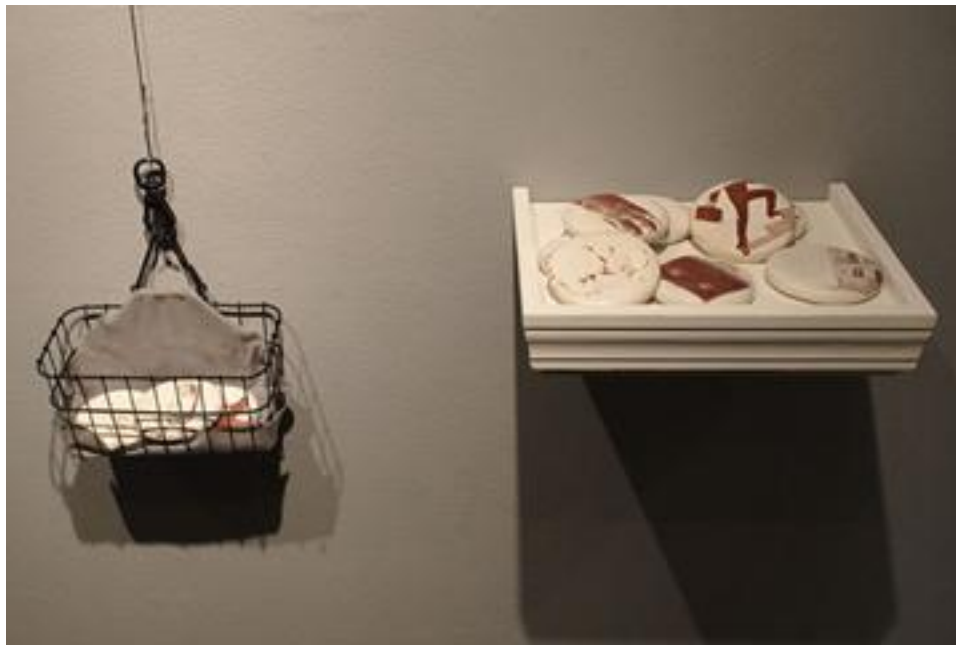
Figure 7. Princess Detail by Jessica Orłowski

These tokens or awards are intended to mimic the way in which toy companies, such as Playskool, playfully (though oddly) label instructional materials. “G-UP” is an abbreviation for “grown-up” and is used to give value to the tokens as collectables that must be obtained to be considered an adult. Examples of grown-up attributes are seen in images of adult privileges or responsibilities including cars, houses, children, and jobs. Viewers may absentmindedly add tokens to the basket or (given the setting and ceramic material) may take the time to look at the pieces they choose. Because of the pulley system, the viewer will expect that the figure will eventually reach the rattle, but no matter how many tokens the figure collects it does not reach its goal. I am hoping that the realization of the ceramic figure’s situation will evoke a personal memory or emotional response as the viewer empathizes with the futility of the pressures of adulthood.