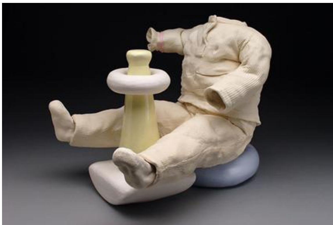
Figure 3. Ring Toy Slip-dipped fabric, high-fire clay, ceramic under-glaze 11 1/2" x 13" x 18" by Jessica Orlovski

glance. Are viewers more comfortable with one toy than another? Does the empty dress bring up a surprising memory or visceral response? Though I have created a path, and hope to elicit introspective experiences for my viewers I cannot control what the viewer takes from the experience. However, by incorporating interactive and alluring techniques I am hoping to draw attention to, and encourage lasting impressions of my work.