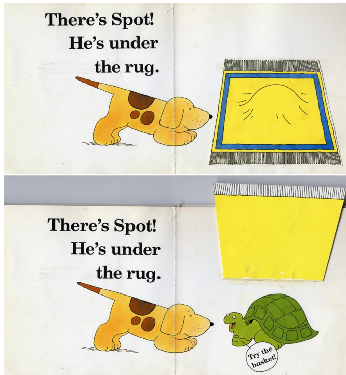
Figure 5. Where's Spot? by Eric Hill

Modern versions, such as Eric Hill's Where's Spot? , tend to be predominantly based in exploratory actions such as reading and following instruction. This follows their predecessors in the intent to entertain and educate, but much of the early conveying of moral messages has been left behind.