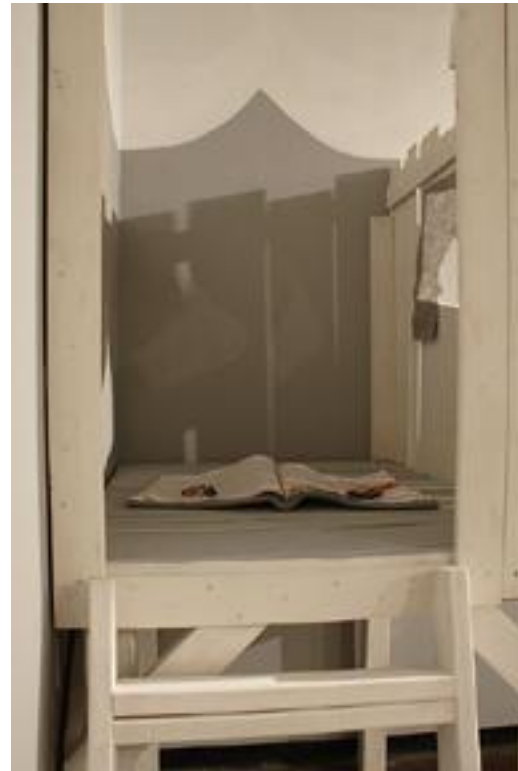
Figure 8. Tree House and Tree House Detail