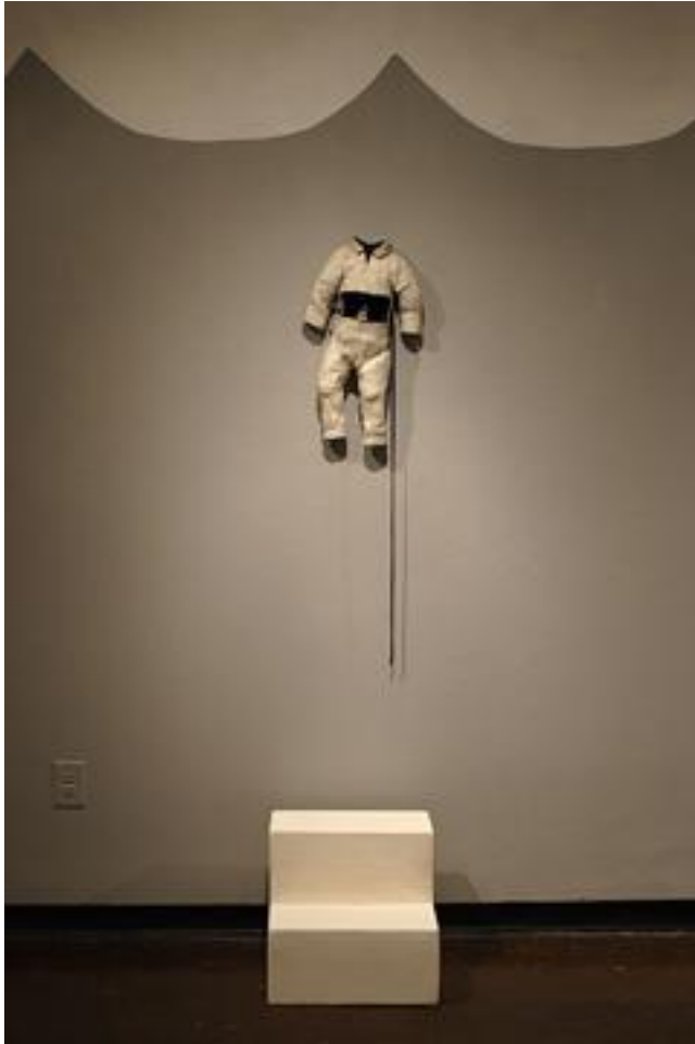
Figure 12. Hatch Slip-dipped fabric, high-fire clay, ceramic under-glaze, spring mechanism 23" x 14" x 4 ½" by Jessica Orłowski