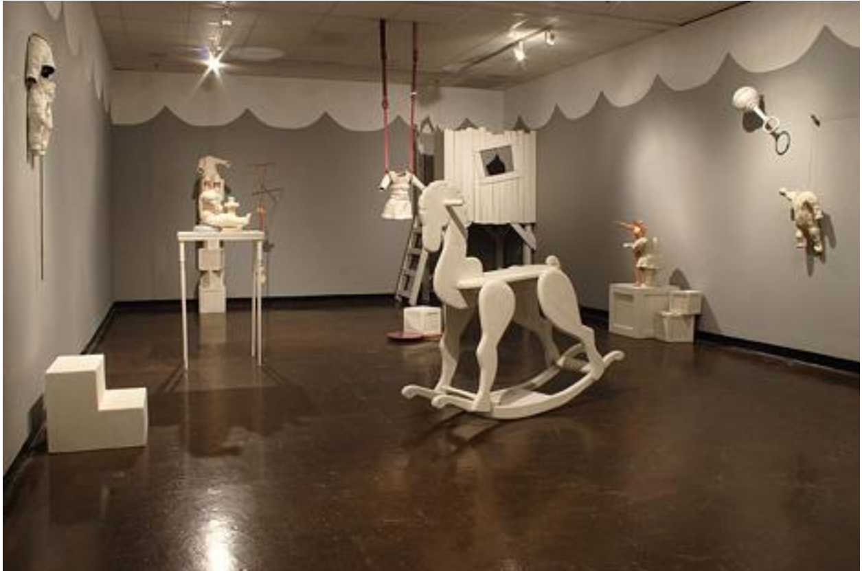
Figure 19. Ties that Bind Solo Exhibition Detail 1