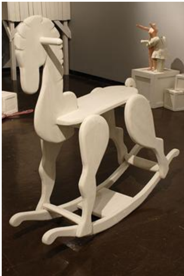
Figure 9. Rocking Horse Pine and Milk Paint 5 ½' x 1' 3" x 5' 10" by Jessica Orlovski

Rocking on the horse or coloring in the tree house and looking at the work around them was meant to encourage a playful and interactive mentality in the viewer, thus relieving some adult inhibitions and creating a safe space for imagination and play.