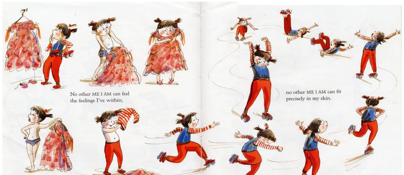
Figure 10. ME I AM! by Jack Preutsky

Though we are inherently very similar, the need to be an individual divides us from the “other,” and we distance ourselves from any experience outside our own skin. This notion of separation begins early and is reinforced by children’s literature such as Jack Preutsky’s ME I AM! . Though endearing in its message of self esteem, this book (along with many others) and contemporary parenting styles build fortresses around the individual, making empathy difficult to evoke.