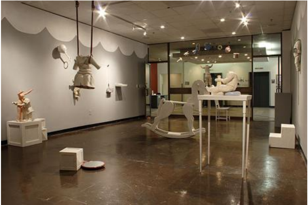
Figure 20. Ties that Bind Solo Exhibition Detail 2