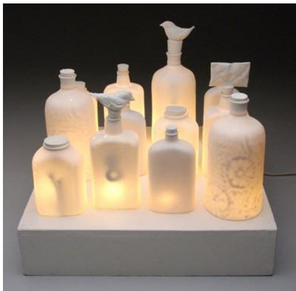
Figure 2. Equilibrium Interrupted by Ilena Finocchi 18" x 28" x 28"

Using translucent porcelain and dim lighting, Finocchi draws her viewers to pedestal pieces composed of ceramic bottles. These bottles reference domestic uses and collectables as well as a castaway's floating messages. The bottles are "filled" with light that reveals inner objects, the shadows of which are cast on the bottle's exterior. The resulting silhouettes are haunting and invite the viewer to approach them, touch them, and join in the game of metaphor and memories. Finocchi herself describes the work as "a metaphorical language... (that) builds narrative through fantasy and play as a child naturally would" (Finocchi). This notion of child's play is emphasized by the bottles' stoppers, which incorporate birds, letters, and other playful, yet meaningful, imagery. The transportation of messages, perhaps wisdom from the long forgotten days of childhood innocence, is suggested.