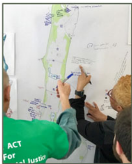
Mapping strategies for Resilient city to urban flooding scenario, Harlem

Activities in this phase are designed to add details to the scenario pathway (Fig. 6.2). A key outcome is to provide enough spatial, temporal, and other key details to delineate a scenario pathway and parameterize subsequent modeling and assessments (Table 6.1).