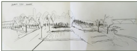
Narrative and future visions of 2080 Innovative city scenario, Valdivia, visualized by design student