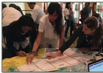
Negotiating the pathways and timeline to achieve each strategy and target in Resilient city to coastal flooding scenario, San Juan