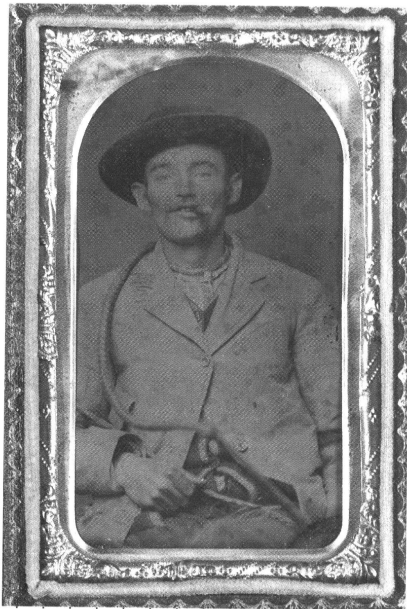
Figure 5. Jesse Woodson James. ca. 1870. Photographer Unknown. National Portrait Gallery, Smithsonian Institution.

Europe (including London and Paris), and this is when the display of the mug shots would match that of the artistic gallery in the sense that the viewer was to gaze upon on the object on the wall, comparable to how one looks at works in a museum. 89