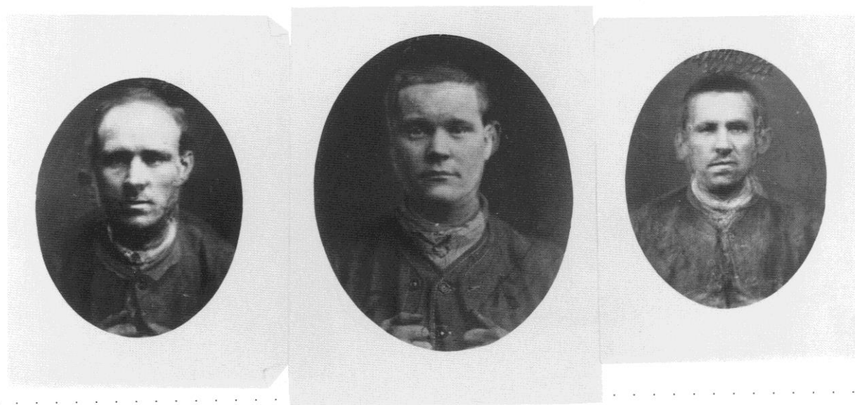
Figure 2. Criminal Composites. 1870s. Sir Francis Galton. Galton Papers , The Library, University College London.

science and photographic experiments used known criminals and reinforced the already captured (both photographically and judicially) criminal body as opposed to investigating if a “habitual criminal” type actually existed. Galton acknowledged this technique was an inconclusive and ineffective way to determine if there was a predetermined criminal type in humans. 36 However with this aspect of his portraiture, Galton created, in a sense, what Allan Sekula theorized to be, a collapsed version of the archive. The blurred portrait creates an idea of the general, abstracted population, much in the same way the human mind cannot recall a particular face in a crowd on a given day, but can recall general characteristics of a person. We form these general impressions from individual memories, Sekula states in “The Subjects of Criminal Identification,” but they collapse on themselves to form a generalized “type” in our mind. 37