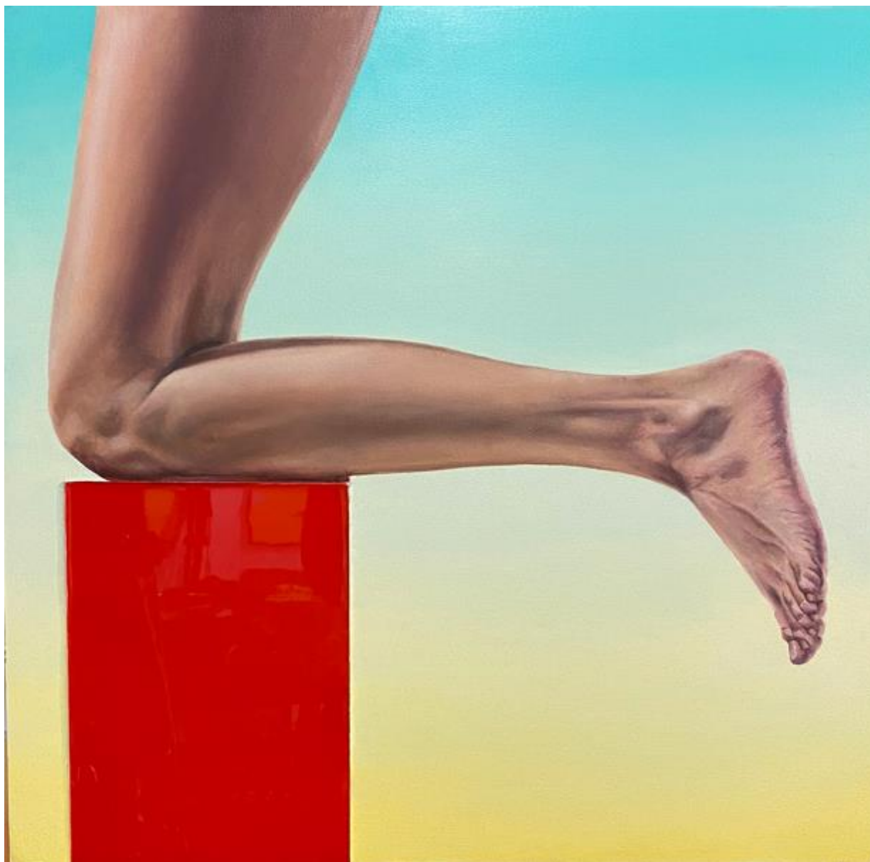
Figure 1. Monk Knee 2020, 24x24", oil, acrylic, resin on wood panel.

Two pieces from 2020 that illustrate this conceptual shift are Monk Knee and Corrido de Santanon . Monk Knee is an oil painting inspired by my inner recluse and harsh meditation practice. The turquoise to yellow gradient represents the void which is everything and nothing, the eternal zone or space of possibility. My gradients are like a cloudless sunset or sunrise, colors lighting up a limitless sky that is physically inaccessible. I think of them as a place of serenity in