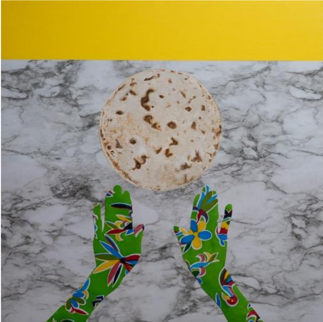
Figure 22. Felicia Castro. Tortilla Sunrise , 2022, 24x24", oil, shelving-paper, oilcloth on wood panel.

Interwoven throughout the video is a close up shot of a woman's hands making tortillas from scratch. This flat bread delicacy is not just a side but is an essential part of the main course and is cherished within the Mexican American community. It takes years of practice to make them perfectly. Tortilla Sunrise is a tribute to tortillas and tortilla makers. For this painting I combined materials in a collage to speak to assimilation. On a 24x24" wood panel I covered all but a 3" horizontal strip at the top with the marble shelving paper and painted the strip bright yellow as a nod to the sun. I cut out a flat outline of my hands and forearm in the act of pushing a