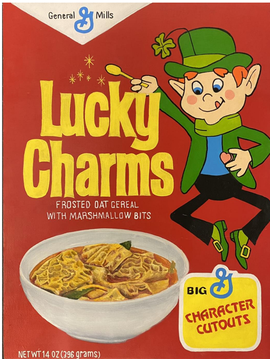
Figure 4. Felicia Castro, Breakfast of Champions , 16x12", 2022, oil, acrylic on wood panel.

I remember watching educational films about the history of the Southwest in elementary school: pioneers, early settlers, and the white idealized formation of a nation. In these films,