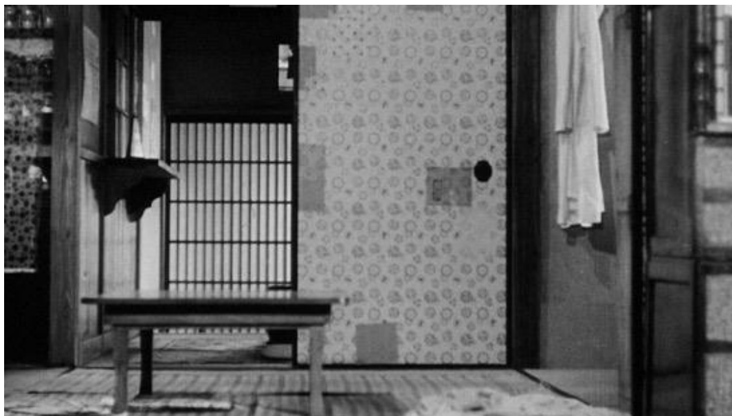
Figure 2. Yasujiro Ozu, Still image from Tokyo Story , 1953. https://www.janusfilms.com/films/1755

as an assimilated Mestizo and to go back to my family histories: histories that were steeped in a rich culture, but that had nearly evaporated in my quest for individuality and my pursuit of happiness.