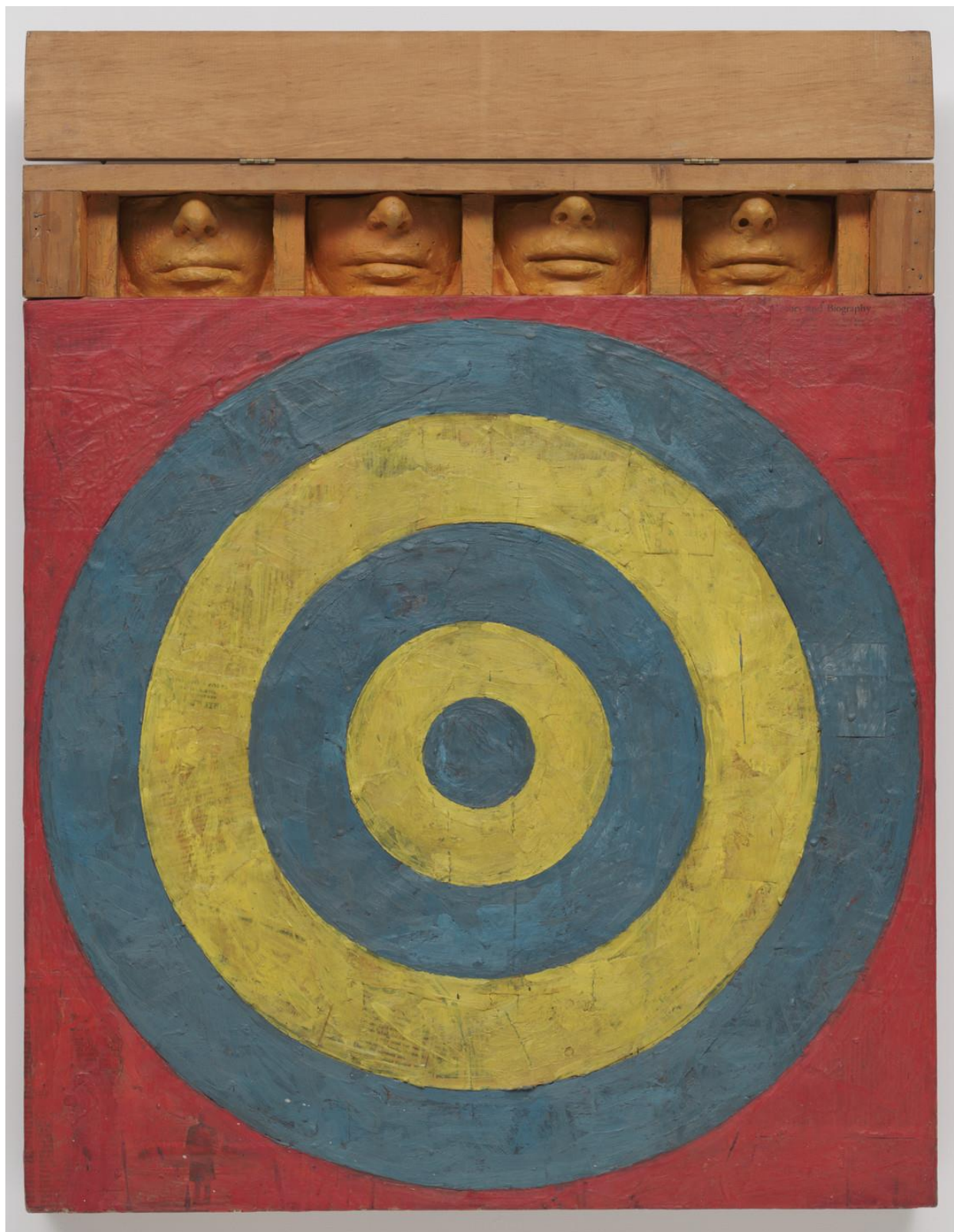
Figure 7. Jasper Johns Target With Four Faces , 1955, 33x26x3", Encaustic on newspaper and cloth over canvas surmounted by four tinted-plaster faces in wood box with hinged front. https://www.moma.org/collection/works/78393