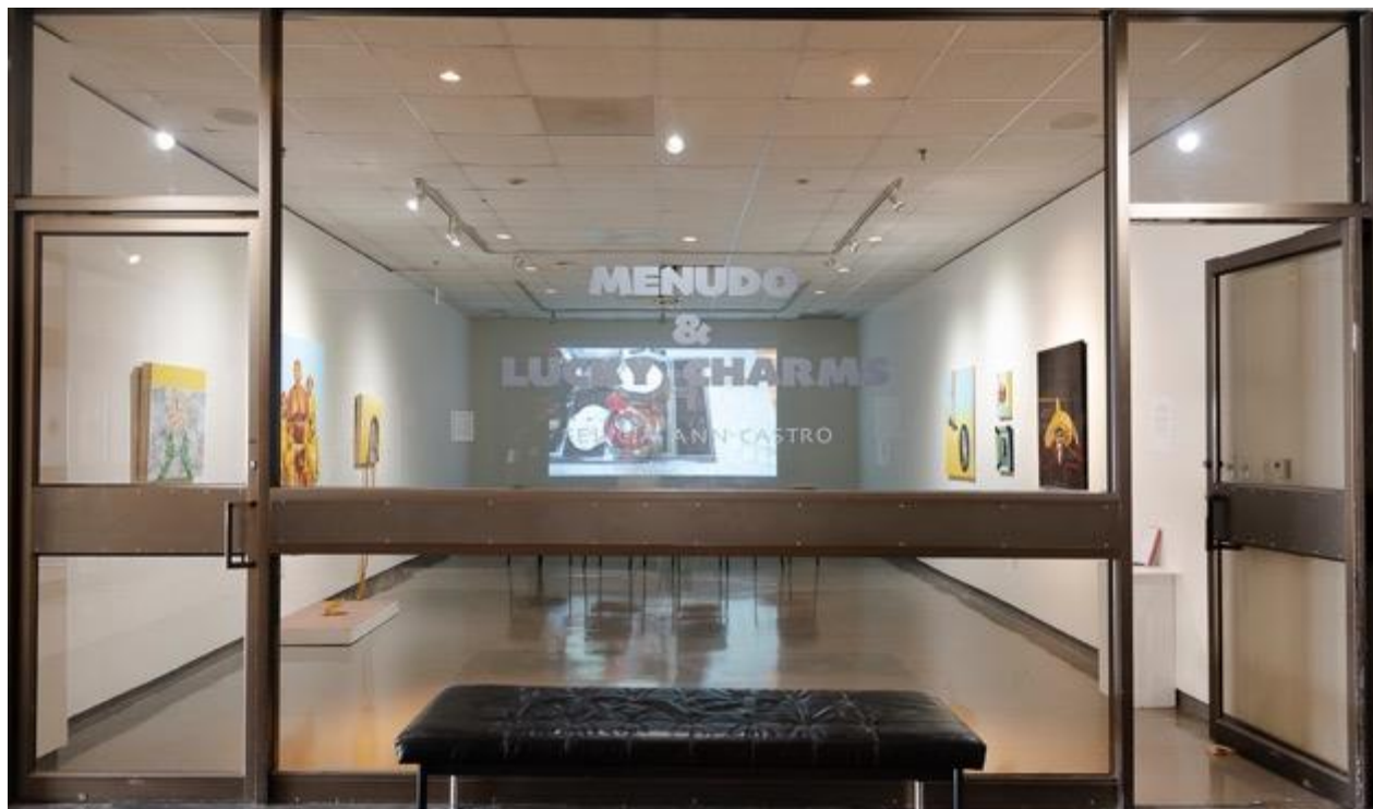
Figure 10. Felicia Castro. Menudo & Lucky Charms installation view. 2022.

I divided the rectangular gallery space into two spaces: one space for the video which was projected against the back wall with seating provided, and one space in the front half of the gallery where three paintings hung on one side and four on the other. Unlike many painting exhibitions, my paintings were formally disparate and seemingly unrelated. The video acts as the unifying element; it provides context for all the works in the show. The paintings express a similar range of moods as seen in the video: humor, solemnity, sincerity, and irony. To live and be part of two different cultures is to bounce endlessly between ideologies, values, customs, and social norms. My aesthetic choices mirror this dance.