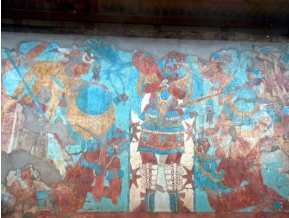
Figure 20. Monte Albán, Zapotec Mural . https://www.salsaandsun.com/monte-alban/

The Santuario de Chimayo is another important story mentioned in the video. I included this story to communicate my lost indigenous roots, the cycles of assimilation, and colonialism's aftereffects. Chimayo is a church in Northern New Mexico that I used to frequent as a child. The church claims to have miraculous healing dirt in a hole in the floor next to the sanctuary. Through research, I discovered that this church was built on a Native American sacred site. The Tiwa called it Tsi-Mayoh and believed it had healing powers. The Spanish invaders stole the land, built a church on top of it, and claimed the dirt for their own purposes. Interestingly, I found that the Pendleton company appropriated the "Tsi-Mayoh" name for one of the designs on its overpriced blankets and jackets. This story encapsulates the history of New Mexico, from Native to Mestizo to capitalism, and inspired the pieces Pochita Preciosita and Tsi-Mayoh .