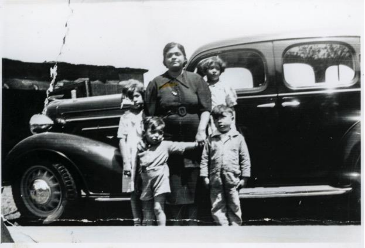
Figure 17. Family photo circa 1937.