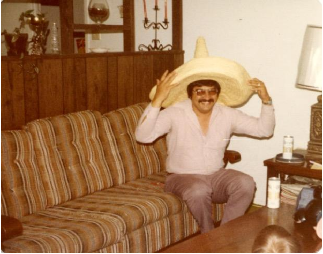
Figure 15. Castro Family Photo, Dad , 1976.