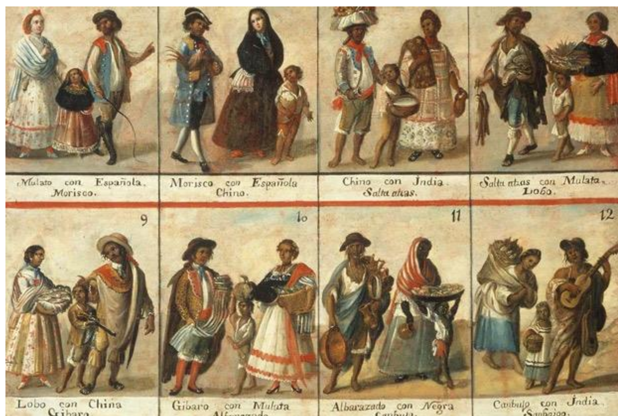
Figure 5. An 18th century casta painting via Wikimedia. Source: https://daily.jstor.org/the-paintings-that-tried-and-failed-to-codify-race/

prejudice was propagated by casta paintings that depicted the social hierarchy: white Europeans at the top, and indigenous people, whose skin was tanned by the sun, down at the bottom. 16