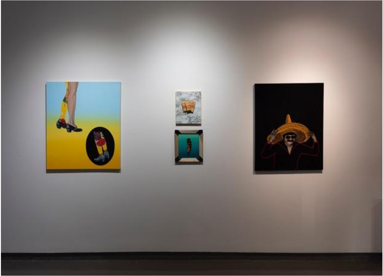
Figure 12. Felicia Castro. Menudo & Lucky Charms installation view. 2022.