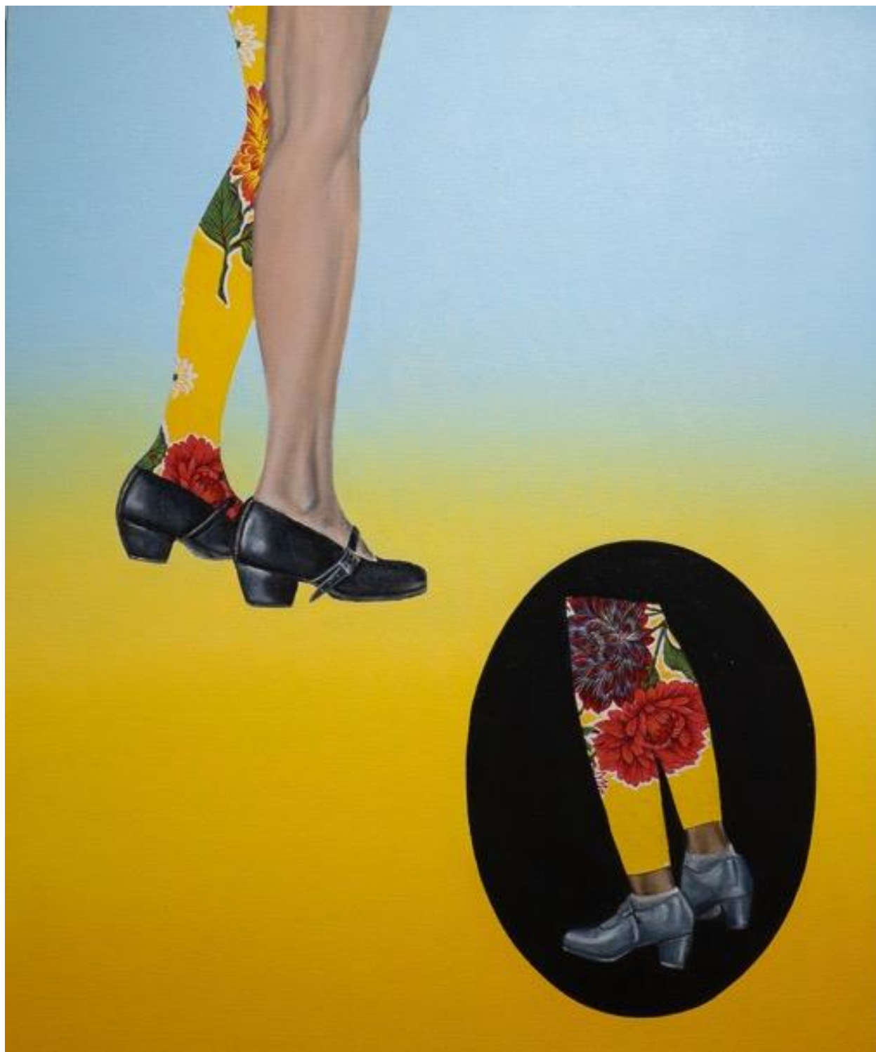
Figure 23. Felicia Castro. El Huateche Dance Lesson , 2022, 38x32", oil, oilcloth on canvas.