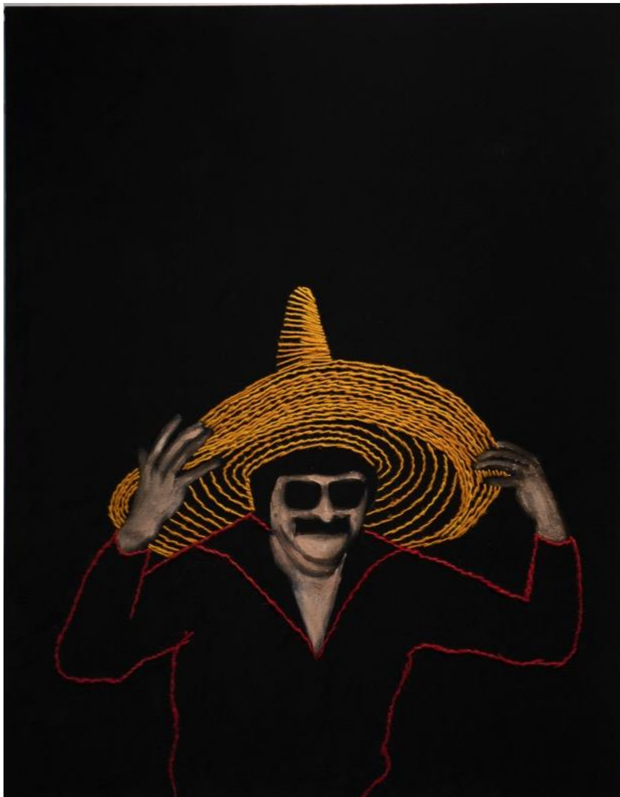
Figure 16. Felicia Castro, El Chingon , 2022, 38x30", oil, yarn, on cotton velvet.