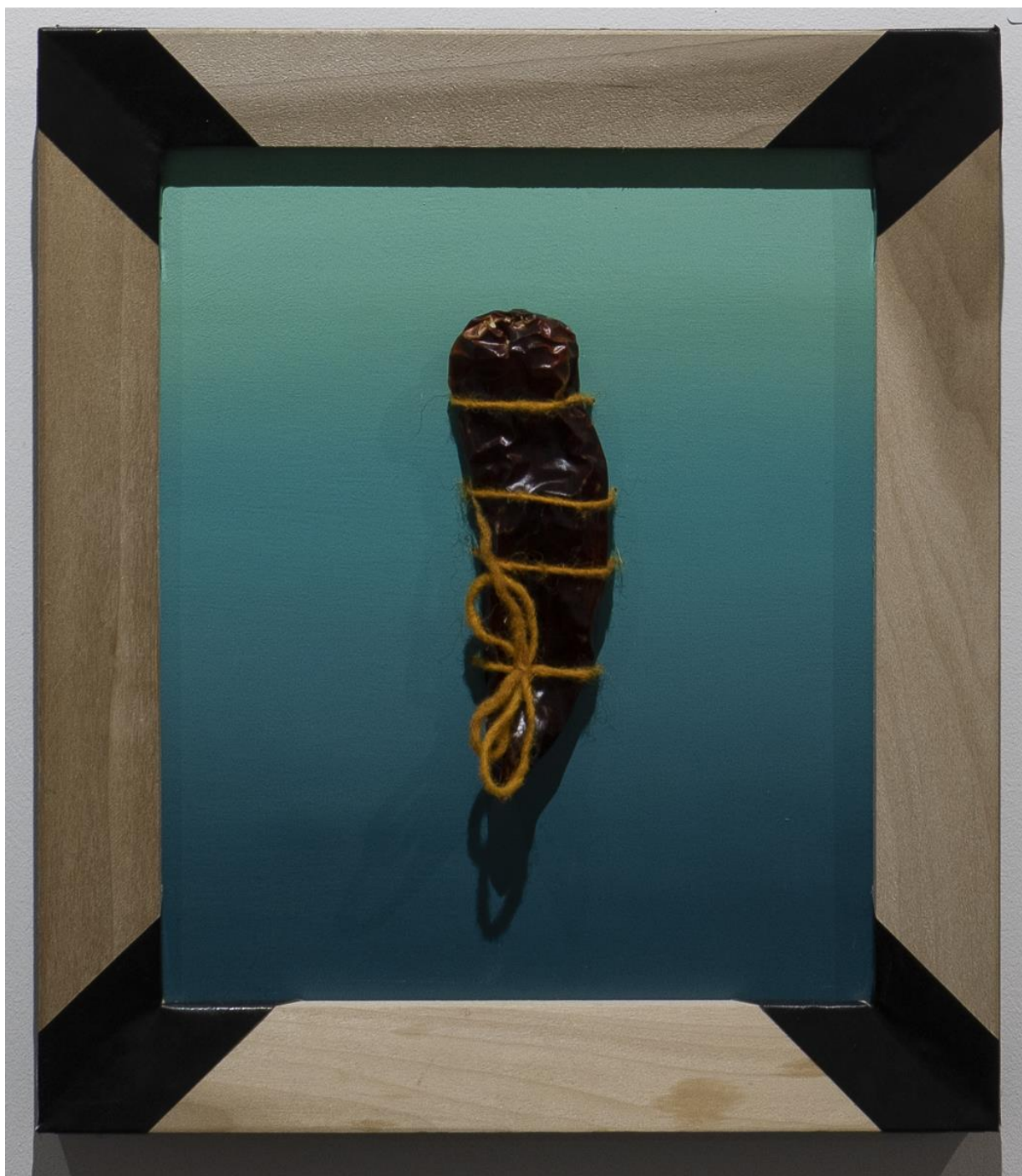
Figure 6. Felicia Castro, Orgullo y Verguenza , 2021, 11x14", oil, Hatch red chile, pine, duct-tape on wood.