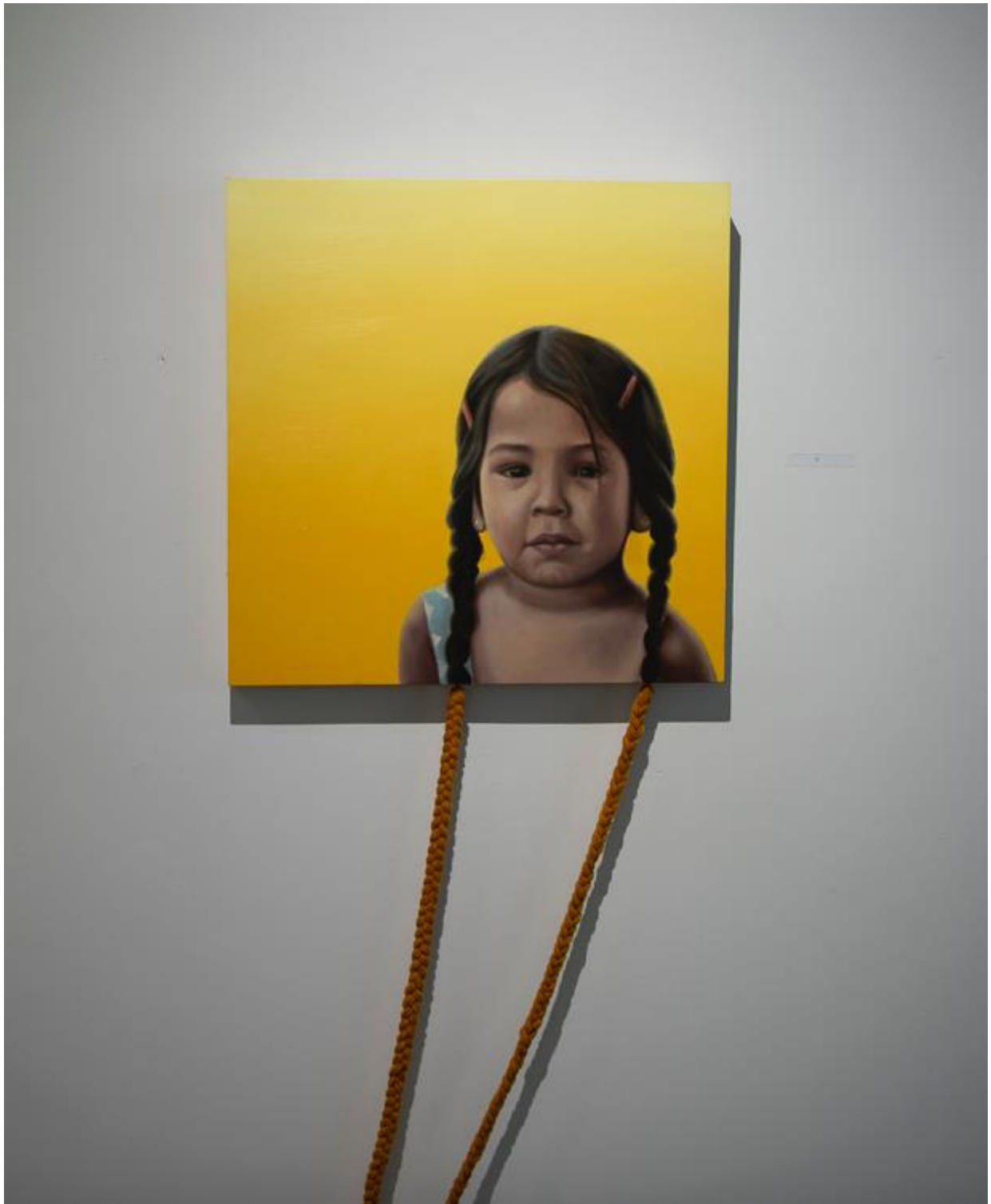
Figure 21. Felicia Castro. Pochita Preciocita , 2022, 24x24", oil, yarn on wood panel.