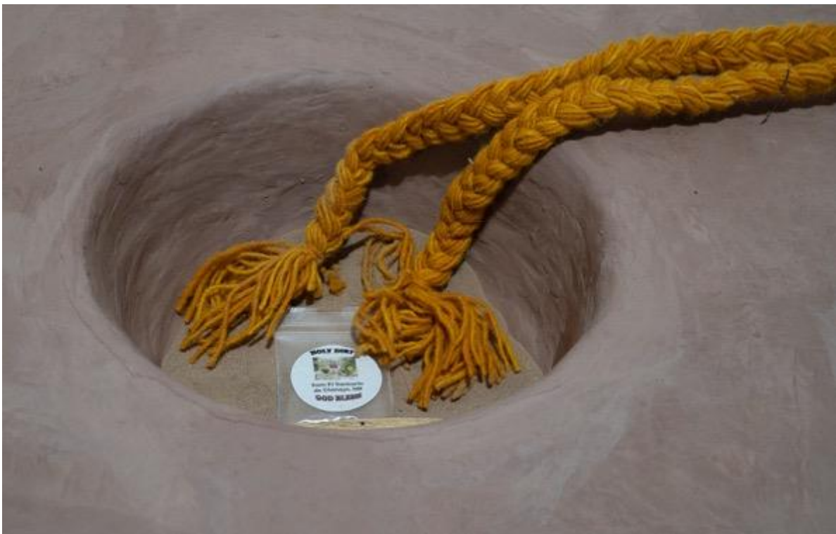
Figure 20. Felicia Castro. Tsi-Mayoh detail shot. 2022.