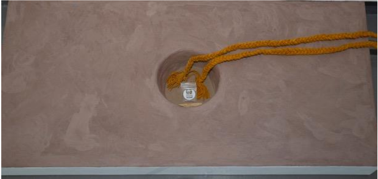
Figure 19. Felicia Castro. Tsi-Mayoh installation shot. 2022.