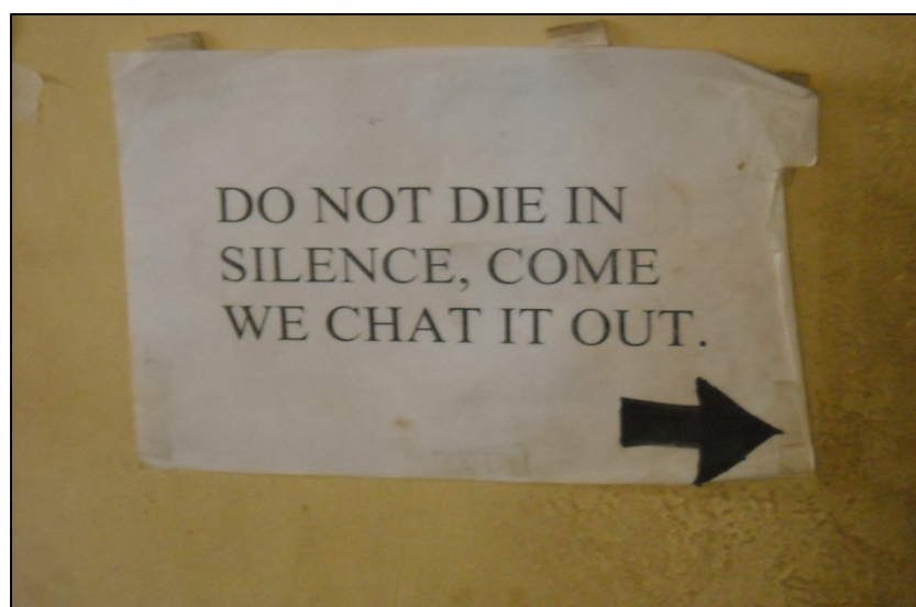
Figure 2. Note posted on wall in Drop-in Center, by UYDEL staff, to encourage help-seeking behaviors among potentially suicidal youth.

Despite these limitations, the findings clearly underscore grave and unmet needs among these vulnerable youth which has implications for research and practice. While these vulnerable youth may have unique circumstances and needs, overall the psychosocial correlates associated with suicide ideation examined in this study mirror those of previous studies of other African youth [8,10,12,39]. However, additional research is needed to replicate these findings since they are primarily based on a convenience sample of youth who have sought out services offered by a drop-in center. As such, their experiences may be different than that of other youth and should be documented in greater detail and also preferably in a longitudinal cohort to better determine the initiation of risk behaviors and the identification of modifiable factors that may be suitable for prevention.