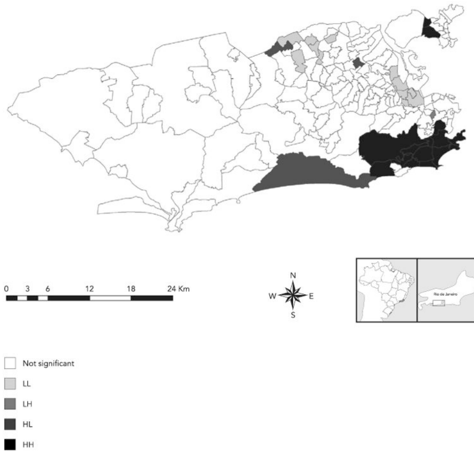
Figure 3. Map displaying the local autocorrelation (Local Moran Index) for the ward-level Urban Health Index (UHI) values, Rio de Janeiro, Brazil, 2010, with statistically significant clusters of high index wards (HH) and low index wards (LL).