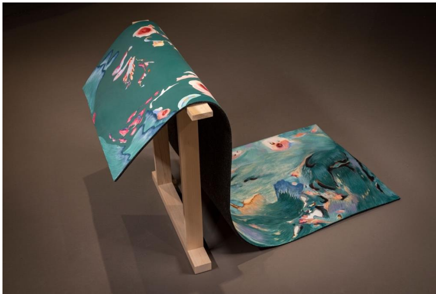
Figure 7.3 Leeza Negelev, Installation View 7