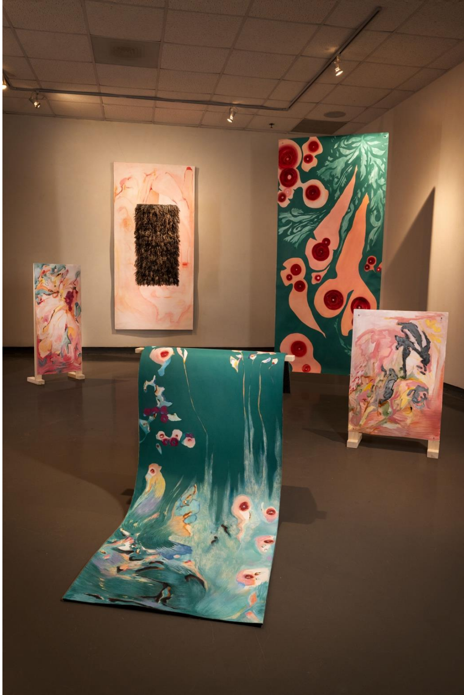
Figure 6.4 Leeza Negelev, Installation View 4