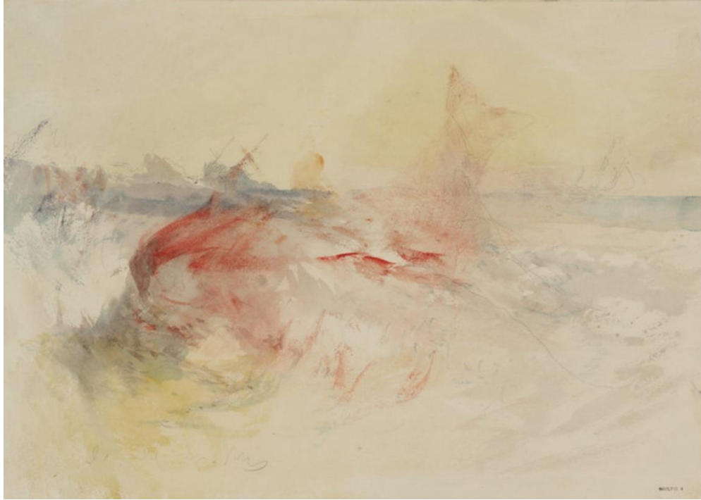
Figure 5.3 Turner, Joseph Mallord William. A Harpooned Whale . 1845, London, Tate.

When I'm subordinating my eye to my hand, there is always a specific kind of pause that occurs. The attention to the manual draws my interest to a painterly gesture on the paper that clarifies the whole work. The moment is typically sudden, and whatever I've observed is trivial. It's simply a movement within a constellation of movements that offers me an understanding of what the painting is about .