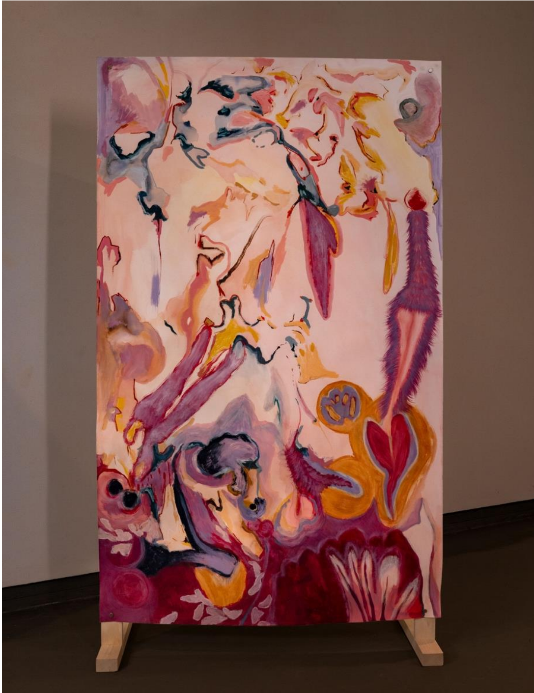
Figure 5.4 Leeza Negelev, Installation View 2