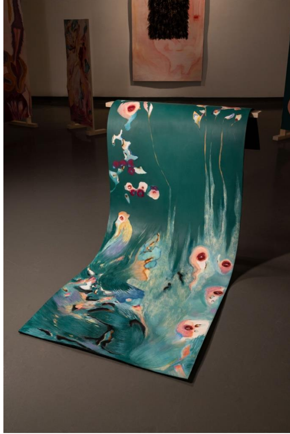
Figure 7.2 Leeza Negelev, Installation View 6