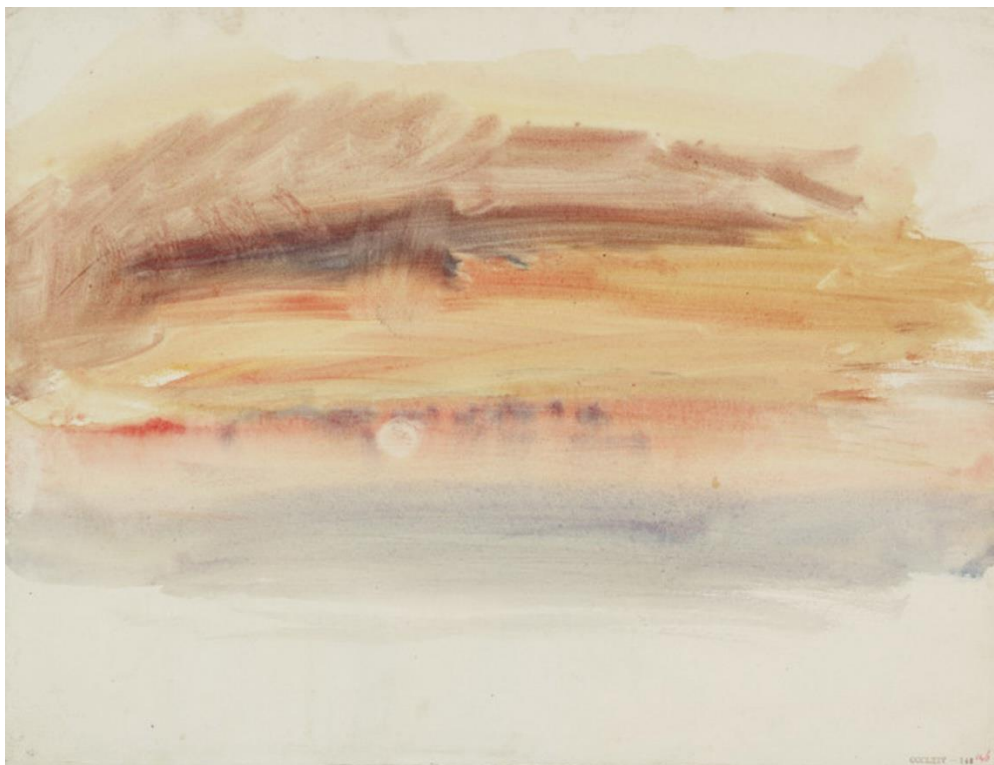
Figure 5.2 Turner, Joseph Mallord William. Sunset . 1845, Tate, London.

If we seek the precursors of this new path, of this radical manner of escaping the figurative, we will find them every time a great painter of the past stopped painting things in order to “paint between things.” Turner’s late watercolors conquer not only all the forces of impressionism, but also the power of an explosive line without outline or contour, which makes the painting itself an unparalleled catastrophe... But with Pollock, this line trait and this color-path will be pushed to their functional limit: no longer the transformation of form but the decomposition of matter, which abandons us to its lineaments and granulations. The painting thus becomes a catastrophe-painting ... Here it is no longer an inner vision that gives us the infinite, but a manual power this is spread “all over” from one edge of the painting to the other (86).