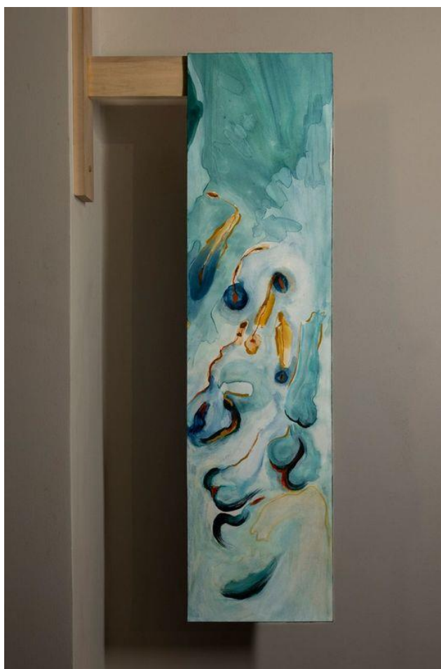
Figure 2.1 Leeza Negelev, Installation View 1

A painting feels lived-out to me, not painted. That's why one is changed by painting. In a rare magical moment, I never feel myself to be more than a trusting accomplice. So the paintings aren't pictures, but evidences – maybe documents, along the road you have not chosen, but are on nevertheless.