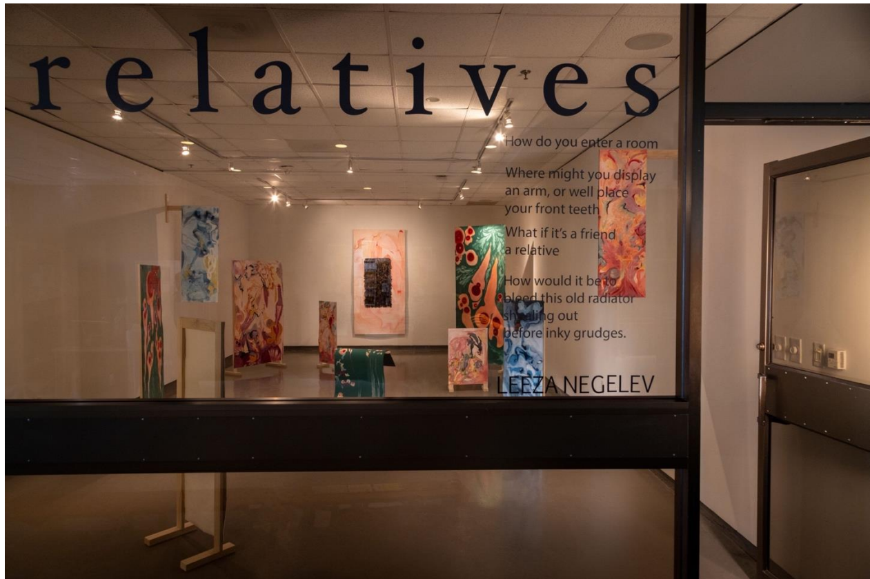
Figure 6.3 Leeza Negelev, Installation View 3

organic forms offered exactly that. Similarly, the wild texture of raw, dark wool interrupted the sea of flat planes and right angles.