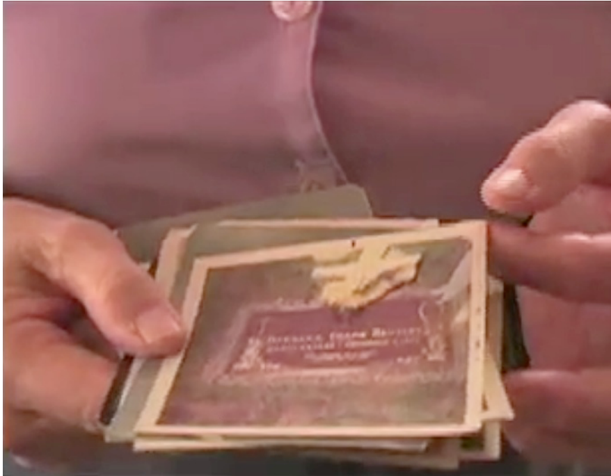
Figure 1: Film Still 1 – From Keeping Barbara : Grandma Holding Barbara's Grave Photograph

Although in the process of creating Looking Back time is spent converting analog family records into digital copies, therefore preserving what memory remains from them, the larger concern is the inevitable reality that we all eventually will be entirely forgotten to time (Figure 1). Furthermore, the work exposes an inherited trait of collecting family documentation and my personal struggle to analyze the extensive amount that exists.