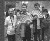
Closing Ceremony in 2009

The Closing Ceremony and Farewell Reception are the final event of the Summit. They are attended not only by the American visitors and Japanese volunteers, but also the host families and others who have connections with the summit. This is the start of the true grassroots exchange.