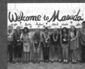
Local Sessions in 2013

The 11 local Sessions will be offered by 11 cities all over Oita prefecture. The participants will experience person-to-person exchange with their host and learn about the unique culture of the local area through this 4 days 3 nights program.