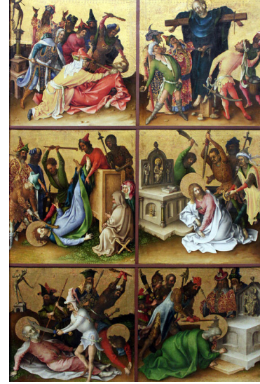
Fig. 7 Stephan Lochner, Martyrdom of the Apostles Altarpiece (right wing), 1435–40, oil on panel, 120 x 80 cm. Frankfurt, Städelches Kunstinstitut (artwork in the public domain)

endured such torments with stoicism. 45 Rather than wailing in agony, the martyrs meet their deaths with calm, and sometimes even joyous, acceptance of suffering. In the fifteenth century, the faithful could draw upon numerous stories of saints who died happily for their faith. The story of Saint Lawrence was perhaps one of the best known thanks to the martyr’s culinary simile regarding his own condition. After being placed on the gridiron, the saint taunts his tormentors: