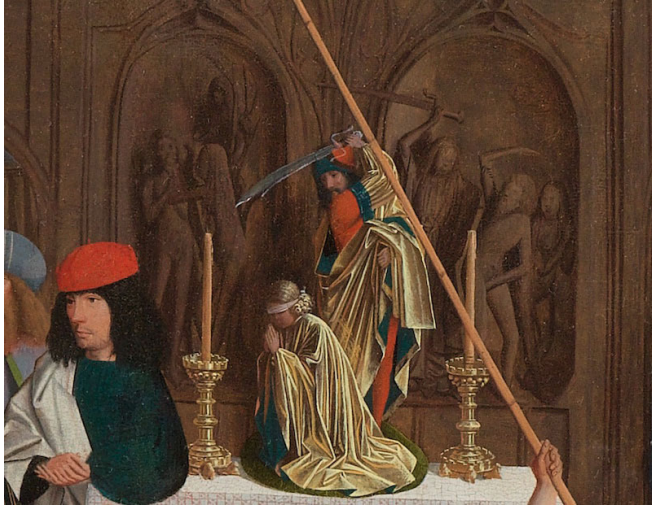
Fig. 8 Geertgen tot Sint Jans (or workshop), Rood screen with the Temptation of Adam and Eve and the Expulsion of Adam and Eve from the Garden of Eden, detail of fig. 1.

Christ, which Isaac's act prefigures. In the Expulsion scene, to the right, Adam and Eve gesticulate wildly as they flee the angel who brandishes a sword in warning. Their lack of stoicism amplifies their moral and spiritual weakness. Isaac, in contrast, does not flinch as Abraham prepares to administer a mortal blow--a gesture that mimics the raised sword of the angel banishing Adam and Eve--but instead prays quietly as he awaits death. Isaac's impassivity acts as a marker of his virtuousness and spiritual rectitude. His calm, prayerful response to what awaits him, and his willingness to die if it is God's will, echoes outward (and forward through time) as it amplifies the monastic and crusader virtues of the trio assembled below him. Although not yet as stoic as Isaac, the three boys in the Amsterdam Holy Kinship approach the instruments of their bodily torment in a joyous manner that contrasts with the horror that Adam and Eve display in the face of the punishment they have earned. Rather than being a sign of childishness, like the book-defacing boy depicted in Massy's 1507-8 version (see fig. 2), the playful attitude of John, James, and Simon (fig. 5) allows them to face their future deaths as calmly as Isaac because they have faith and hope in God's mercy and in the eternal salvation that rewards their sacrifices.