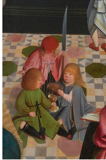
Fig. 5 Geertgen tot Sint Jans (or workshop), James the Greater, John the Evangelist, and Simon, detail of fig. 1.