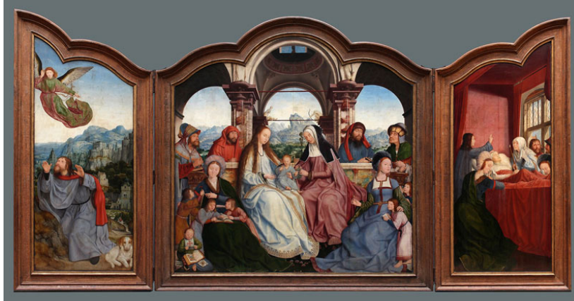
Fig. 2 Quentin Massys, Saint Anne Altarpiece , 1507–8, oil on panel, (center) 219 x 224.5 cm, (each wing) 220 x 92 cm. Museum of Fine Arts, Brussels (artwork in the public domain)