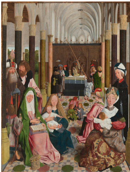
Fig. 1 Geertgen tot Sint Jans (or workshop), Holy Kinship , 1496, oil on oak, 137.2 x 105.8 cm. Rijksmuseum, Amsterdam, inv. no. SK-A-500 (artwork in the public domain)

Three children play at the center of the Amsterdam Holy Kinship , which is attributed to Geertgen tot Sint Jans or his workshop. This seemingly quotidian subject is remarkable because it shows future martyrs engaged in a game of make-believe using the implements of their torments. In this paper, I argue that the activity occupying the boys offers an invitation to spiritual play that addressed viewers and asked them to find joy in the promise of God's divine mercy and justice despite life's hardships. Given the subject matter and the identity of the artist's primary employer, it is probable that the audience included the Knights of St. John Hospitaller, an order of crusading monks, also known as the Johanniters, in Haarlem. The invitation offered in the panel not only addressed the daily work of being a monk but also offered encouragement to the Haarlem knights during a controversial period. DOI: 10.5092/jhna.2015.8.1.1