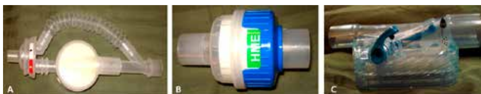
Figure 1. HMEs designed for aerosol delivery during mechanical ventilation. A: Circuitvent HME/HCH bypass (Smiths-Medical Keene, NH) with Gibbeck Humidivent Filter Light 5 inline (Hudson RC, Arlington Heights, IL). B: Humid-Flo HME (Hudson RC, Arlington Heights, IL). C: Airlife bypass HME (Carefusion, San Diego, California). (Reproduced with permission, from Reference 70)

Optimum Technique with Nebulizers: Jet nebulizers are operated continuously by pressurized gas or intermittently by a separate line connected to the ventilator which provides driving pressure and flow to the nebulizer. During intermittent operation (aka nebulizer function on the ventilator), the ventilator operates the nebulizer only in inspiration, thus reducing aerosol loss during expiration. When nebulizer function is used for aerosol therapy during mechanical ventilation, the ventilator compensates for the flow to the nebulizer to maintain constant tidal volume and minute ventilation. Although jet nebulizers are often operated continuously, it has been shown that intermittent nebulization increases aerosol deposition more than continuous nebulization during mechanical ventilation. 51,66 However, it must be noted that the lower pressure of the driving gas may affect the aerosol characteristics and delivery efficiency of a nebulizer operated through the ventilator. For instance, operating a nebulizer with a lower driving pressure (<15 psi) through a ventilator instead of using pressurized gas (≥50 psi) may generate larger particles and decrease the efficiency of the nebulizer. 40 However, it has been reported that the newer