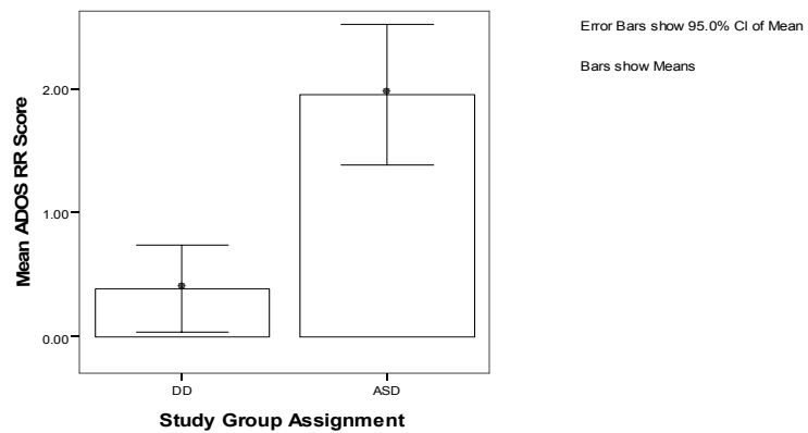
Figure 1. Mean ADOS Domain Scores and 95% Confidence Intervals for Diagnostic Groups.