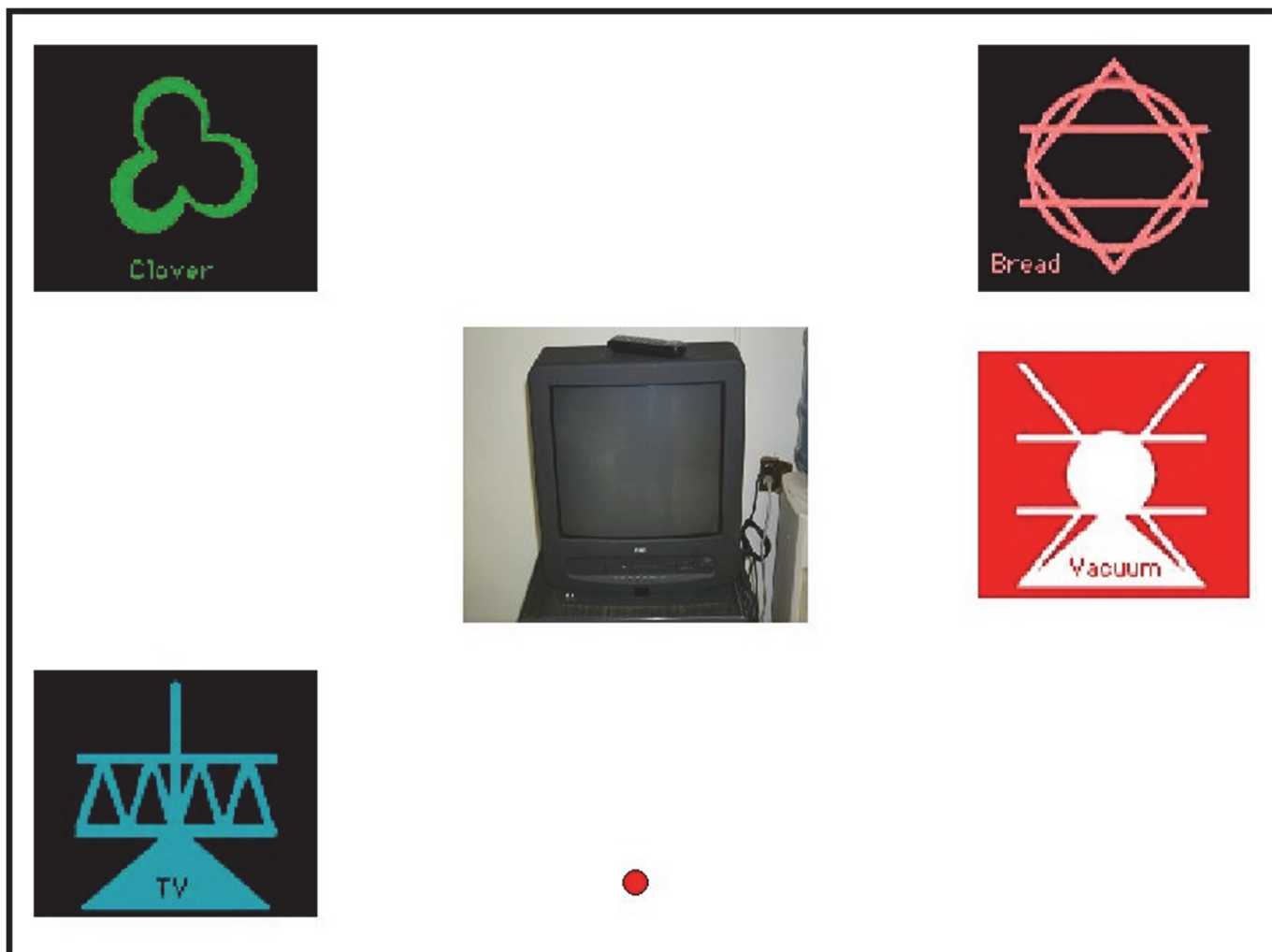
Fig 1. An example trial. The sample is at center (TV) and the four match choices are presented around the perimeter of the screen. The chimpanzee must move the cursor into contact with one of the match choices to make a selection. For Panzee, auditory samples were played as .wav files, and then the four match choices appeared onscreen, with nothing in the center of the screen.