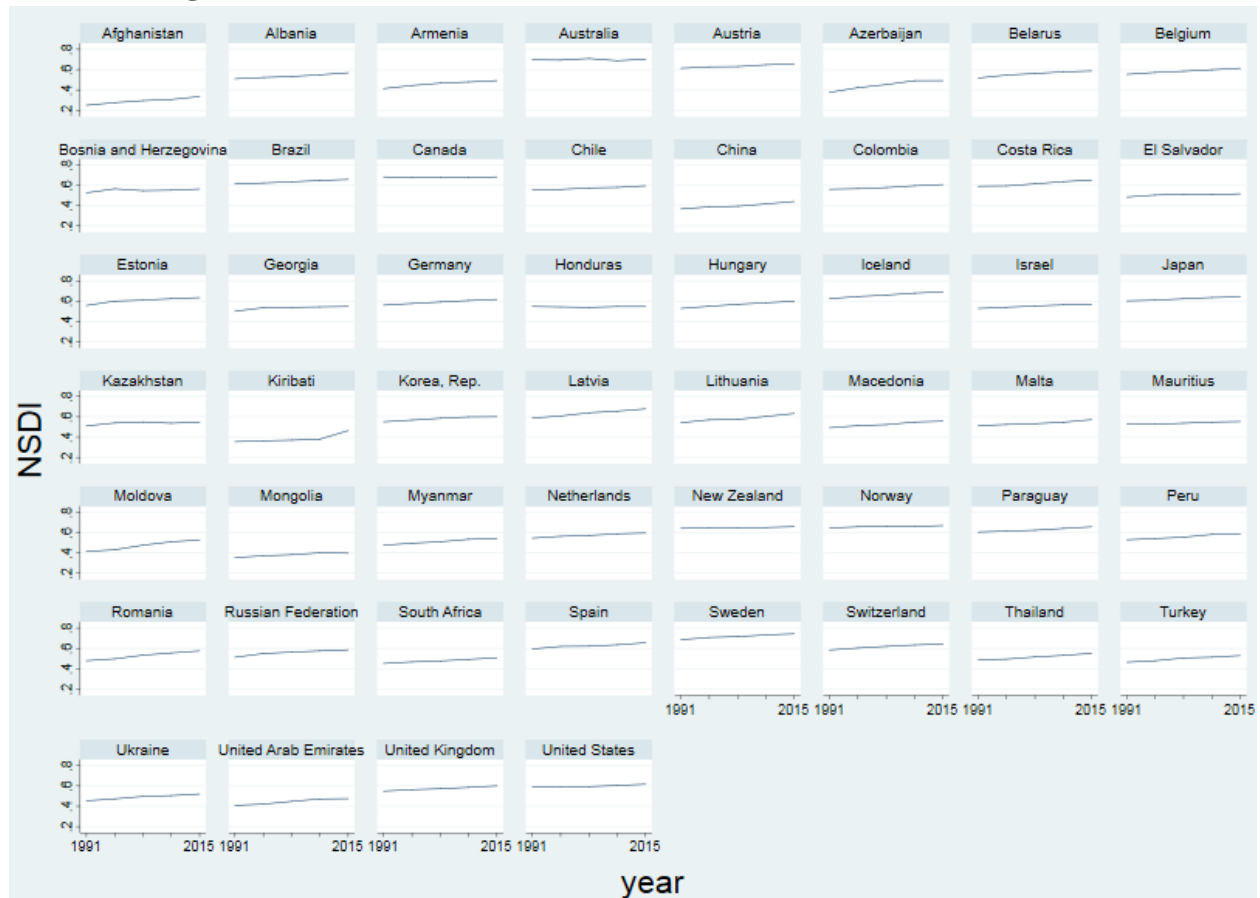
Figure A1. The NSDI of 52 Countries in the 5 Periods from 1991-2015